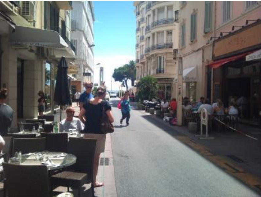
Street of the apartment