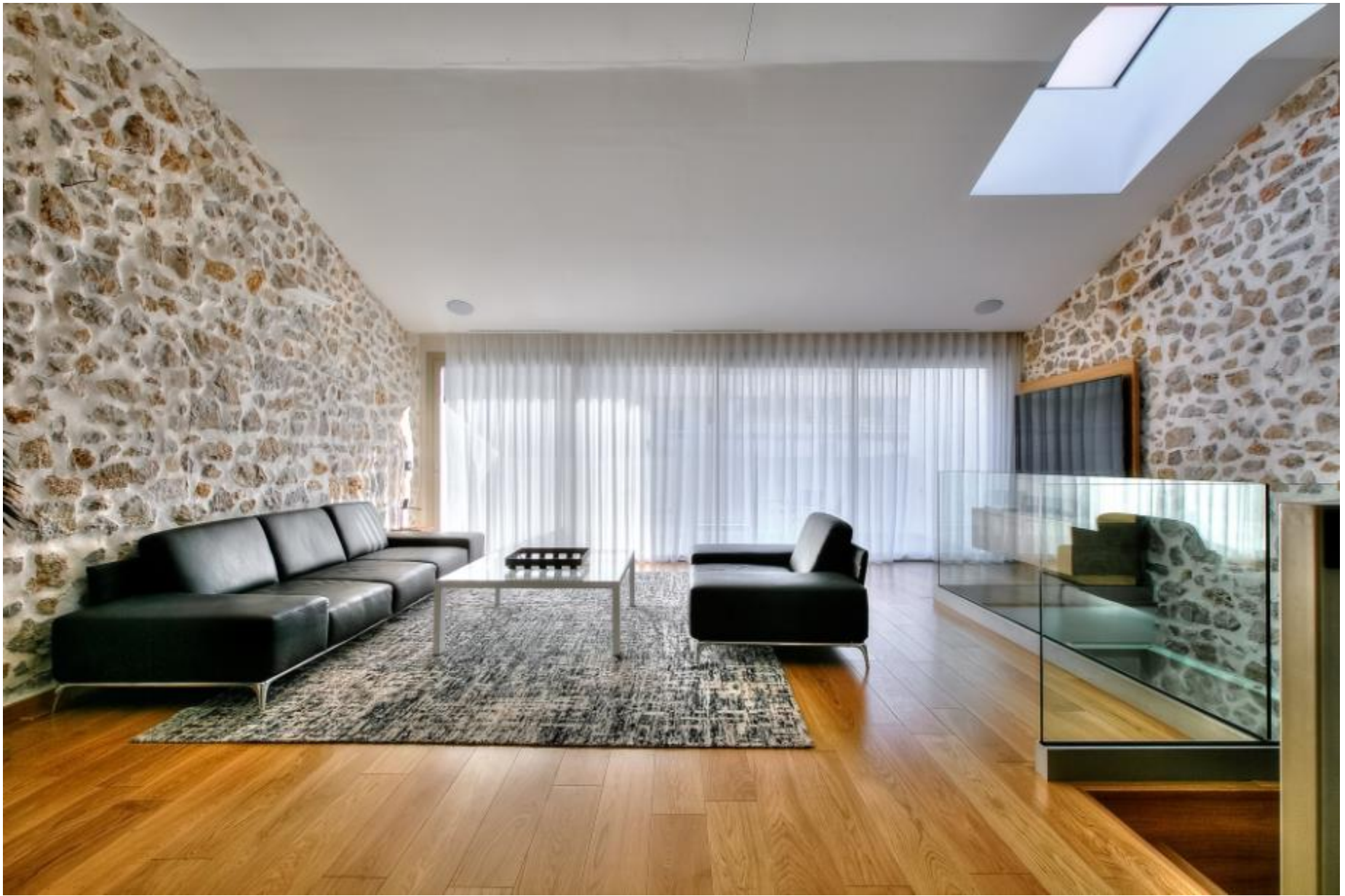
Large living room