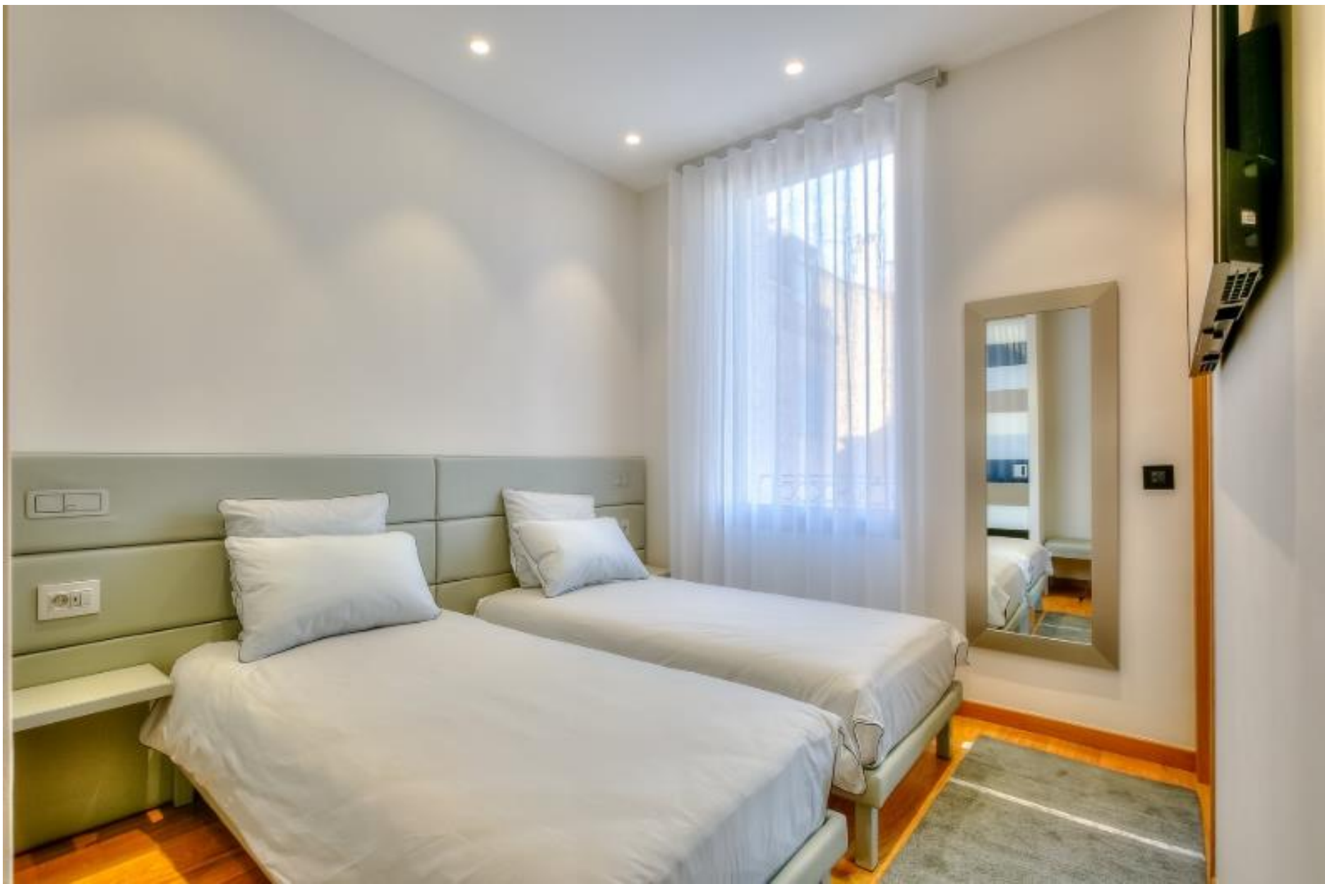
2 nd ensuite bedroom