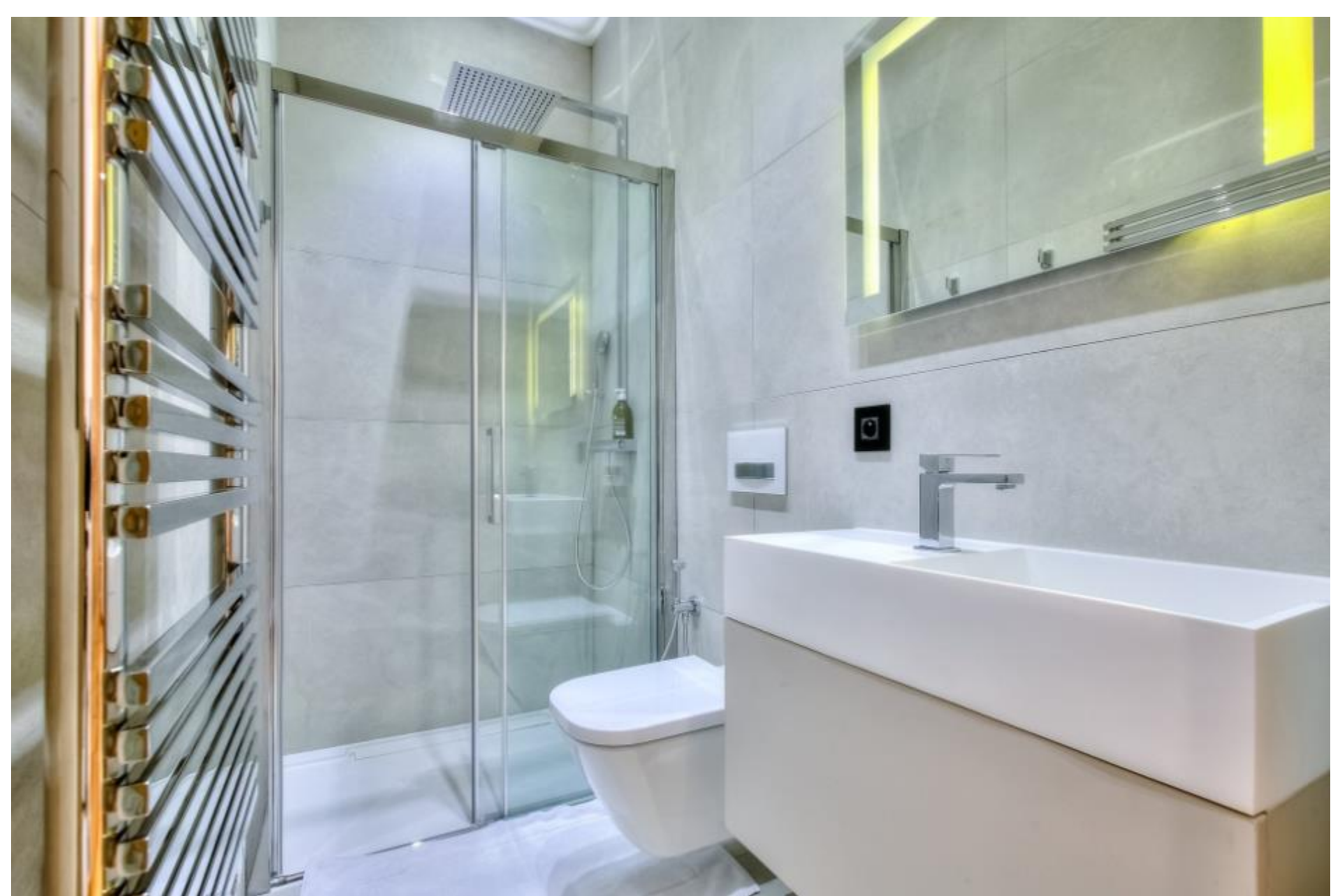
2 nd shower room