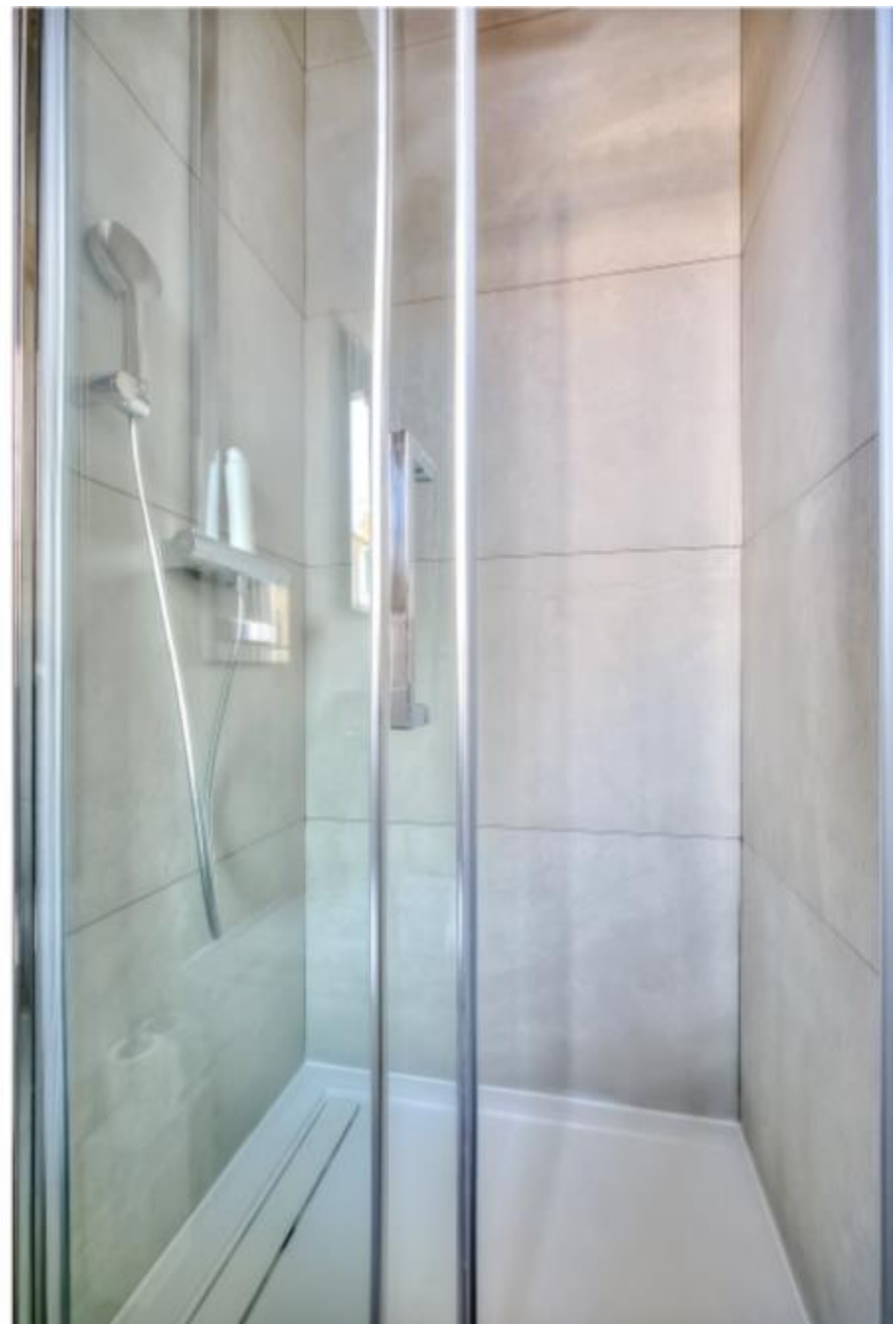
3rd Shower room