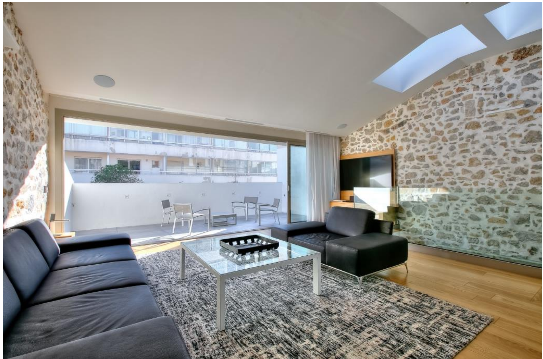
Living room opening onto the terrace