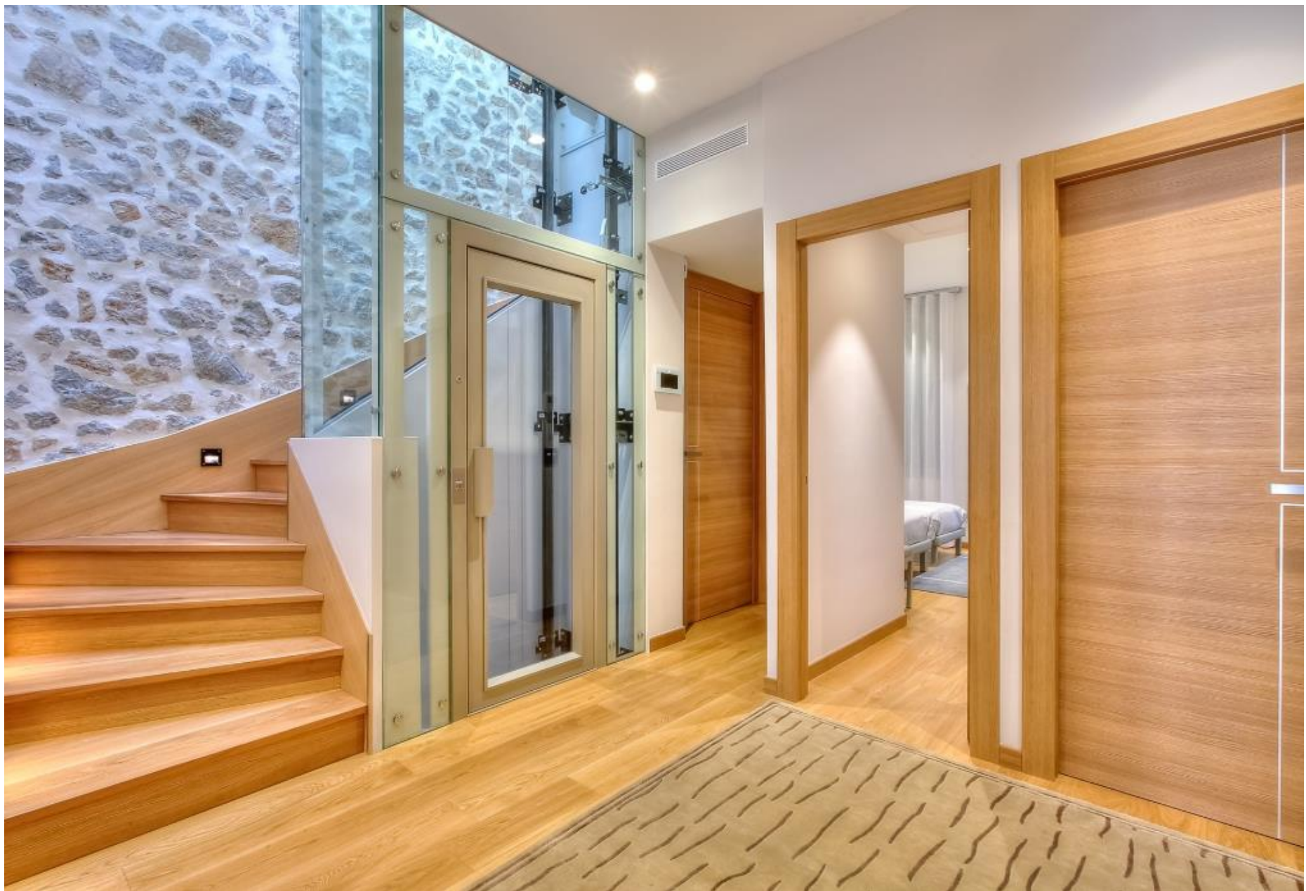
The entrance of the apartment with indoor elevator