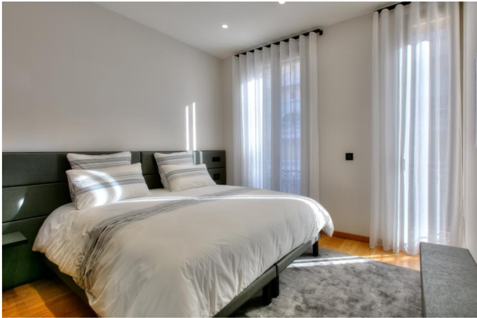
3rd ensuite bedroom