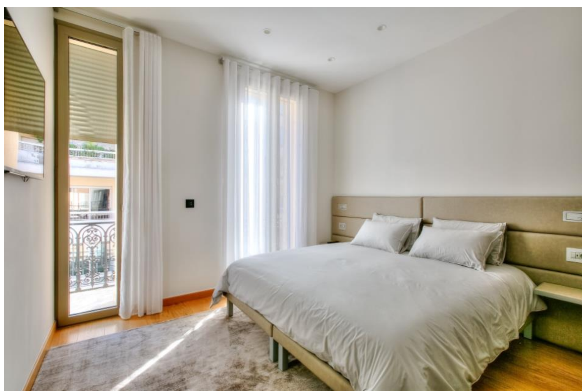
4th esnuite bedroom