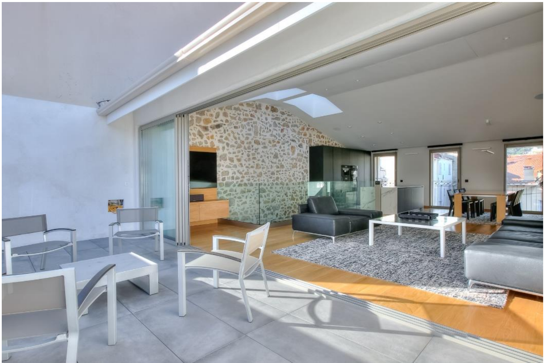
The whole top floor: view from the terrace