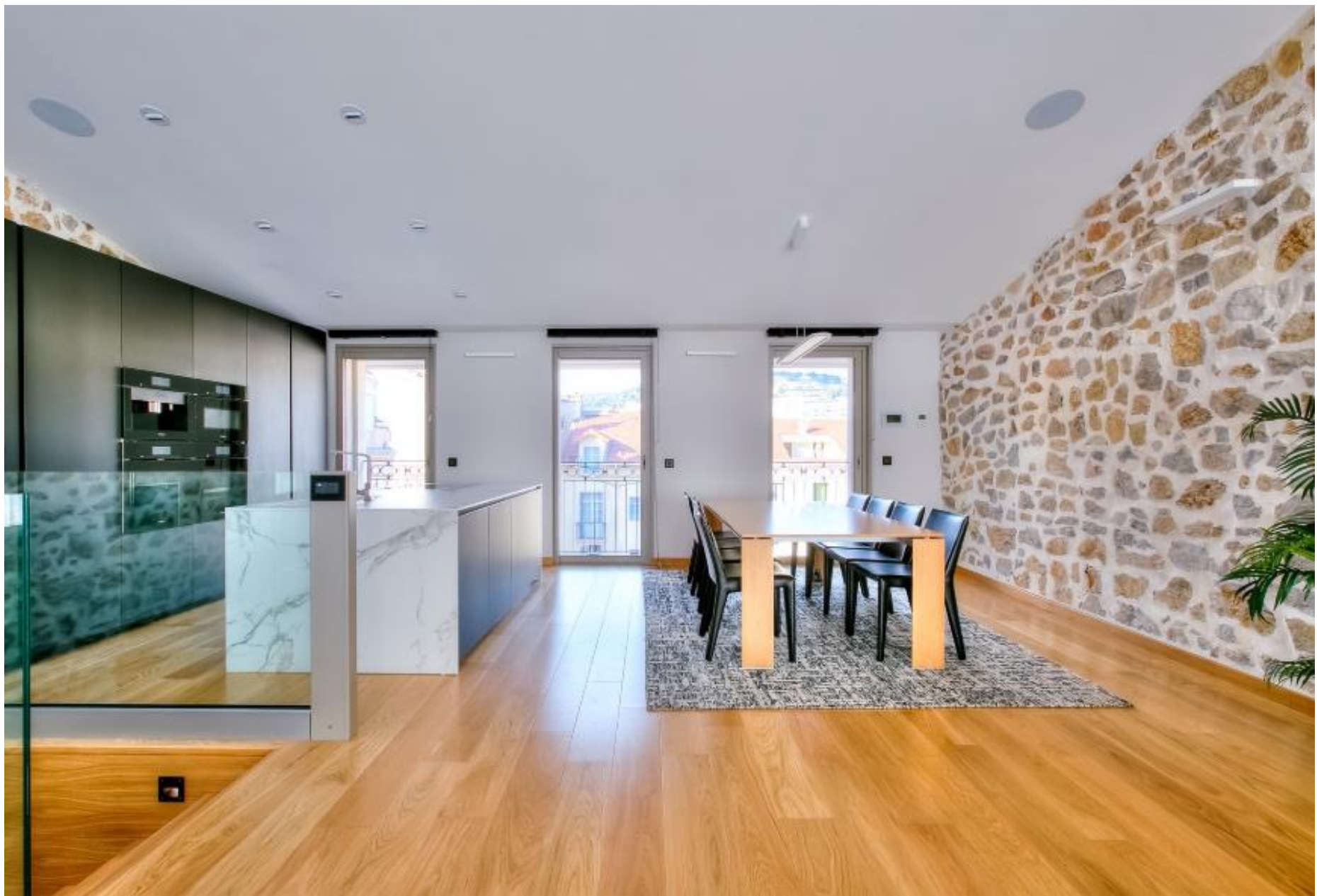
Another view of the dining area and US kitchen