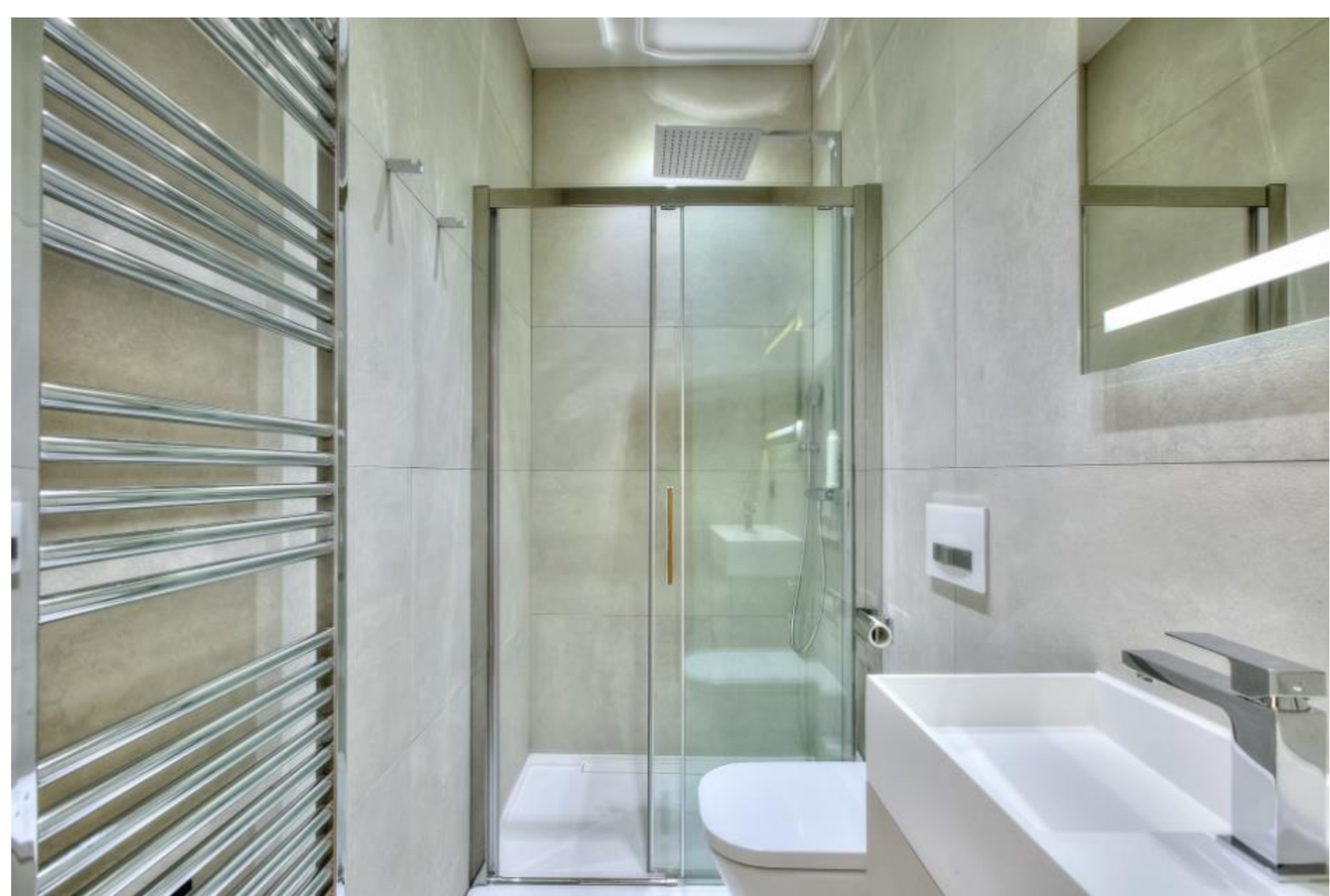
4th Shower room