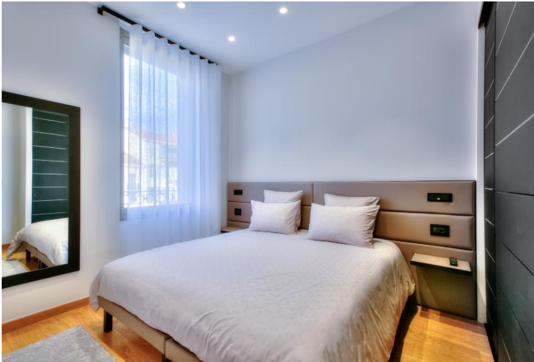
1st ensuite bedroom