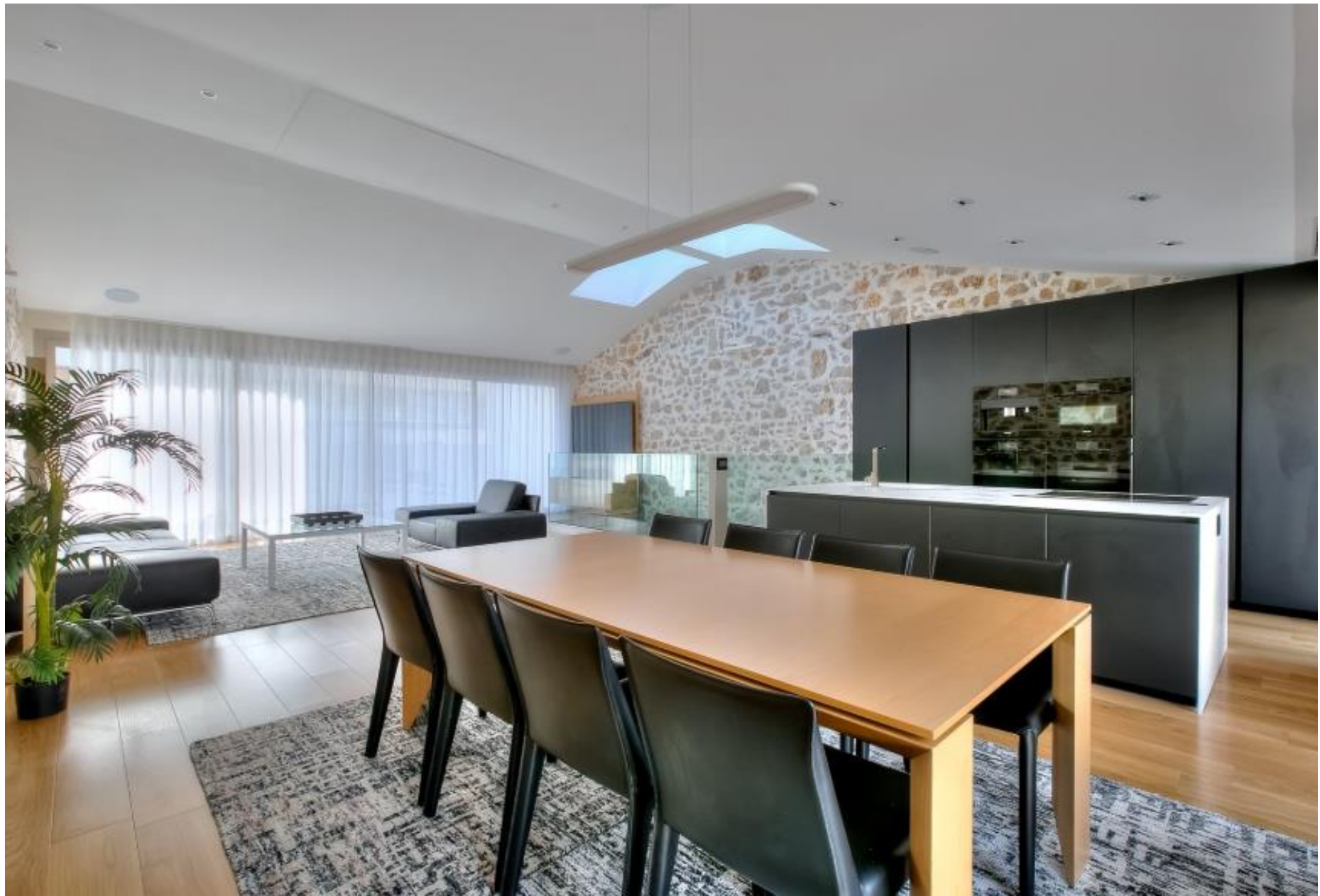
Another view of the living room with dining area & US kitchen