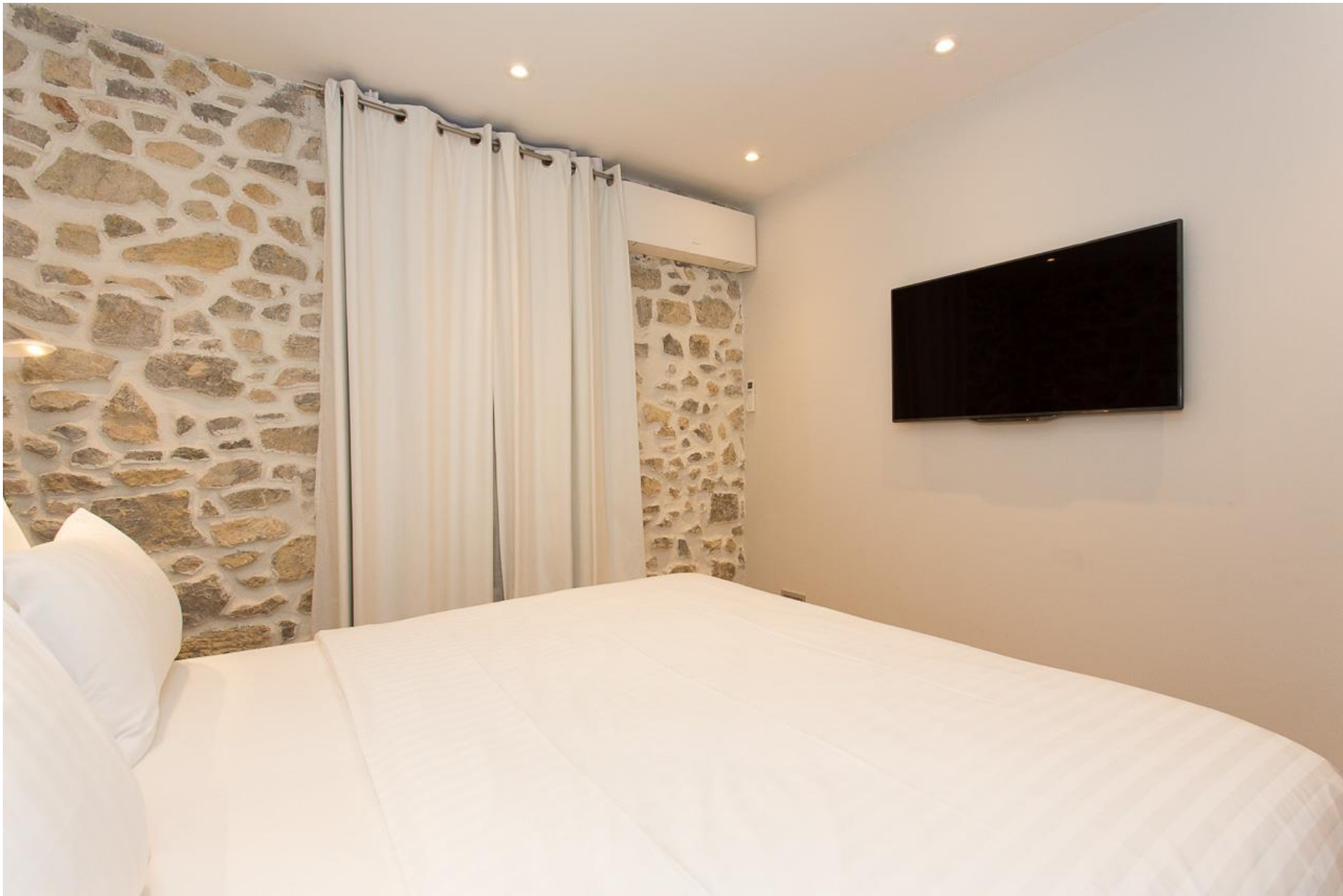
Another view of the 2 nd bedroom