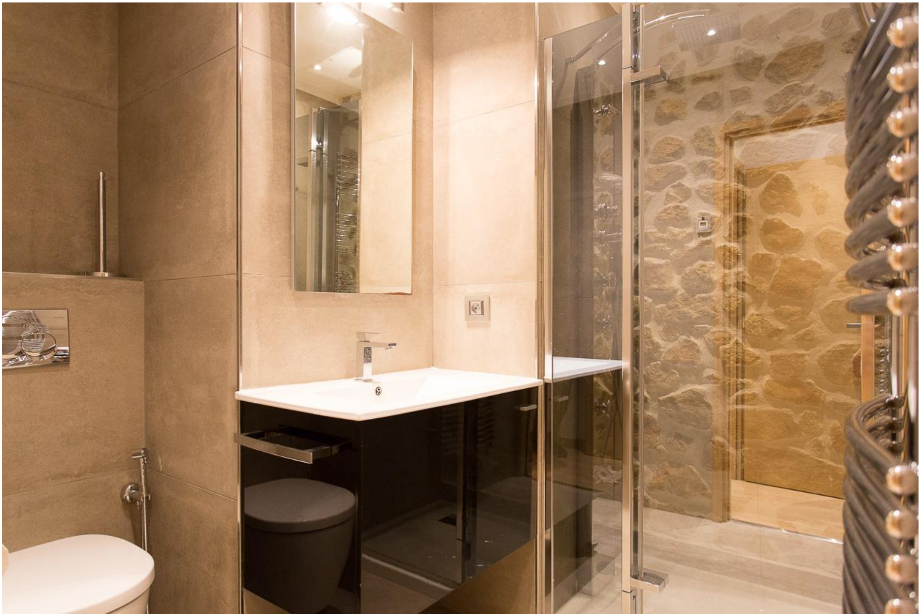
Shower room with toilets that belongs to the 2 nd bedroom