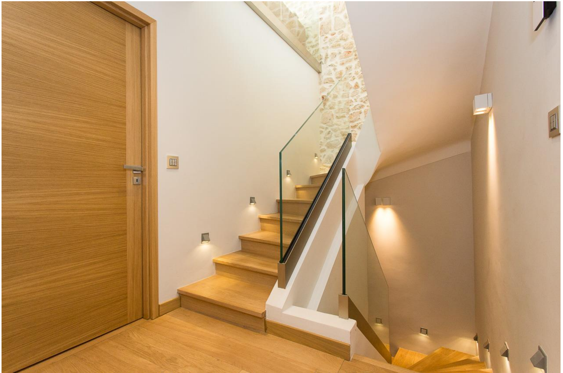
Staircase inside the apartment