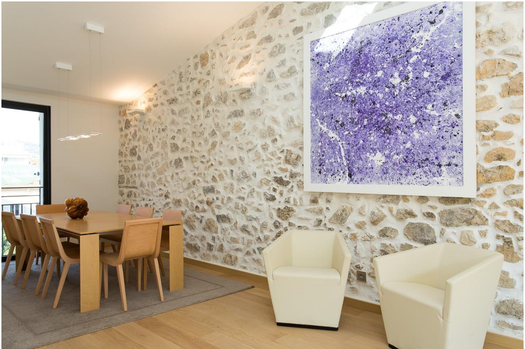
Zoom on the dining area