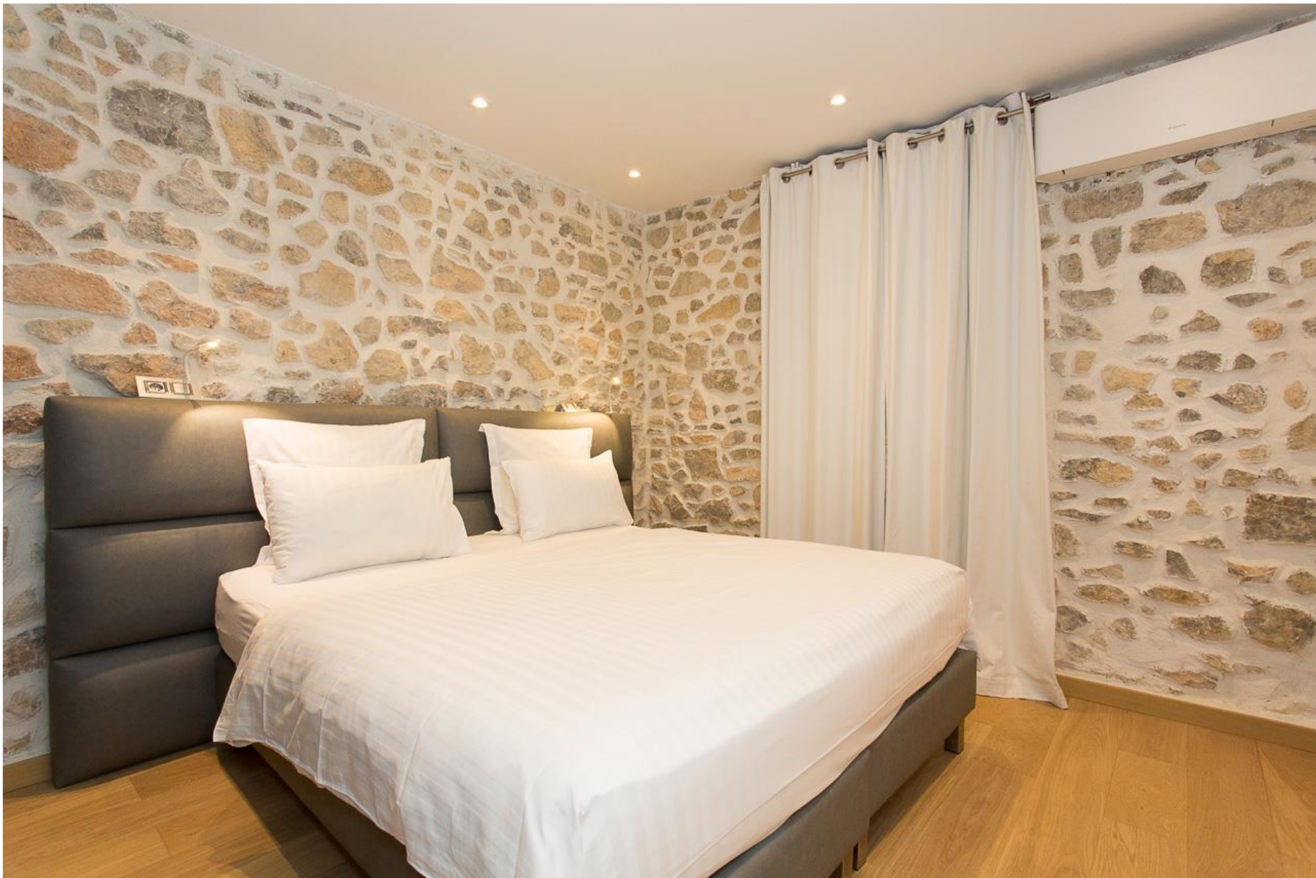
2 nd ensuite bedroom with TV & large cupboards