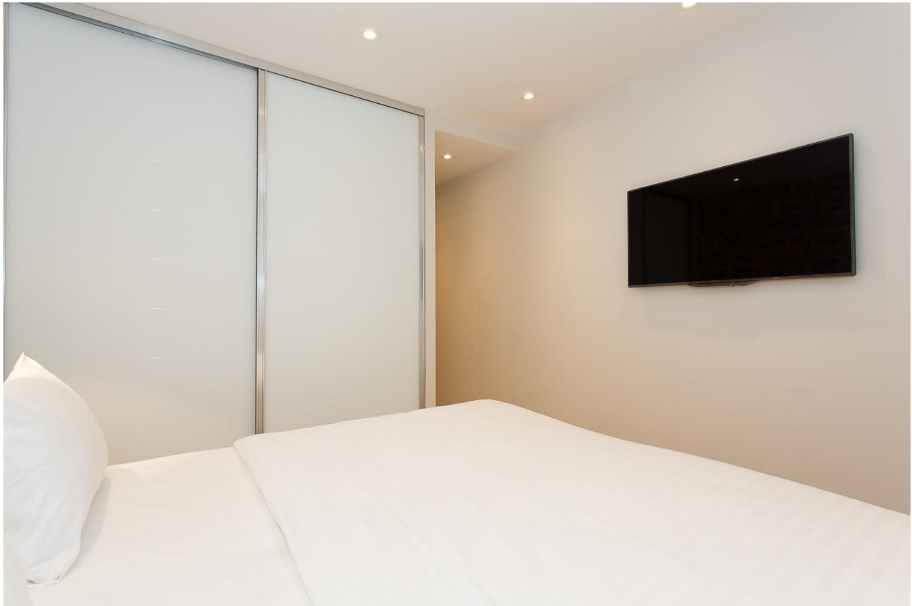
Another view of the 1st bedroom with cupboards & TV