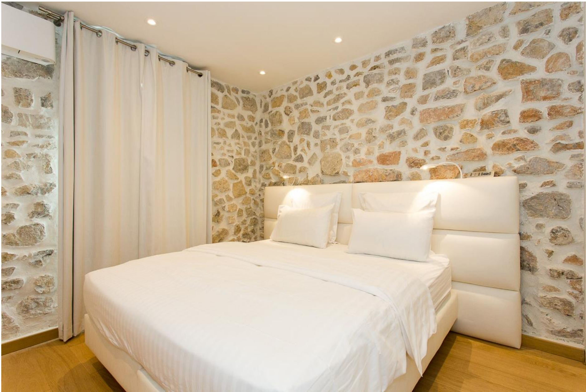
1st ensuite bedroom with cupboards