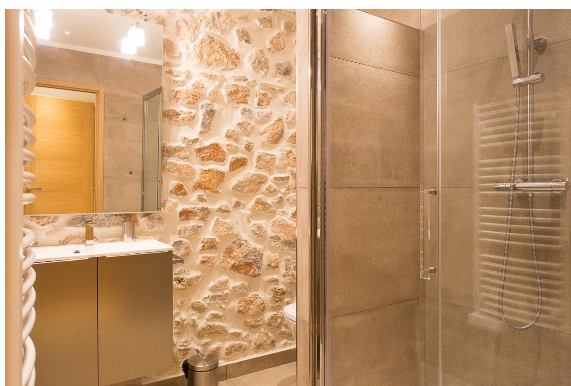
Shower room with toilets belonging to 1st bedroom