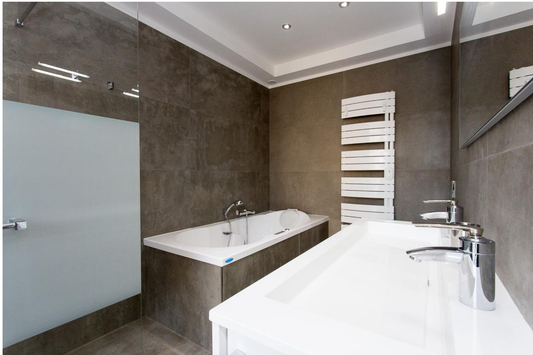
Bathroom that belongs to the 3 rd bedroom