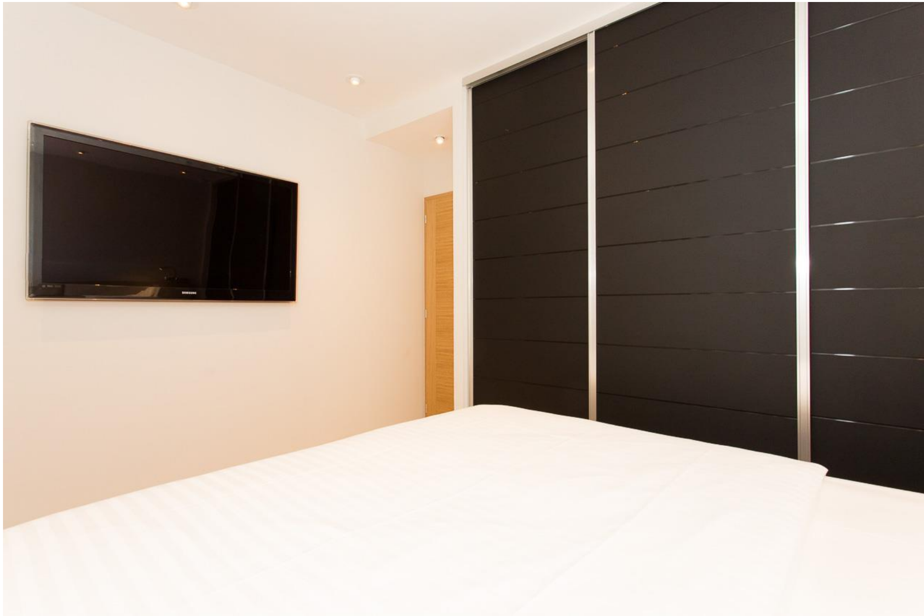
Another view of the 3rd bedroom with TV & cupboards