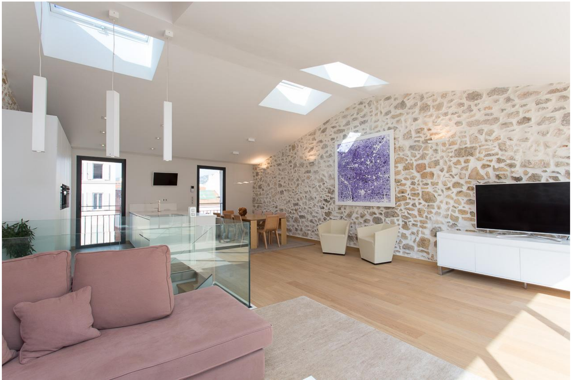
Another view of the main room