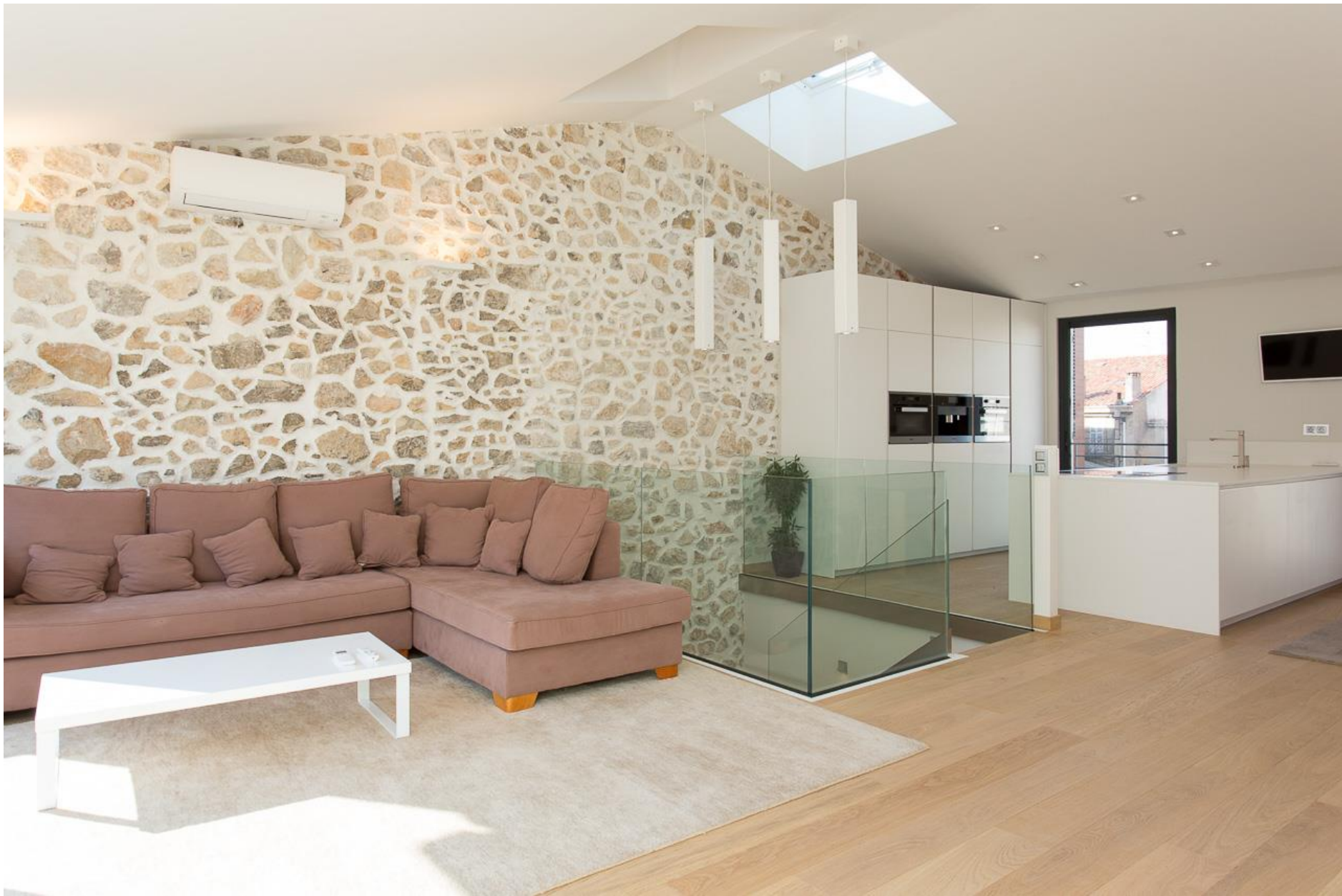
Another view of the living room with dining area & US kitchen