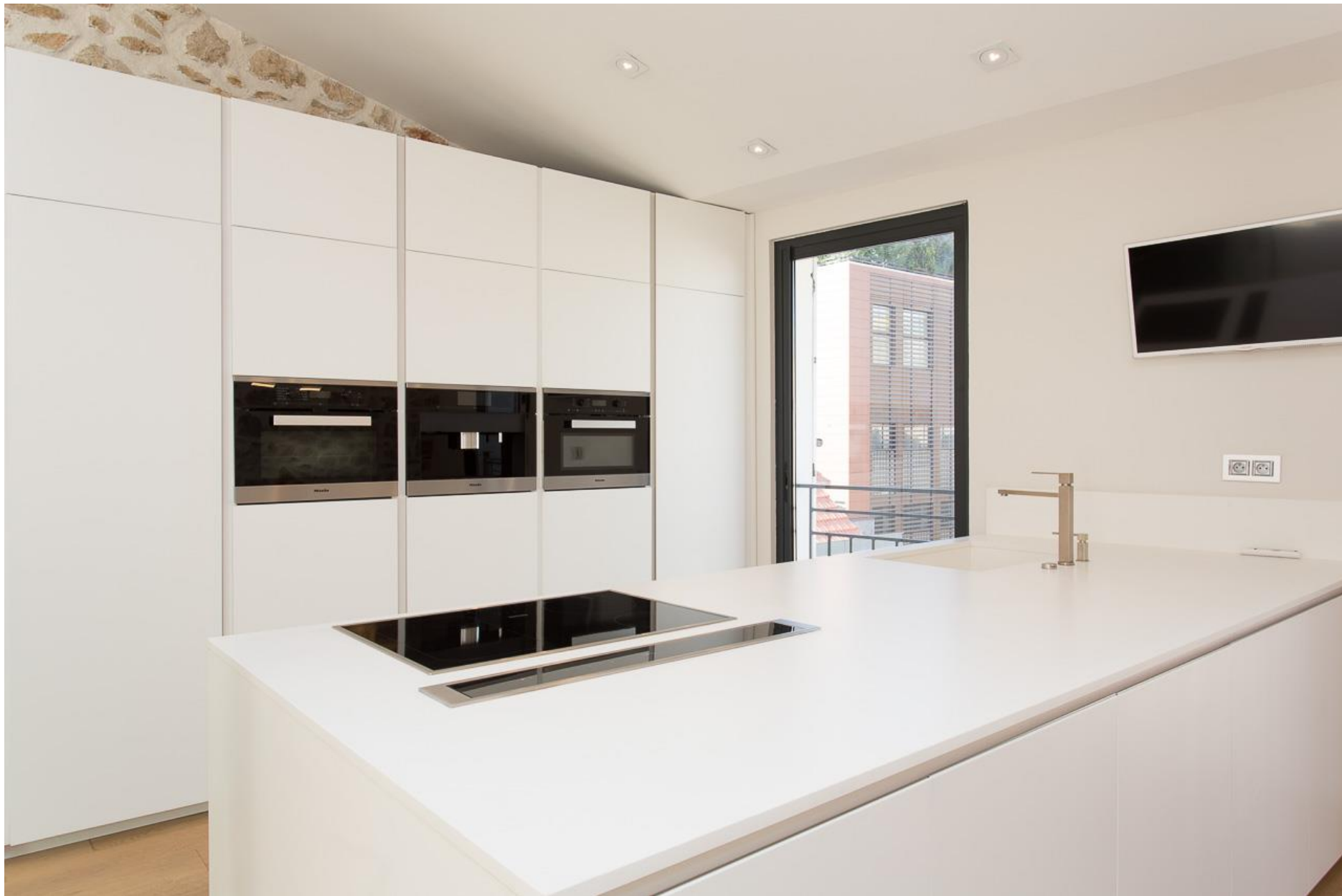
Zoom on the kitchen