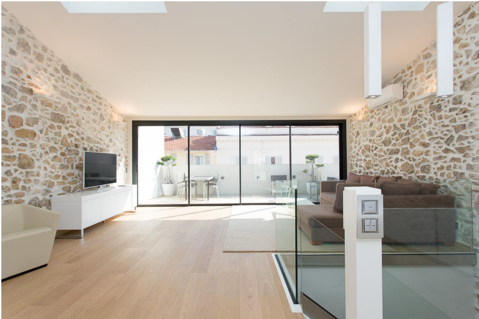
Large living room of 60sqm