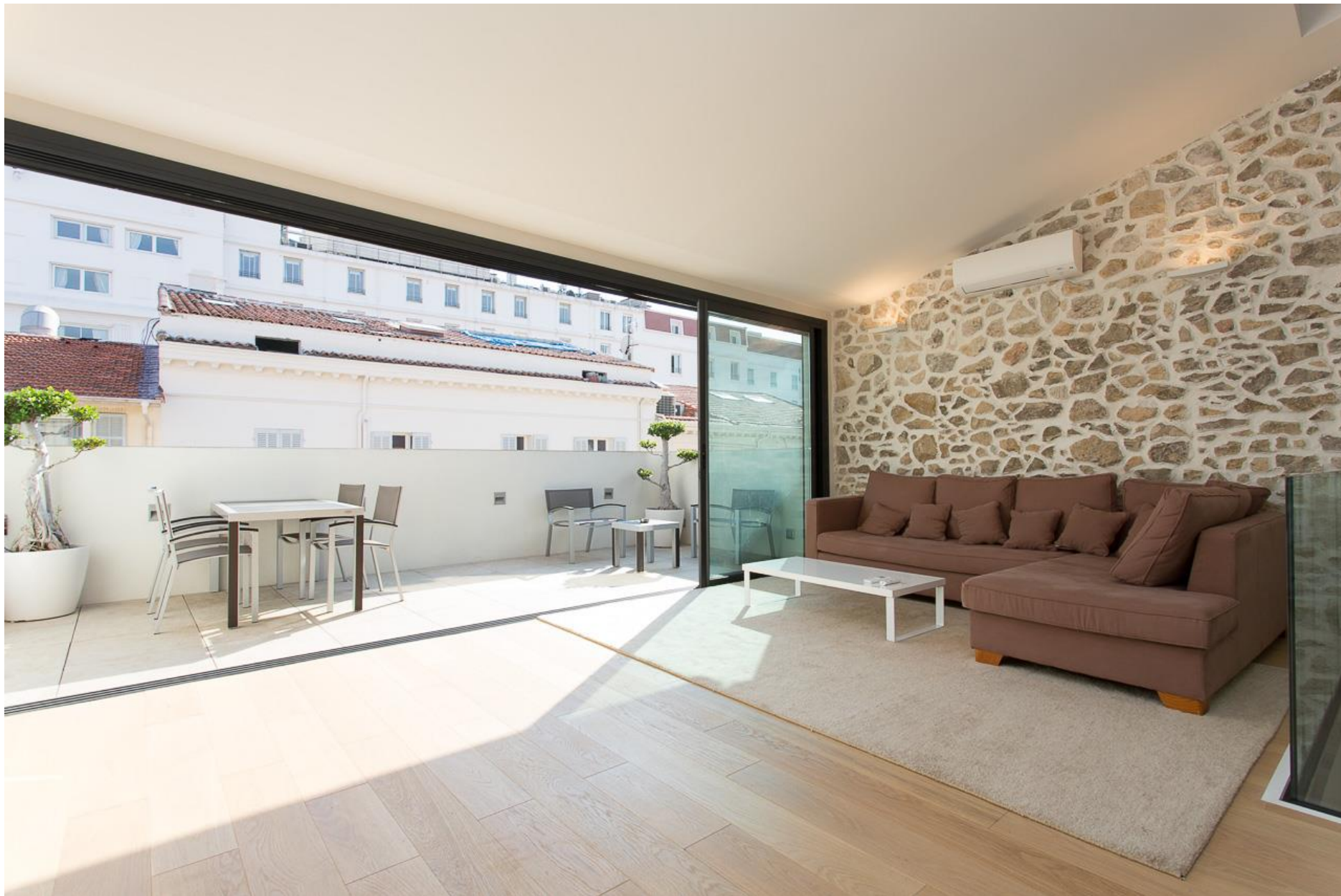
Living room opening onto the 16sqm terrace