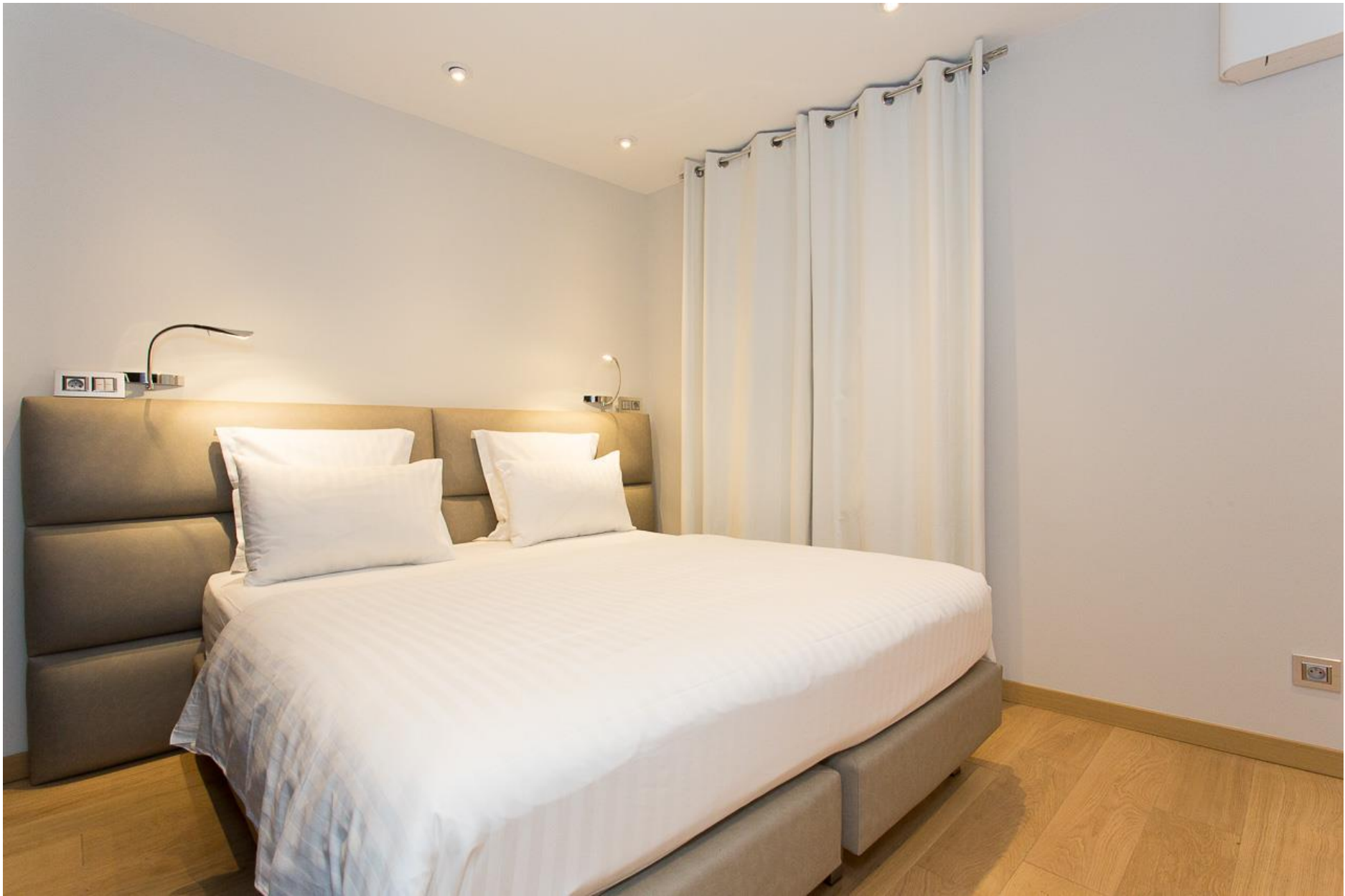
3rd ensuite bedroom with large cupboards & TV