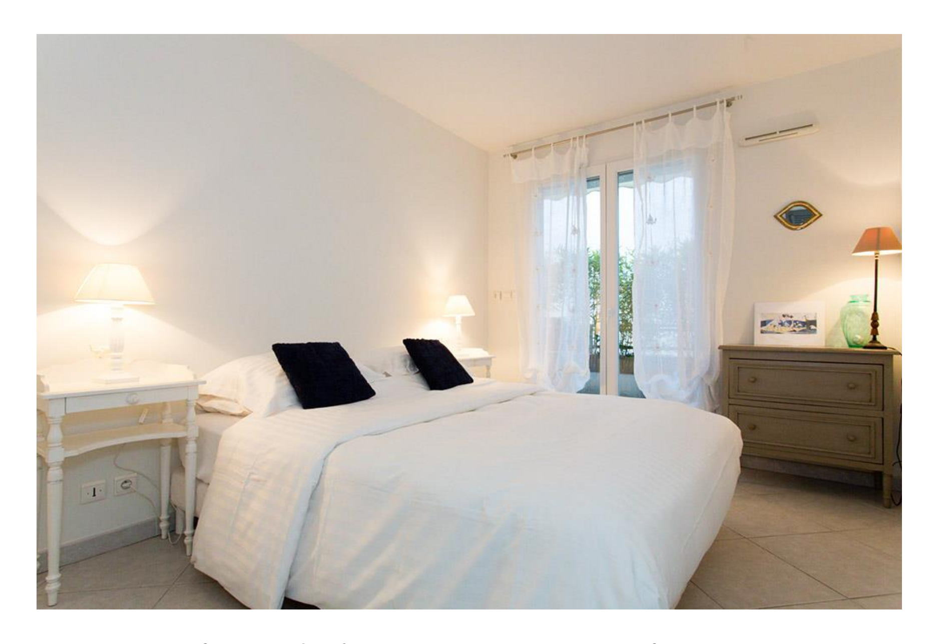
The 1st bedroom opening onto the terrace