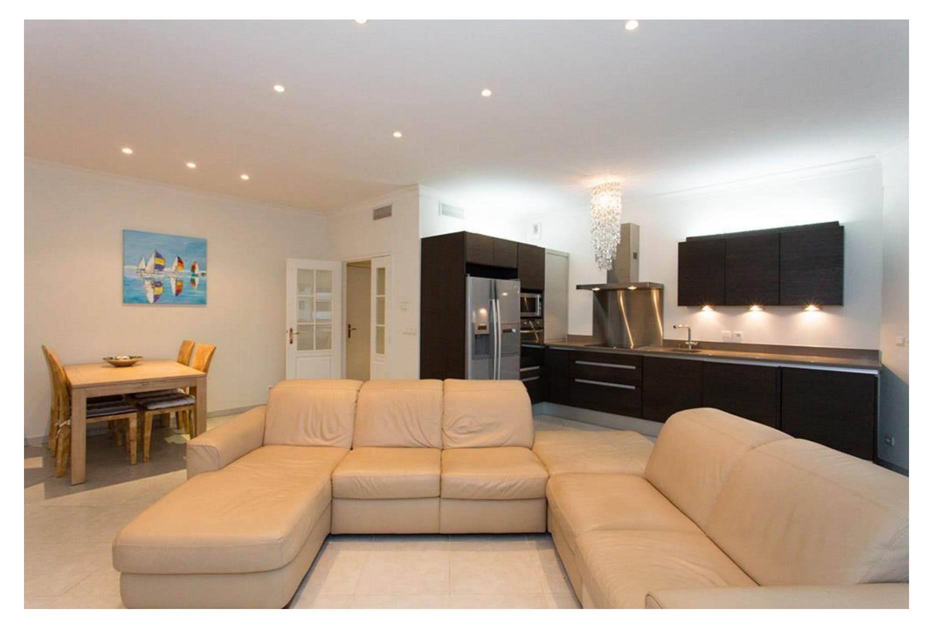
The living room with large couch & dining area