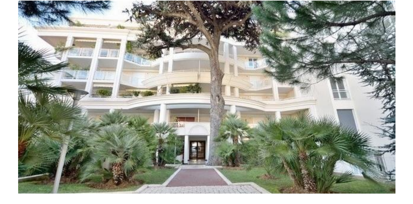
The residence: chic A safe!