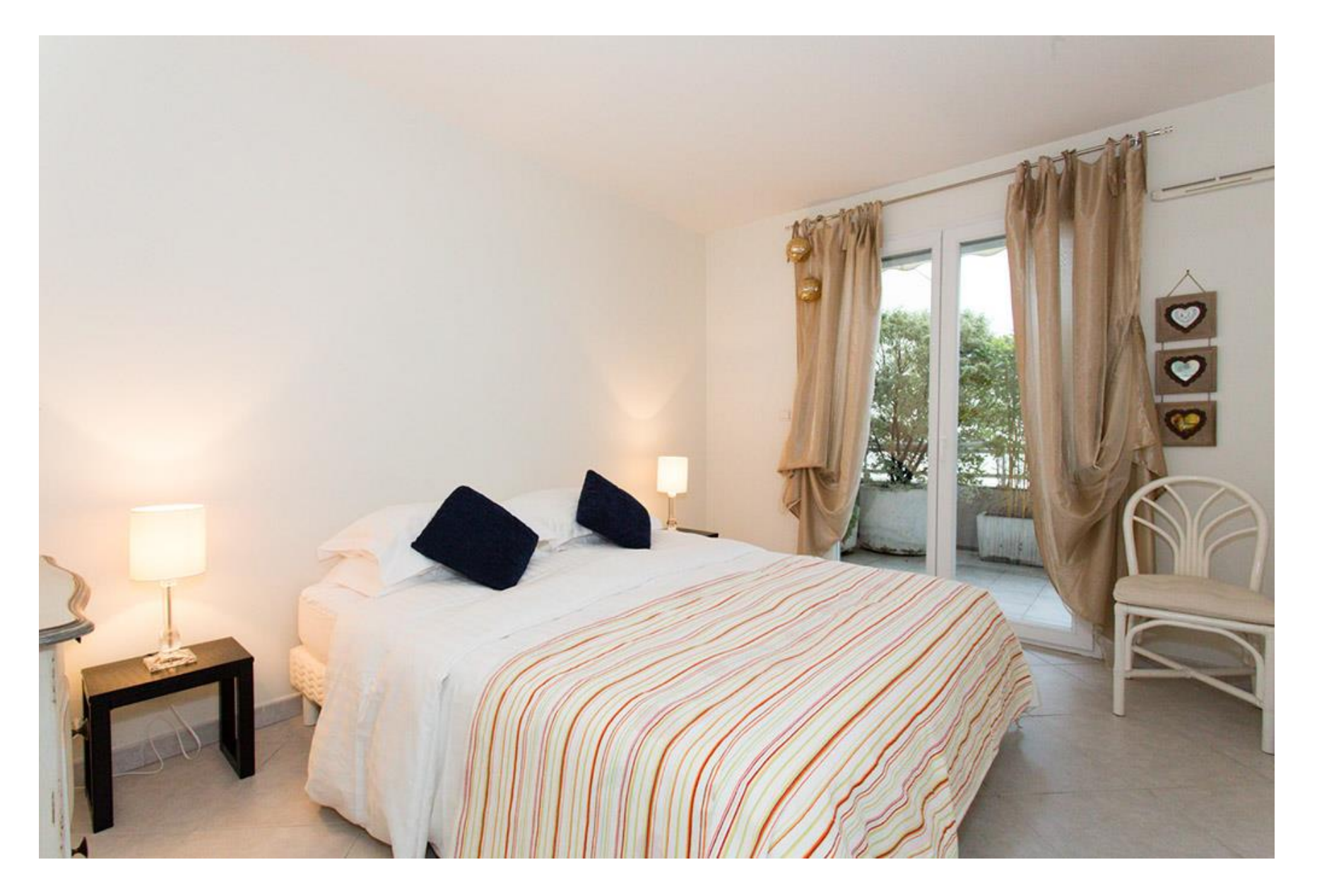
The 3rd bedroom opening onto the terrace