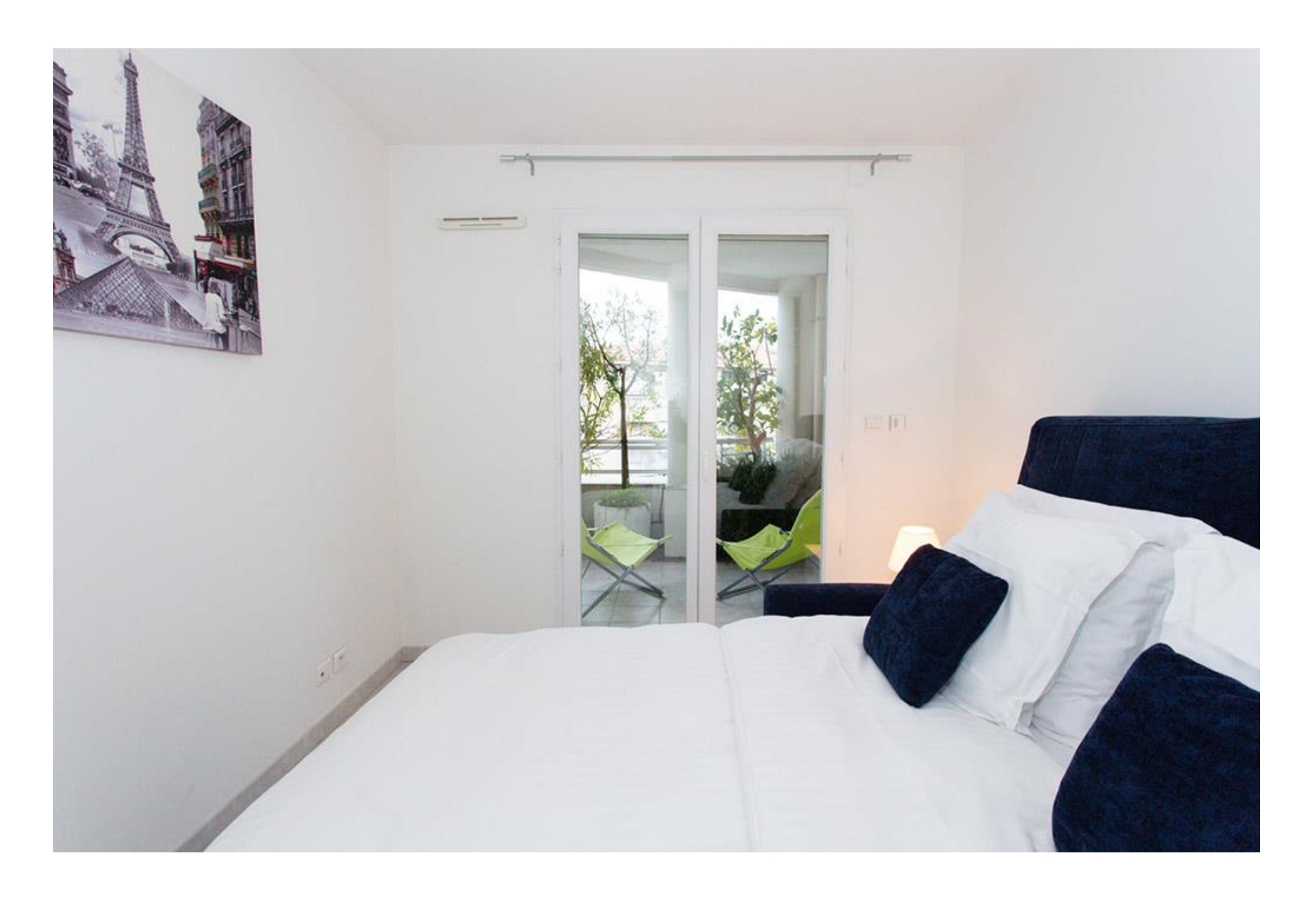
The 2nd bedroom opening onto the terrace