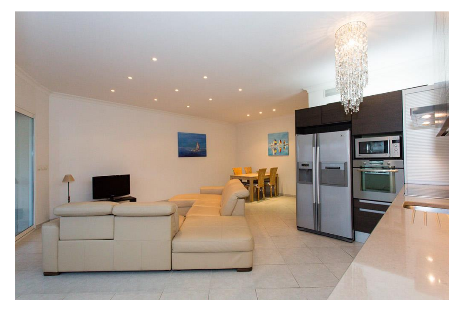
The living room with US kitchen