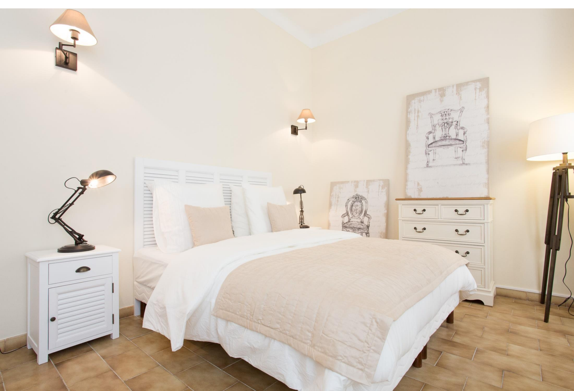
Another view of the 1st bedroom