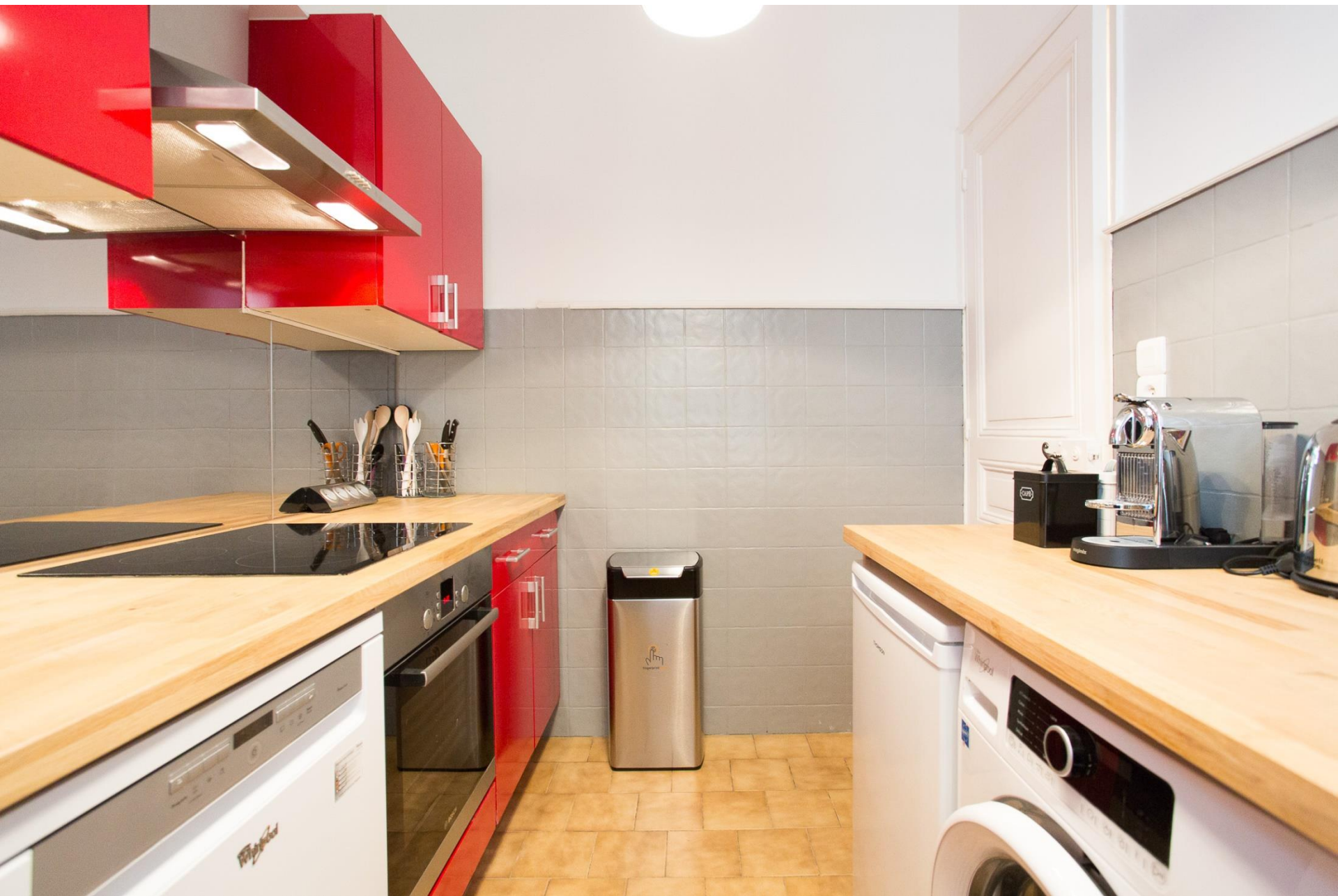
The fully equipped kitchen