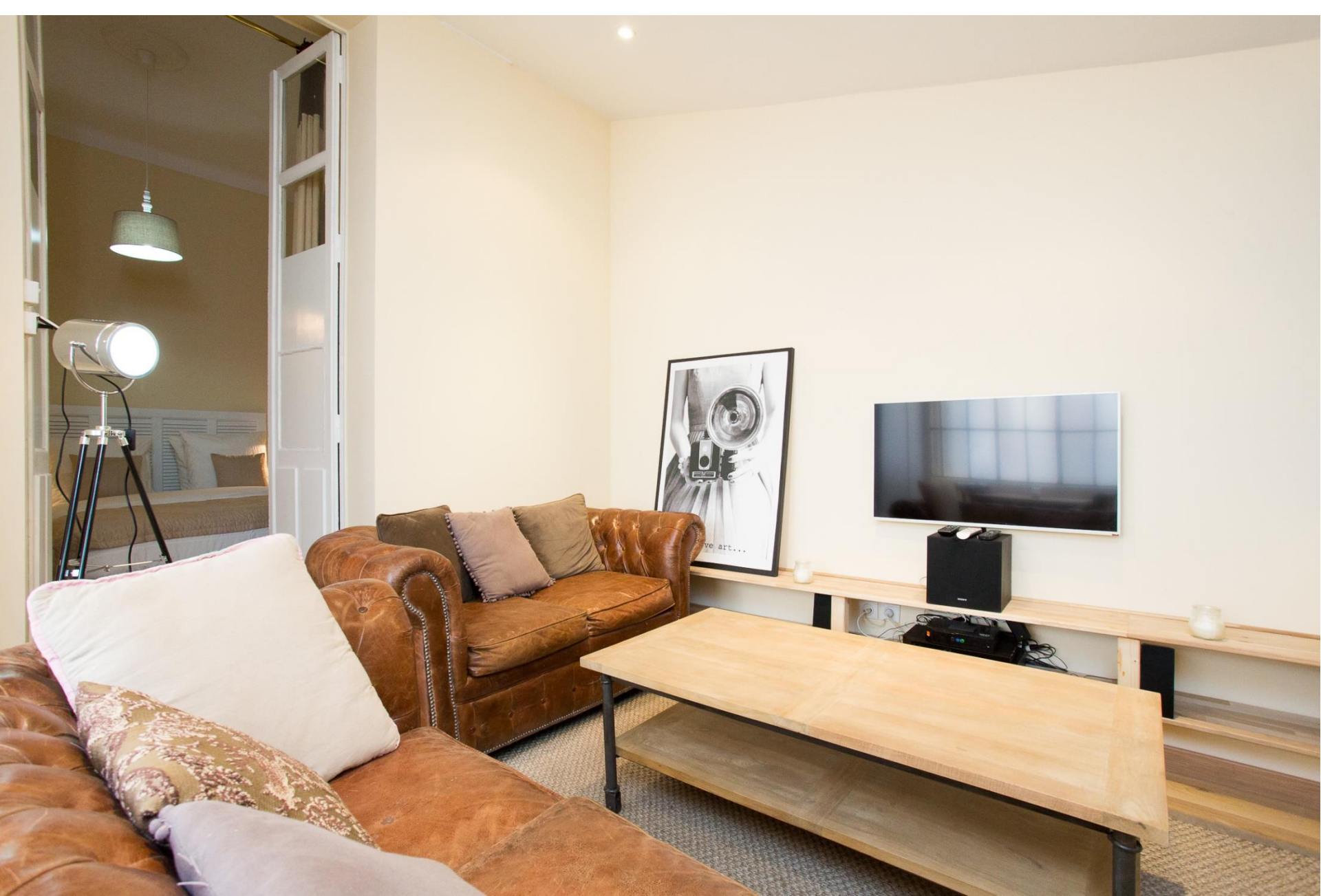
The lounge area with new & vintage couches & flat screen TV