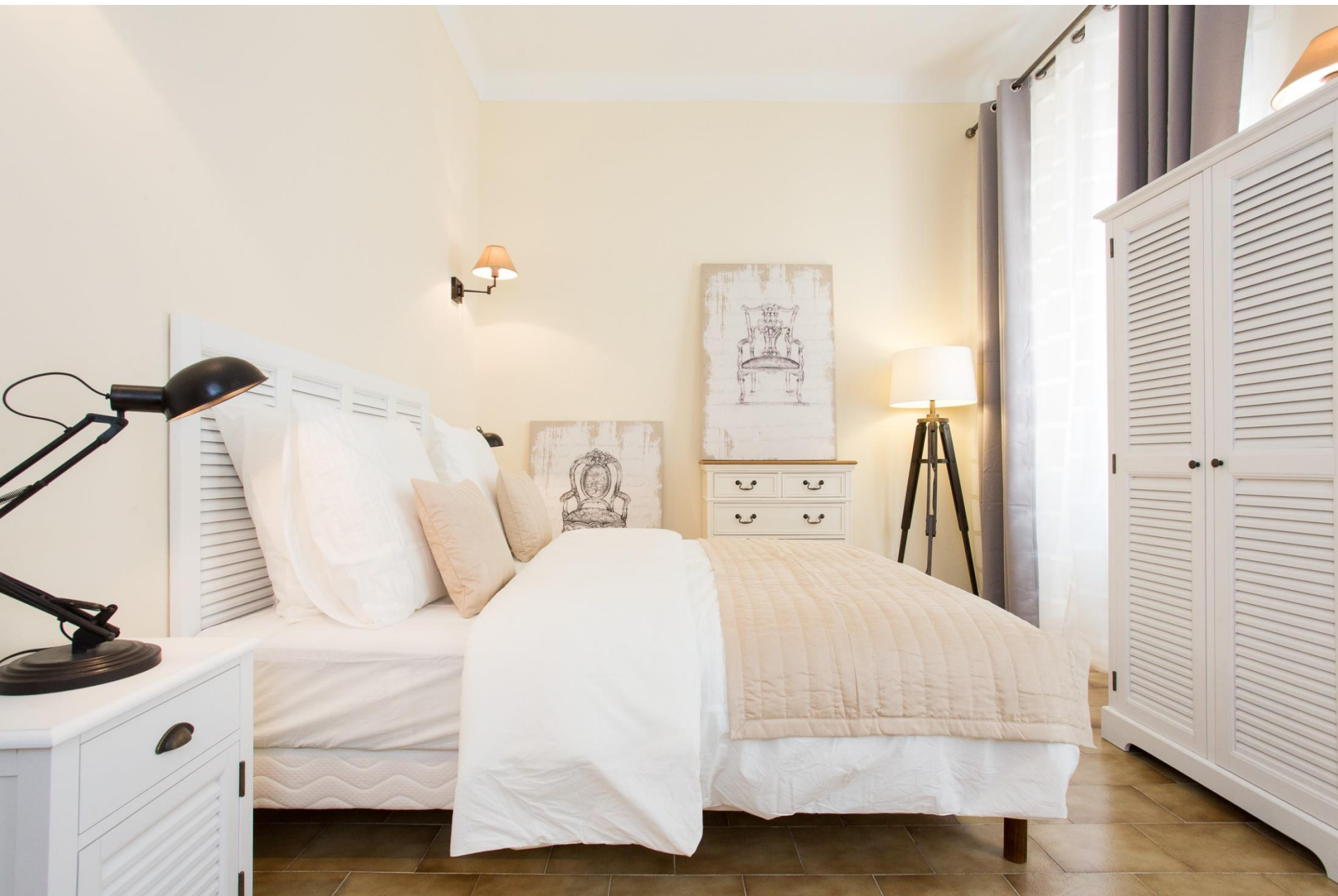
1st bedroom with 2 single beds that can be made as double & cupboards