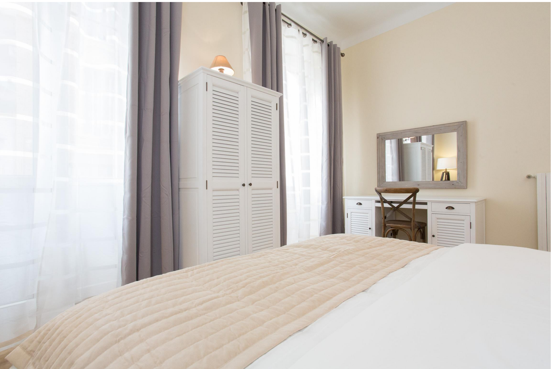
A last view of the 1st bedroom