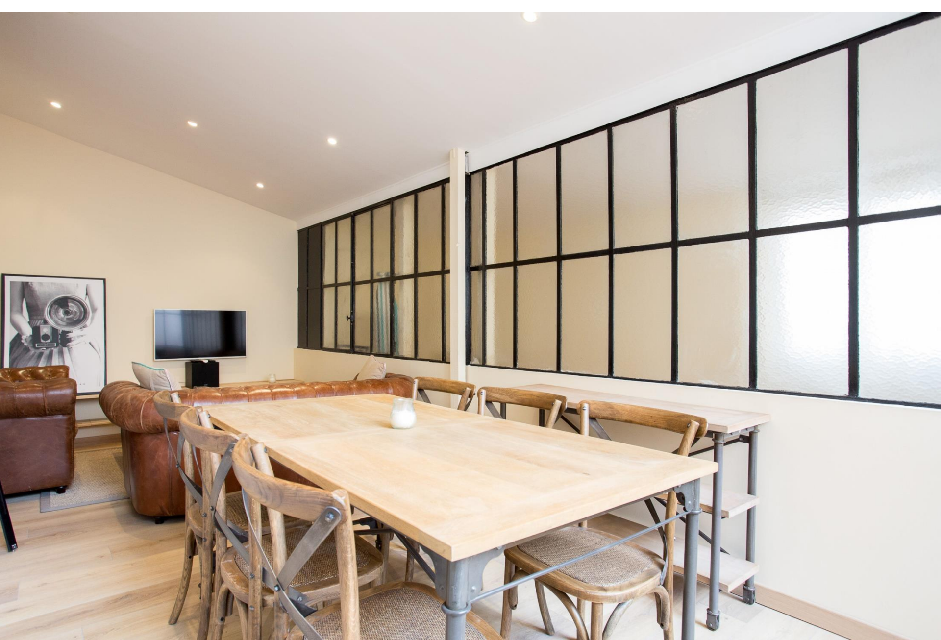
The living room