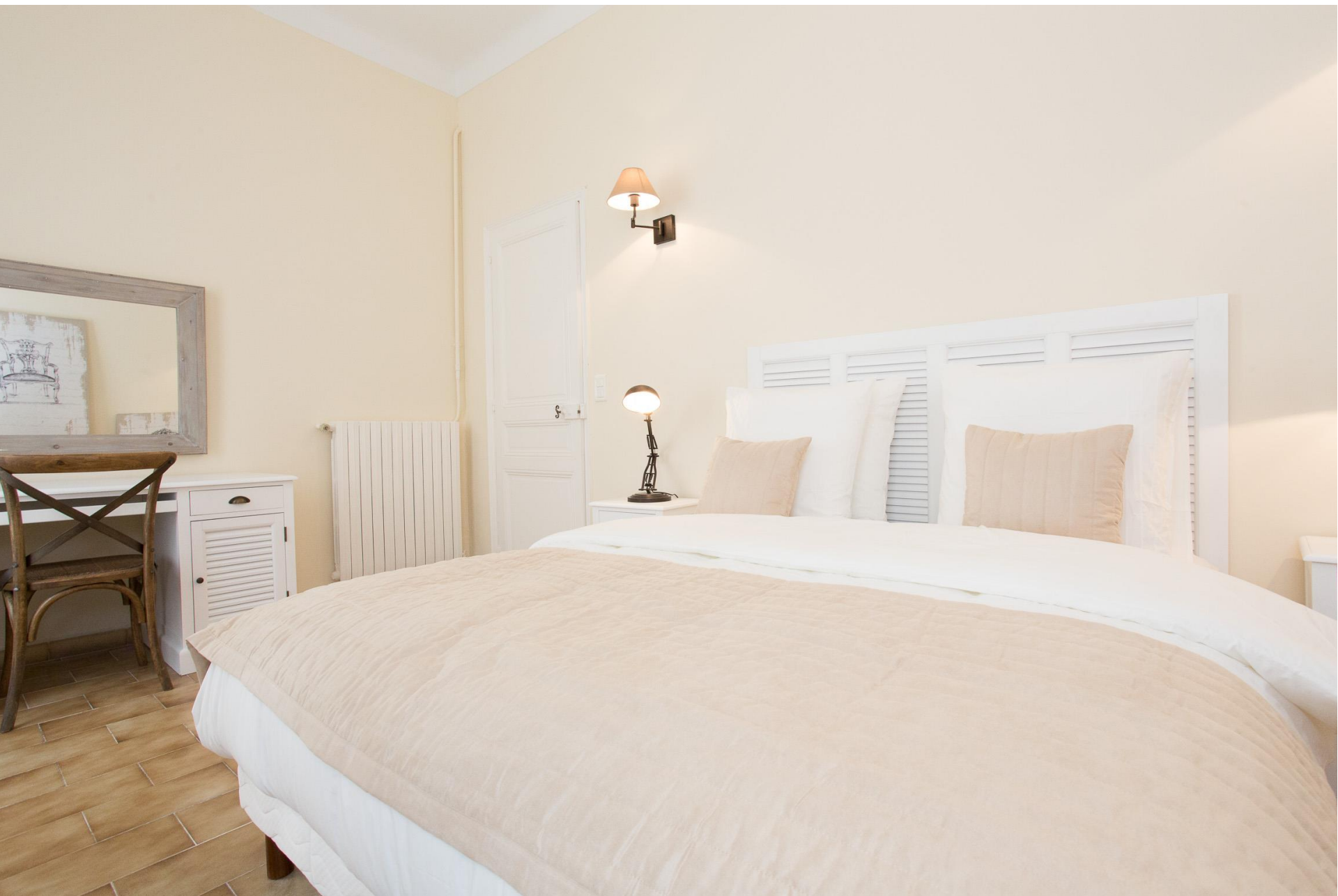
Another view of the 1st bedroom with an office area