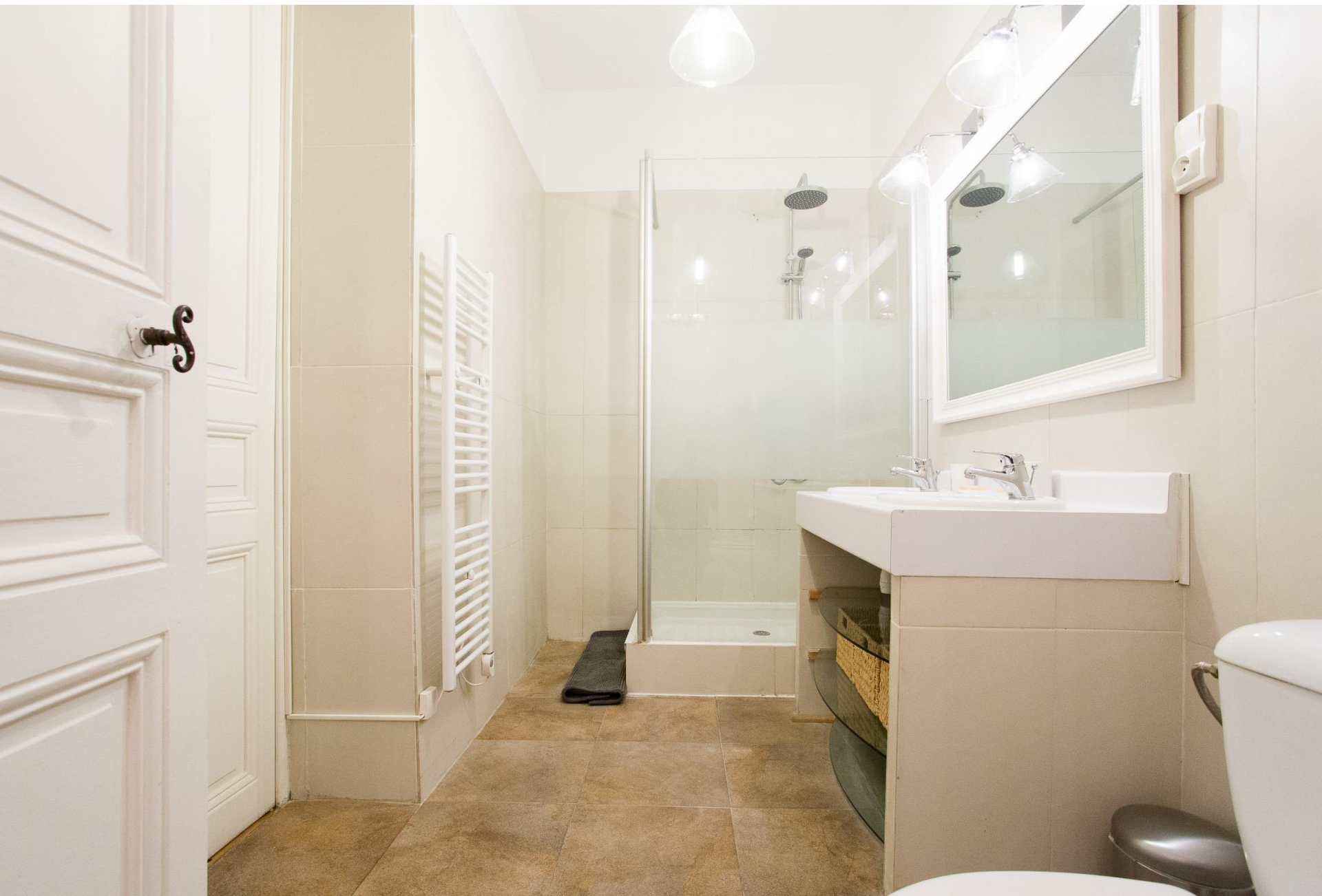
The main shower room with toilets & 2 sinks