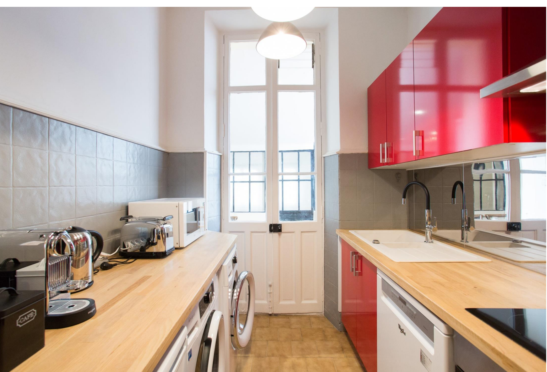
Another view of the kitchen that opens onto the living room & dining area