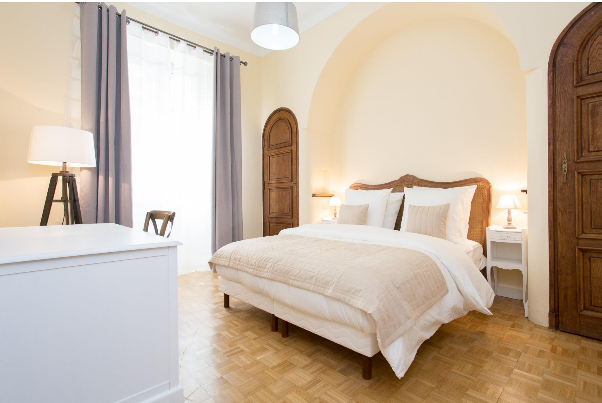
The 2 nd bedroom with 2 single beds that can be made as double & cupboards