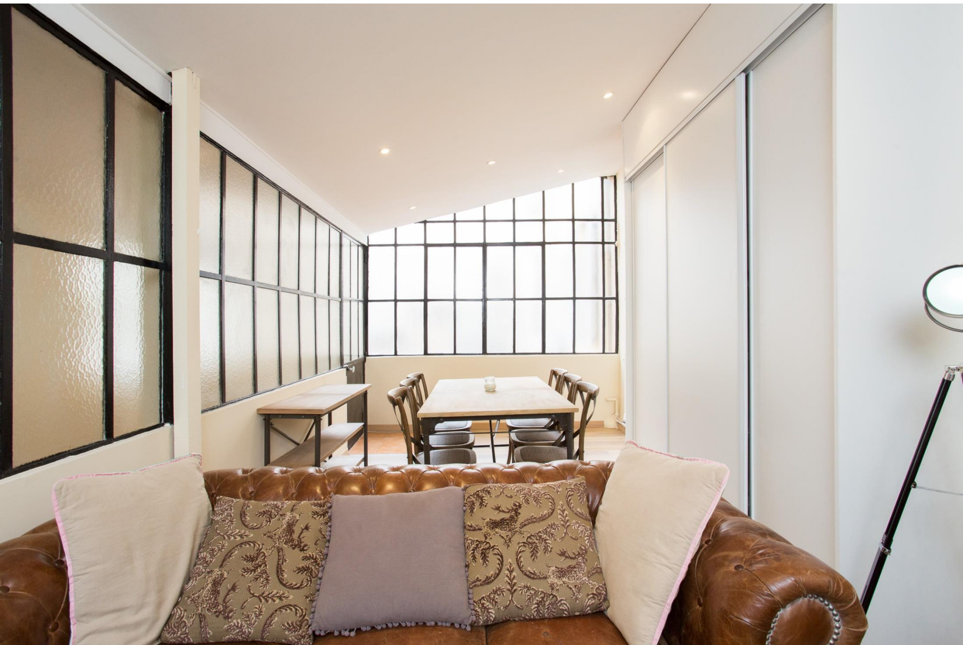
Another view of the living room & dining area