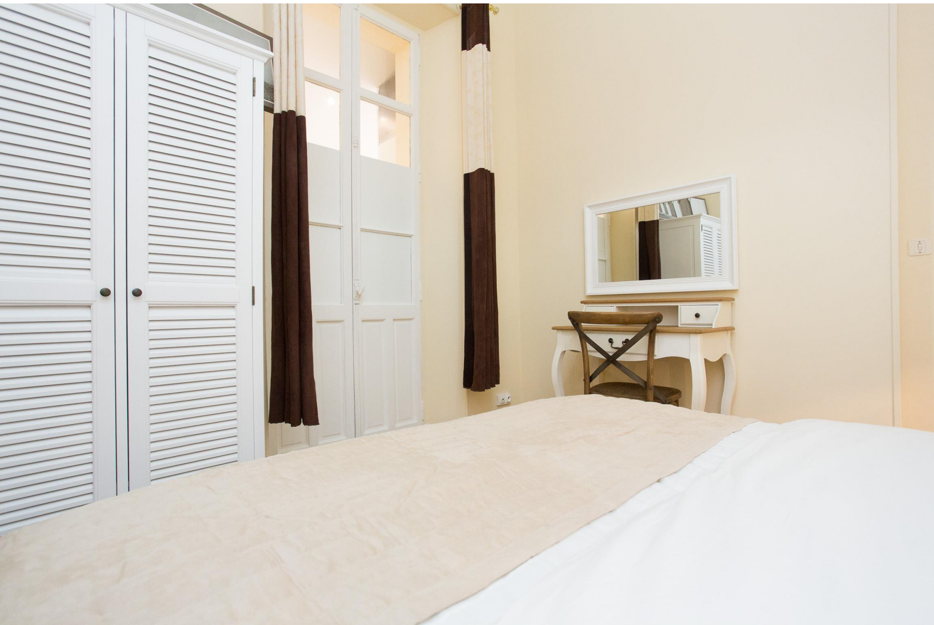
Another view of the 3rd bedroom with office area