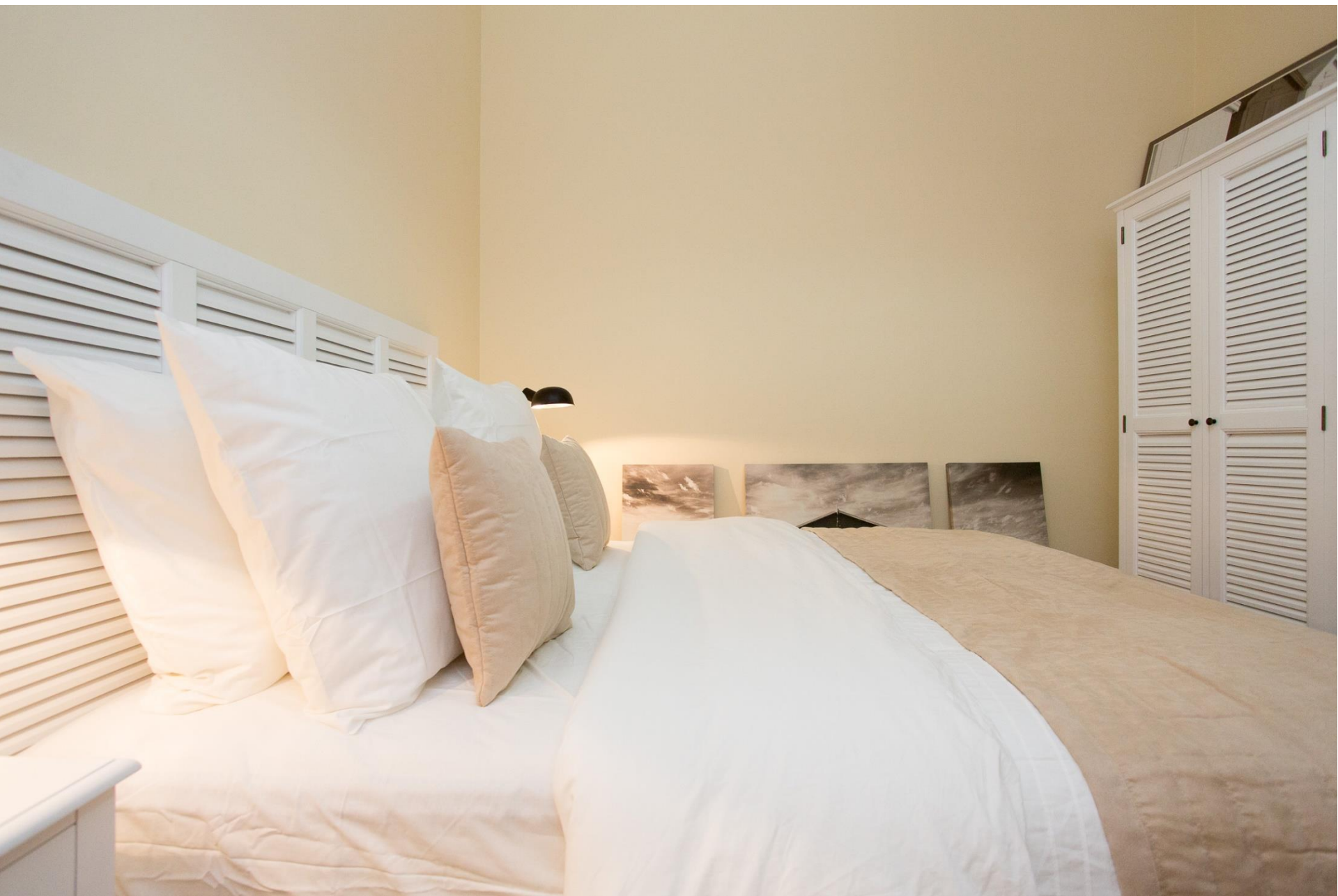
The 3rd bedroom with 2 single beds that can be made as a double bed & cupboards