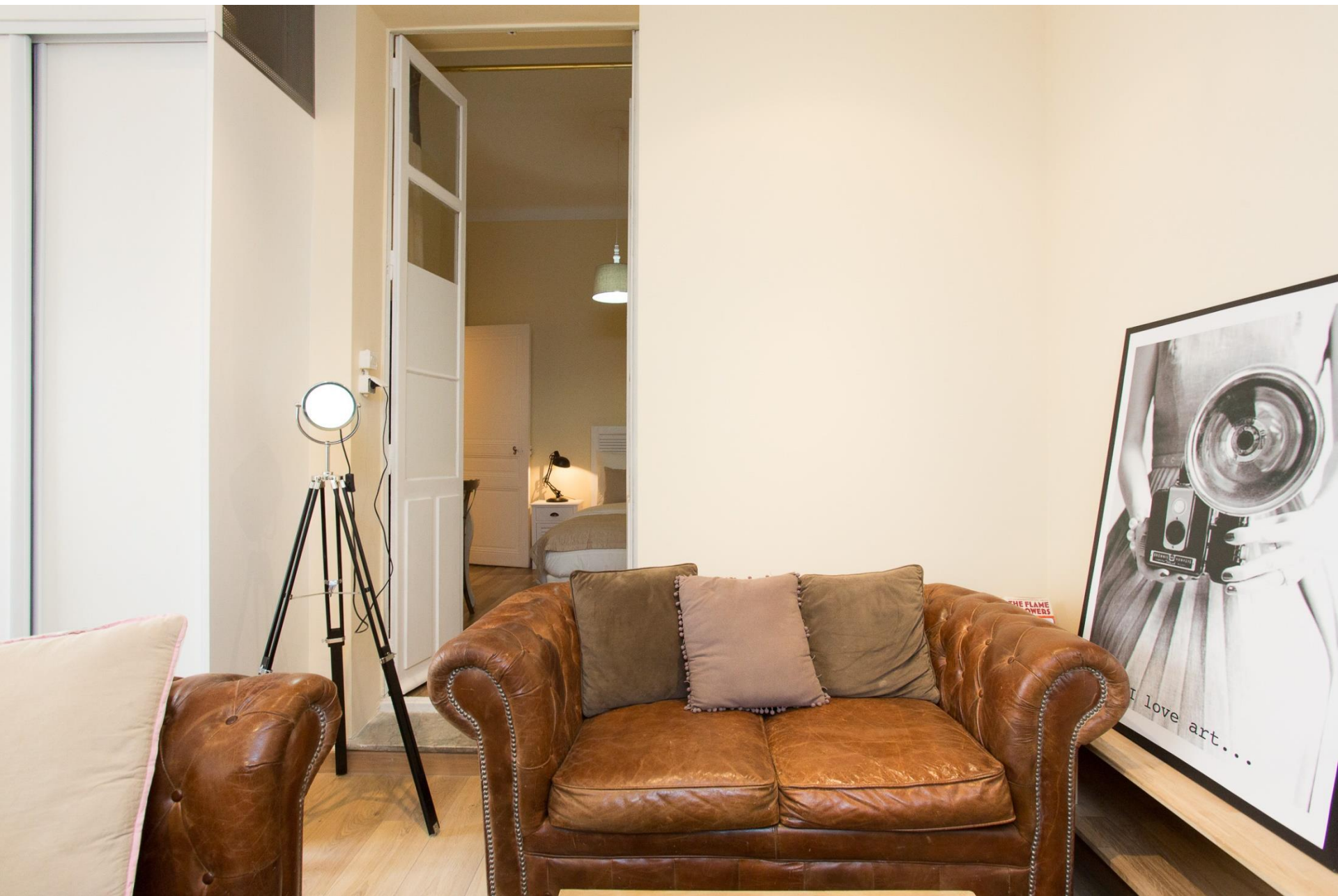
Another view of the living room