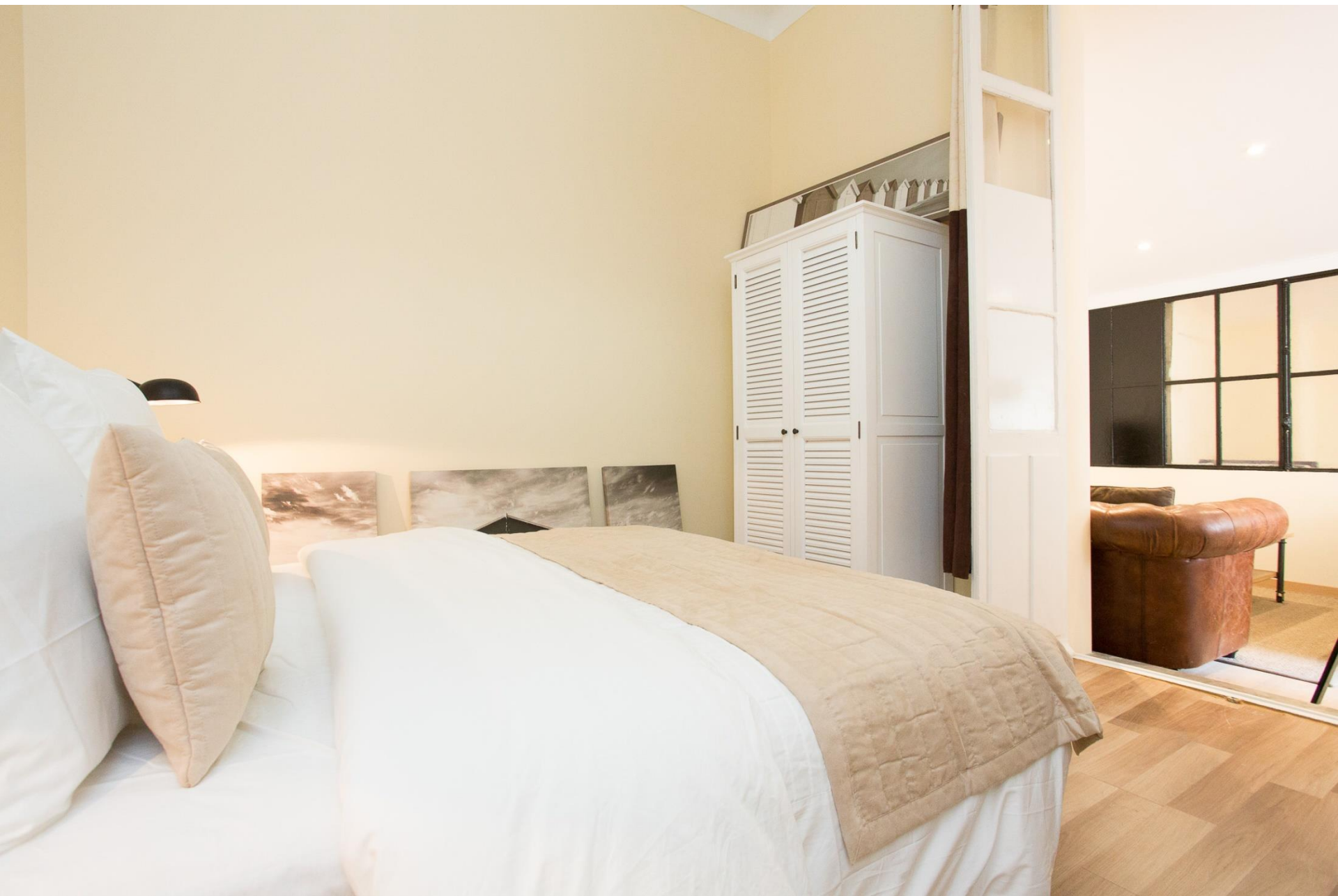
The 3rd bedroom can communicate with the living room