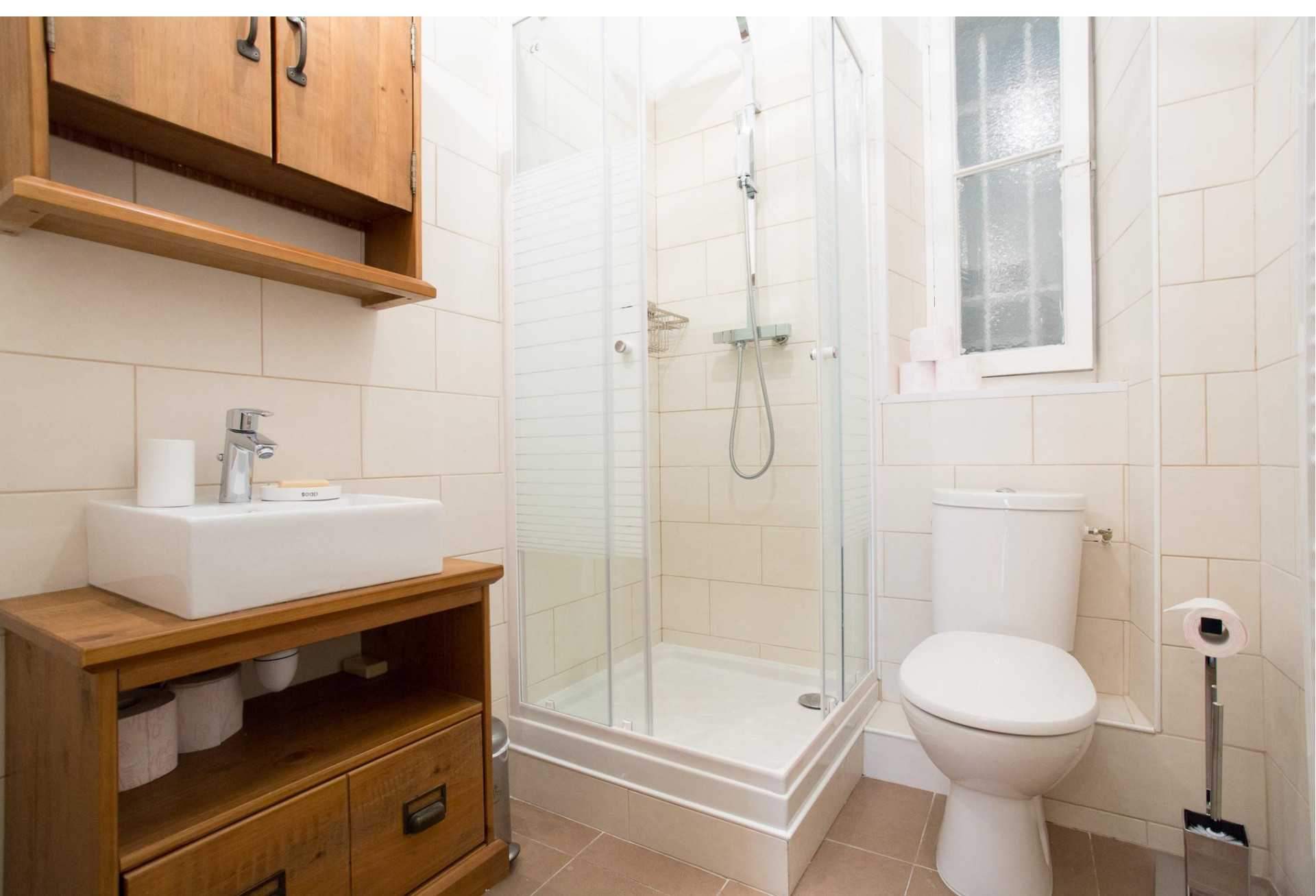
Another view of the 2 nd shower room