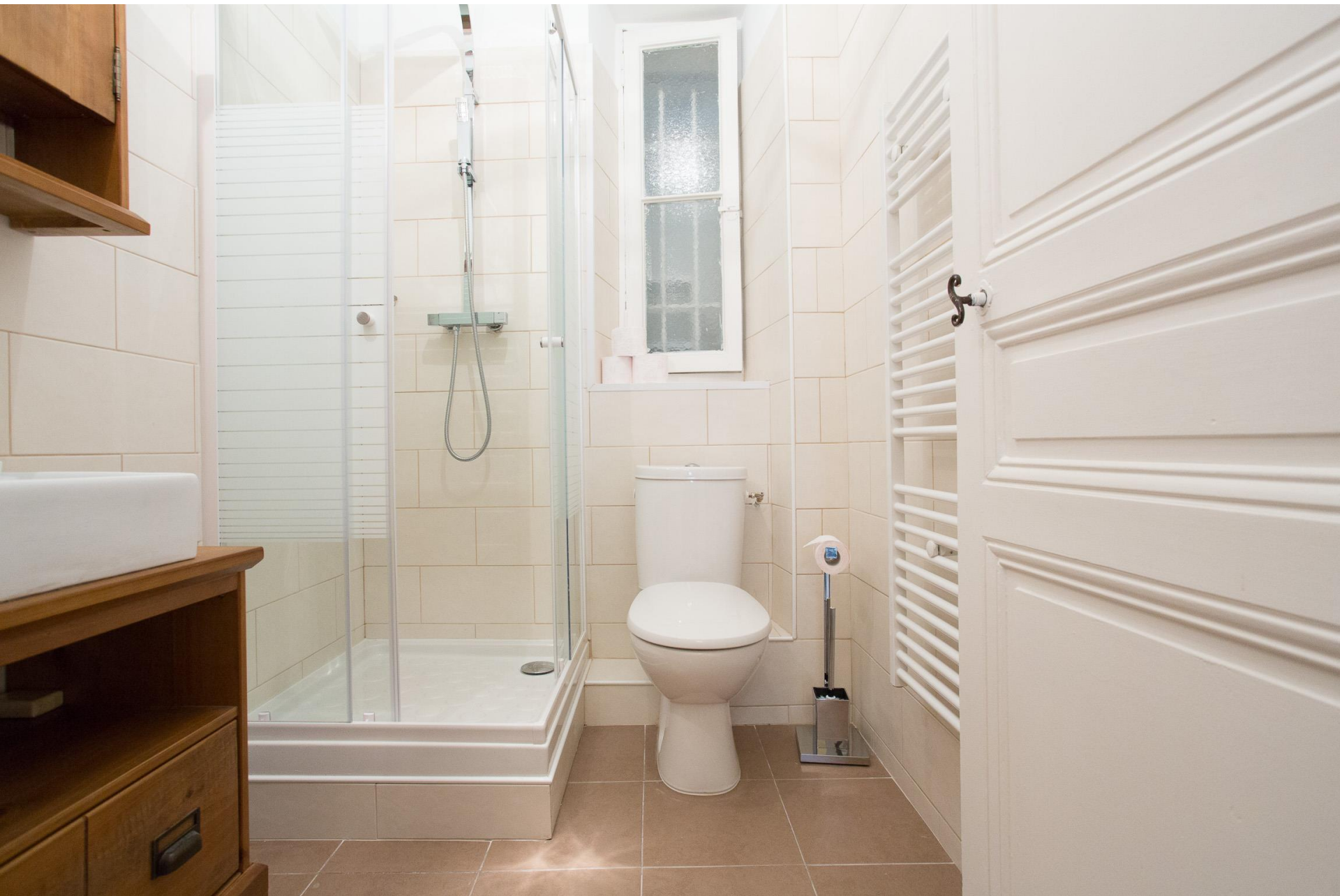
The 2 nd shower room with toilets