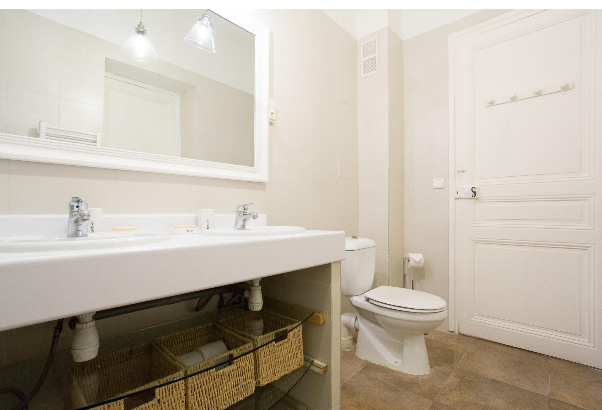
Another view of the bathroom