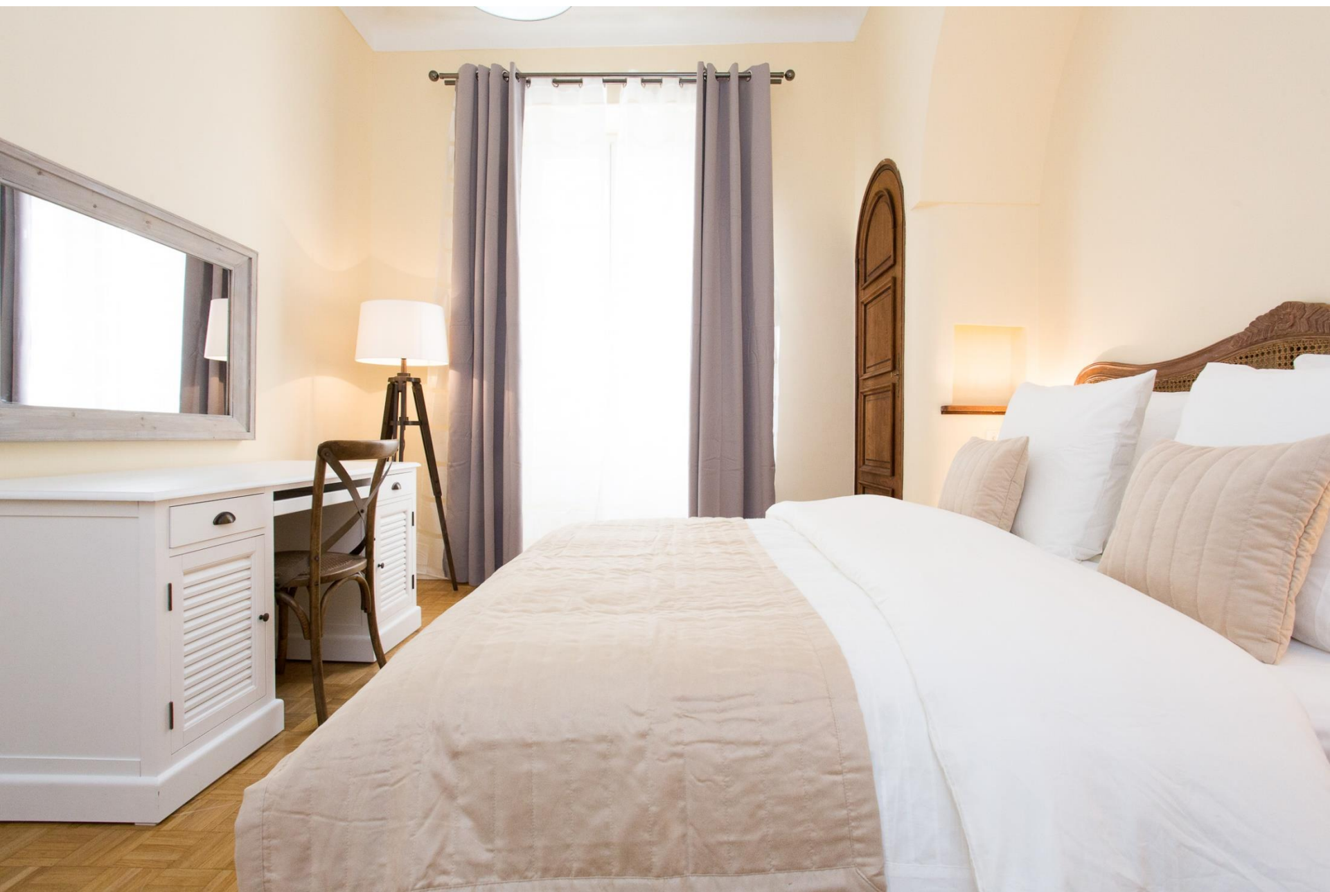
Another view of the 2 Nd bedroom with office area