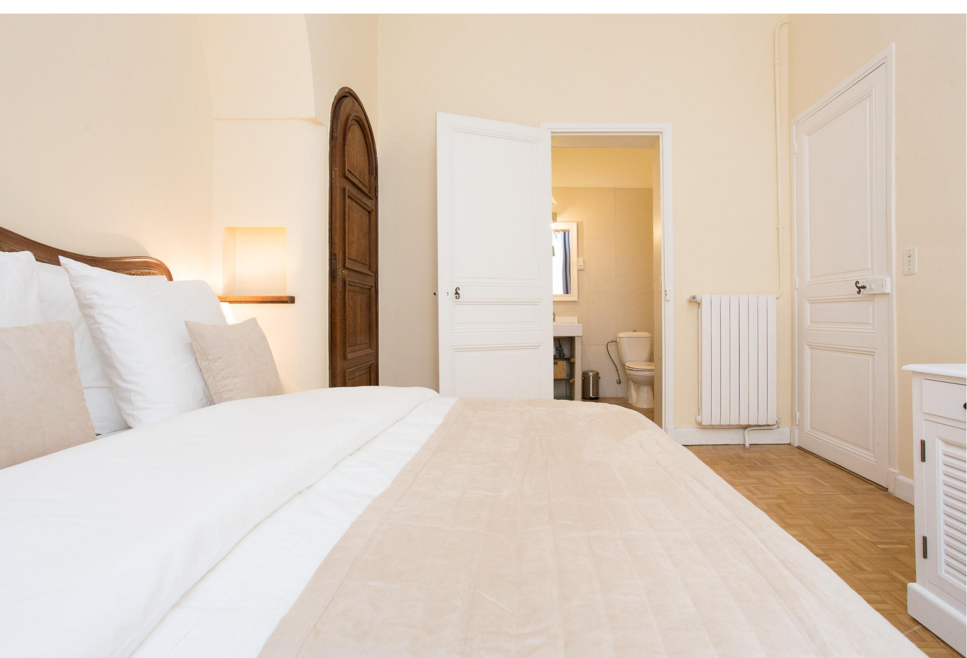
The bedroom communicates with the shower room