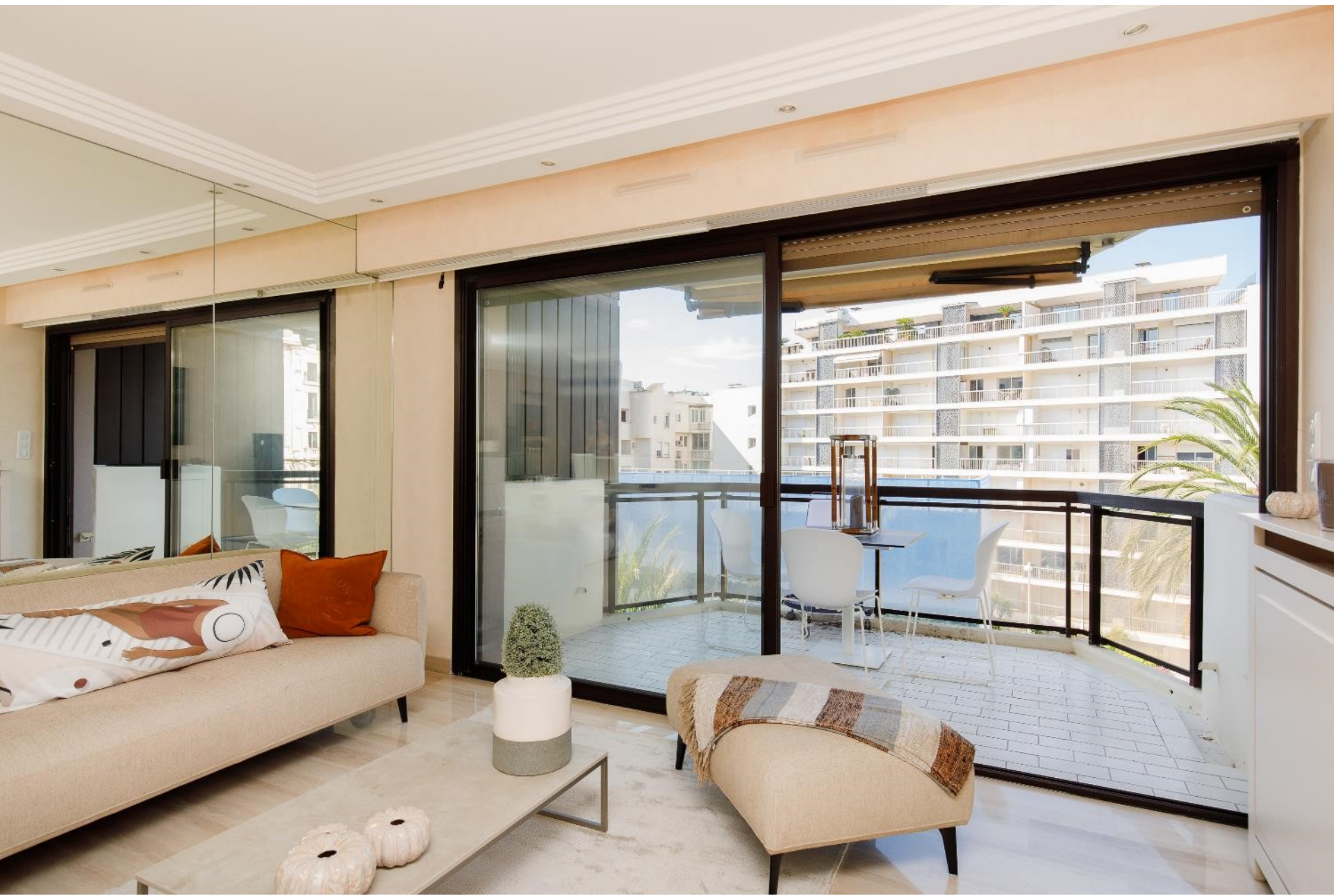
2 nd ensuite bedroom with TV and dressing area