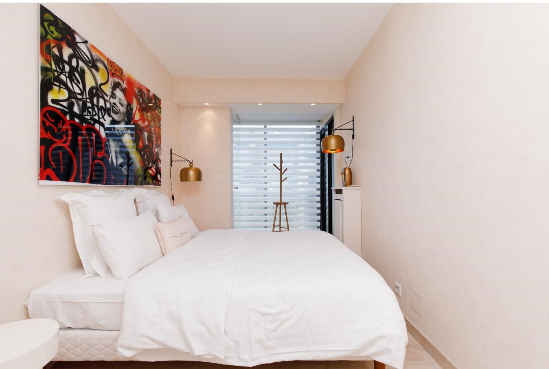
The 2 nd bedroom with twin beds that can be made as a double bed like on the photo