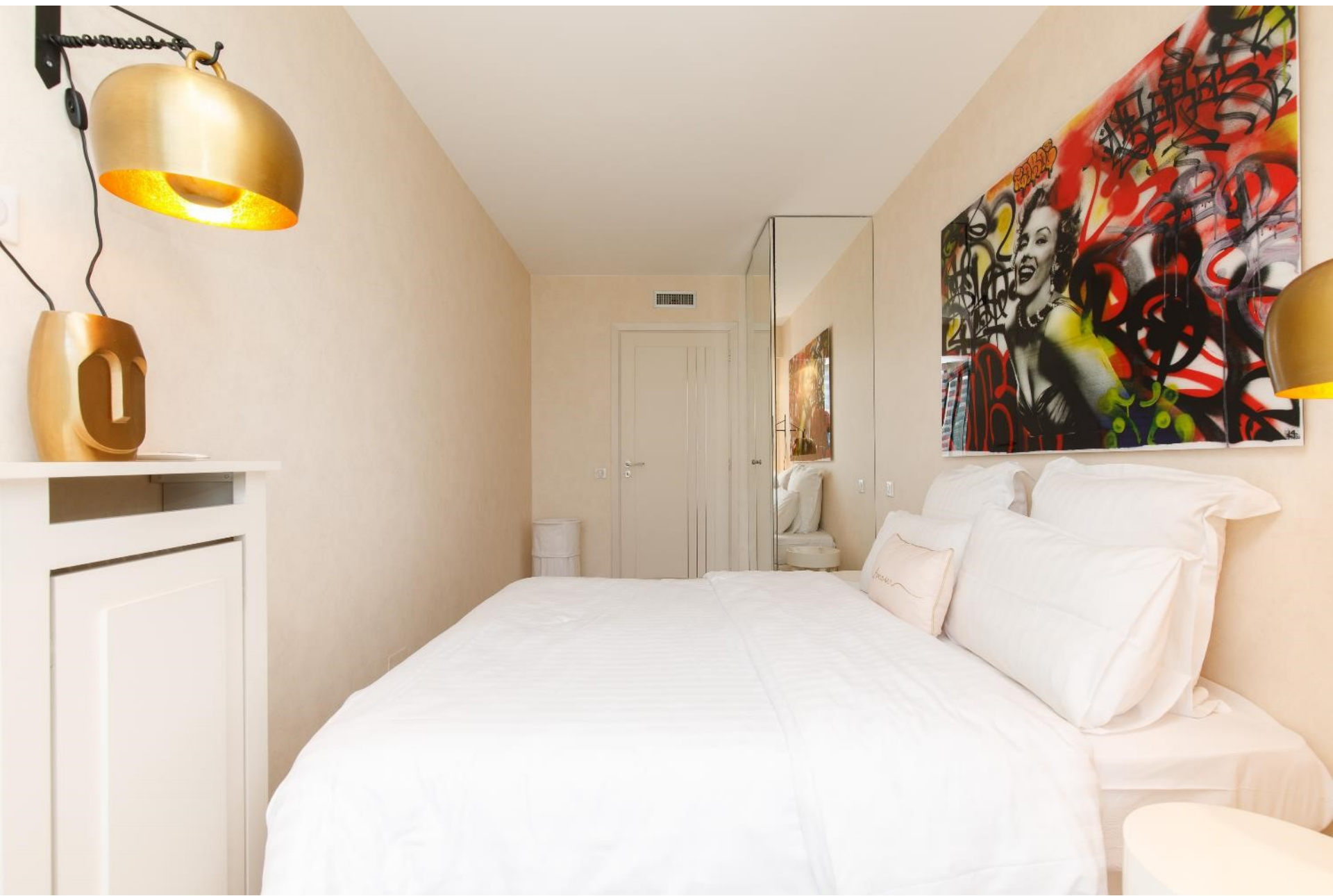
Another view of the bedroom with cupboards