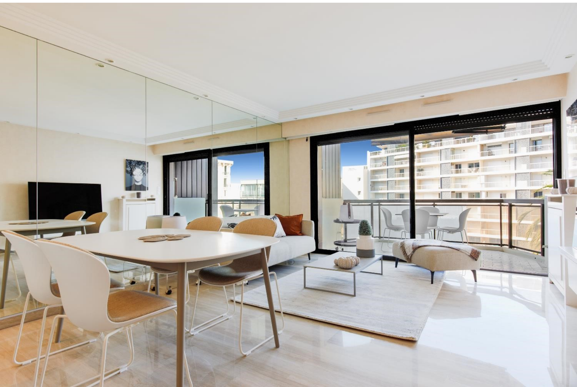
Living room opening onto the terrace