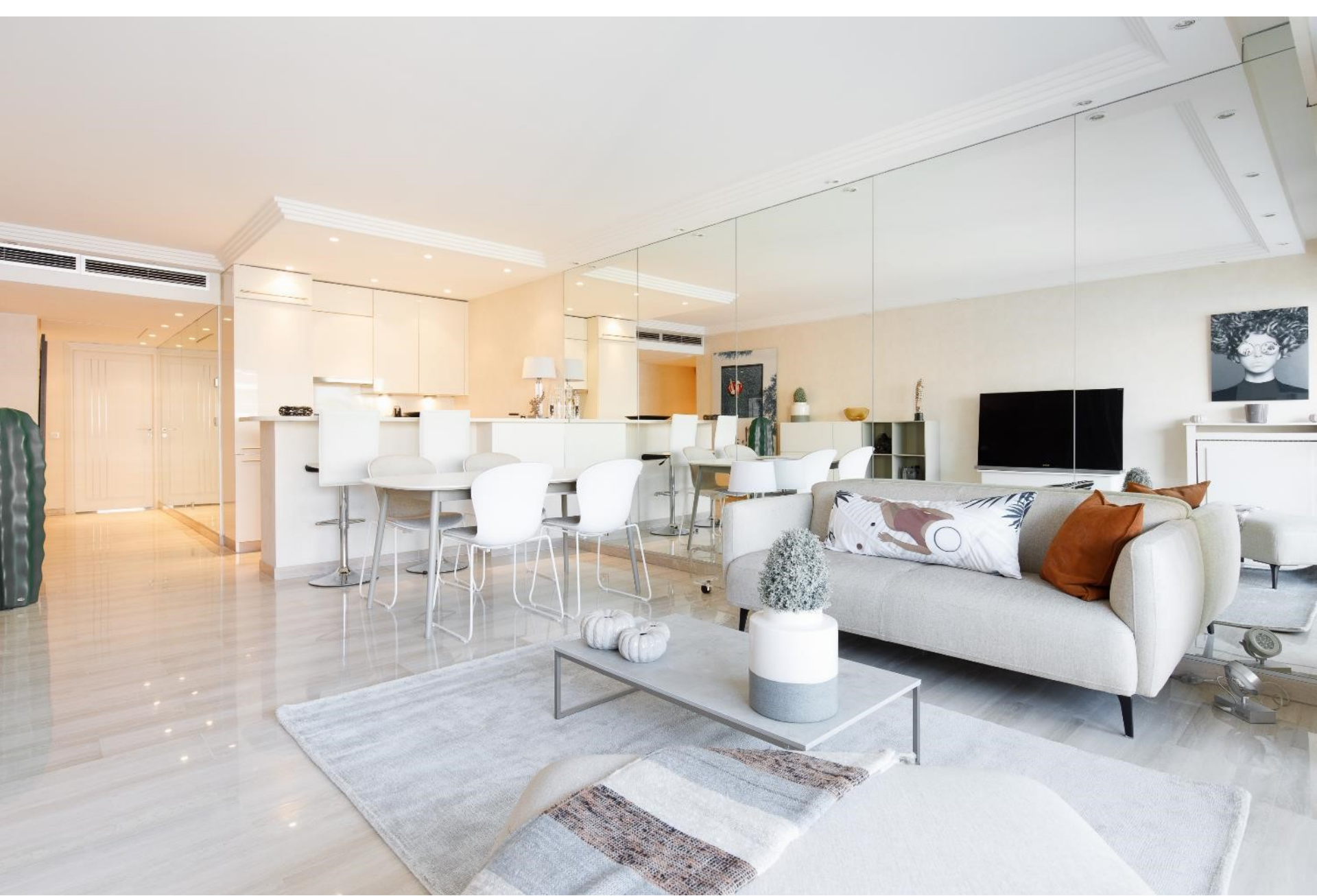
Another view of the living room