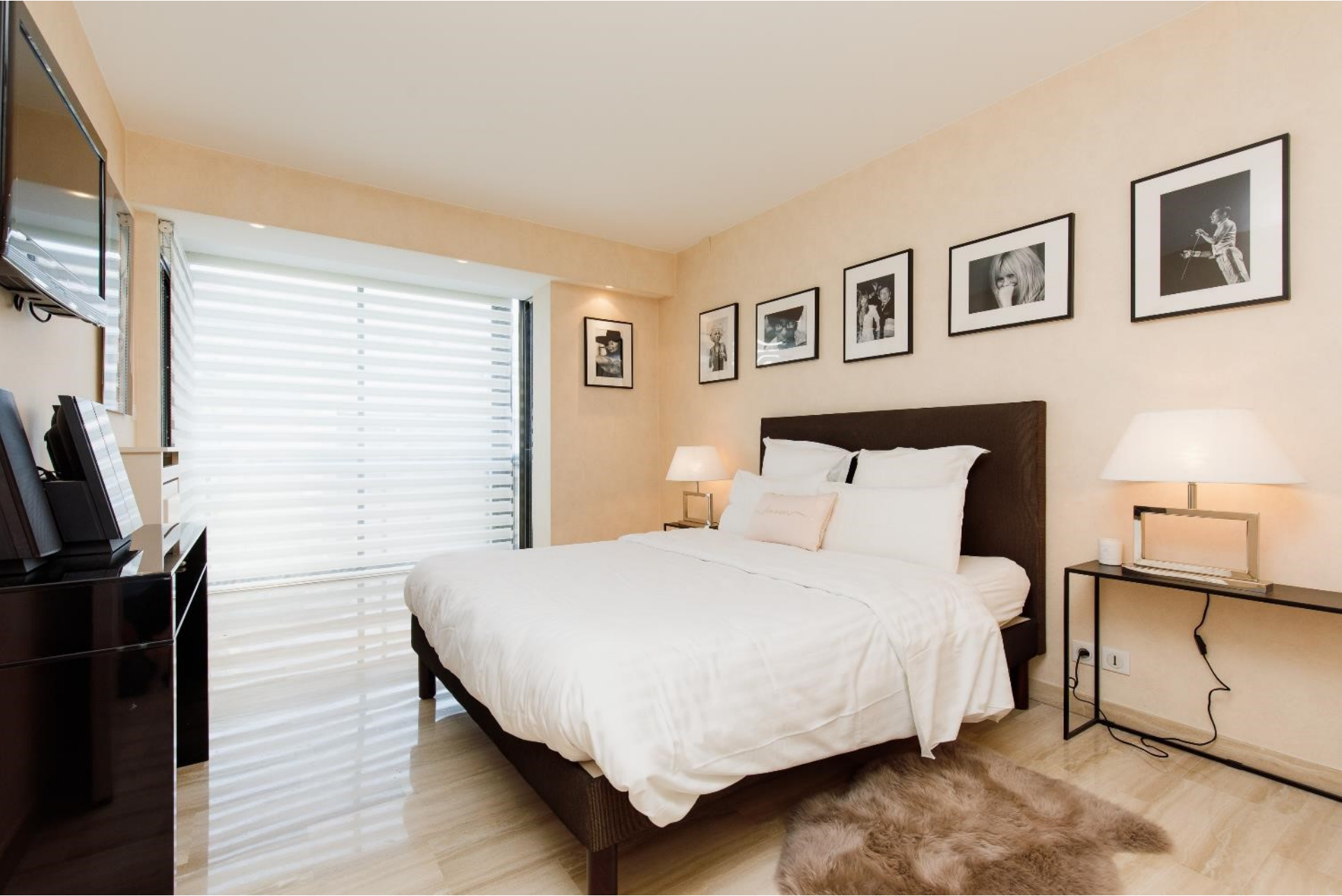
Another view of the master bedroom