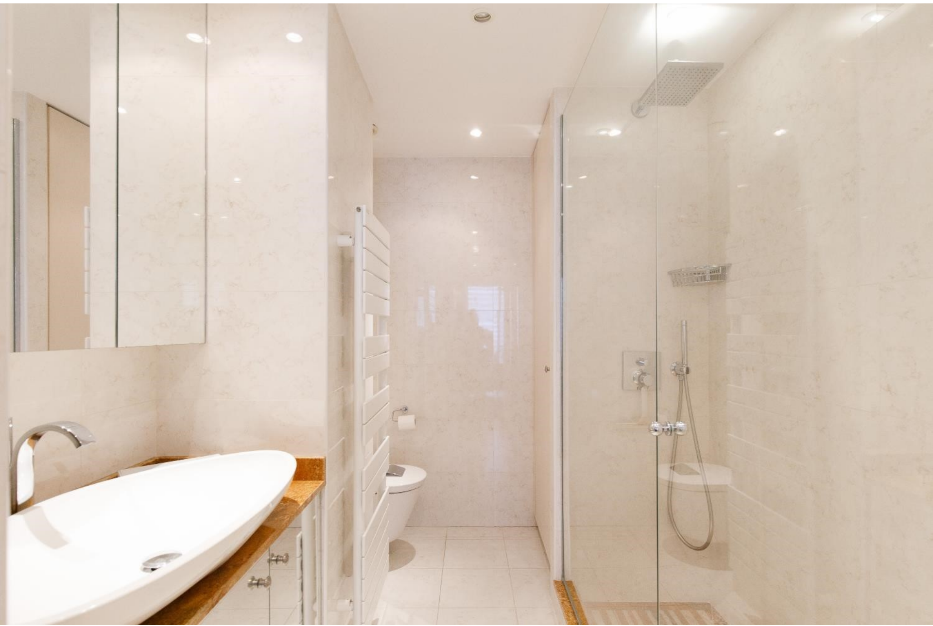
Shower room with toilets belonging to the master bedroom