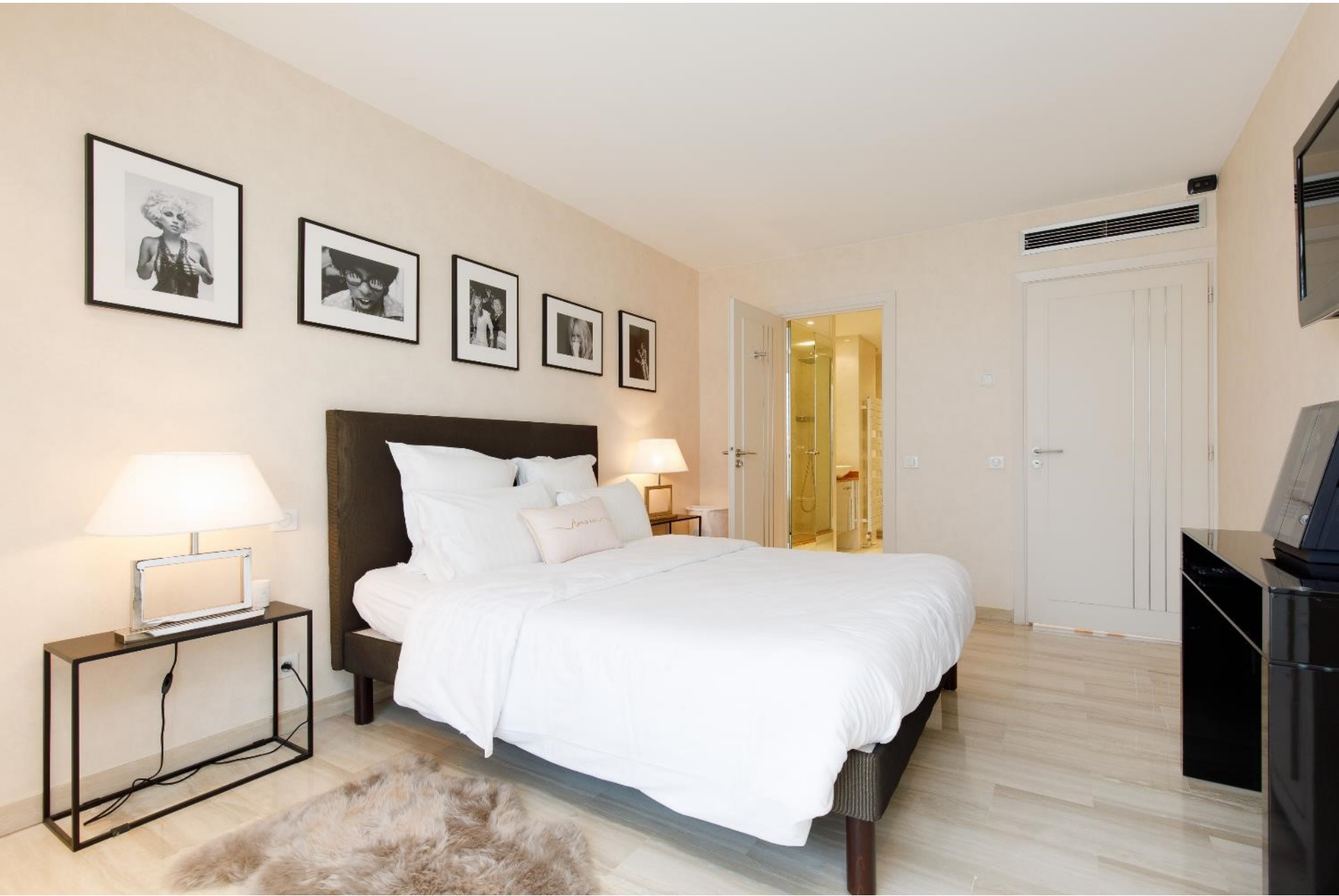
The ensuite master bedroom with double bed & TV