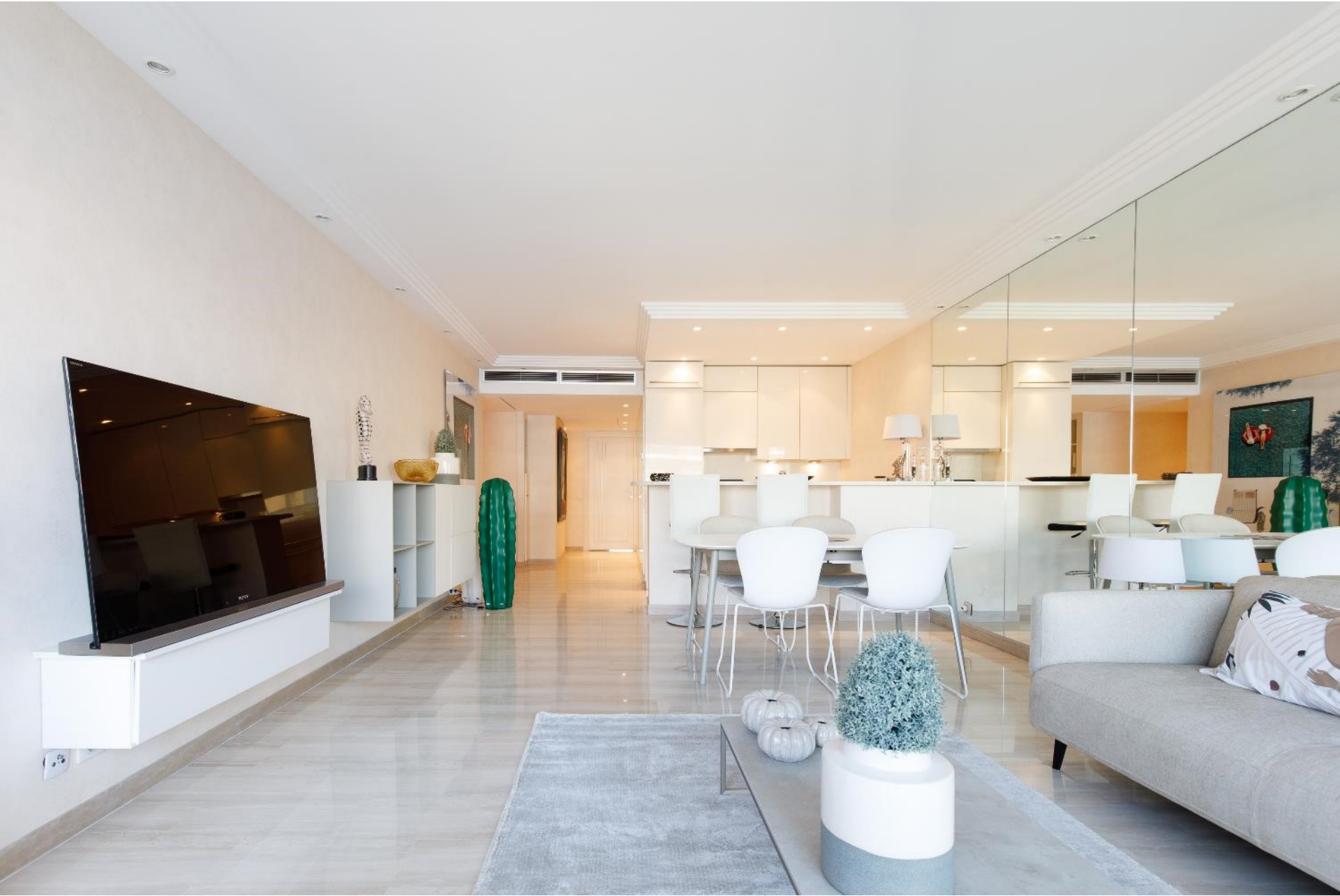
The living room with dining area