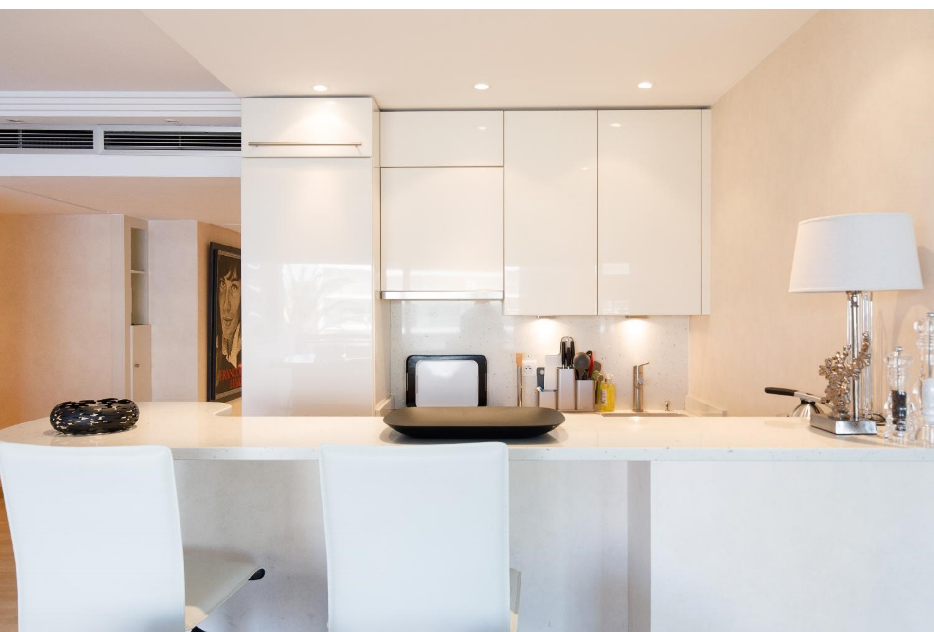
Kitchen with bar area