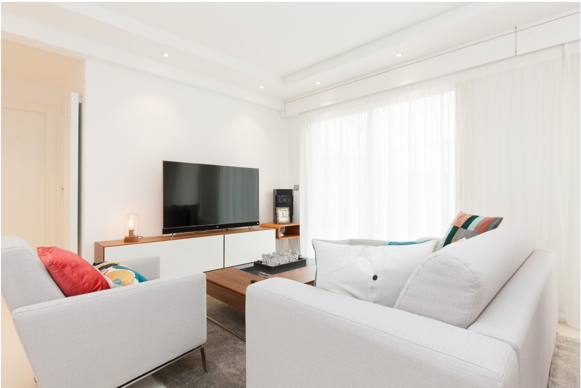
Living room with sofa bed