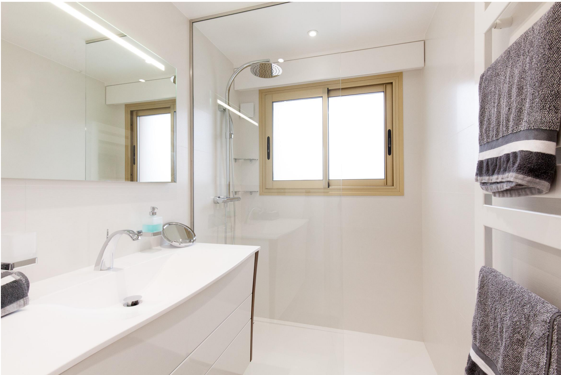
The shower room