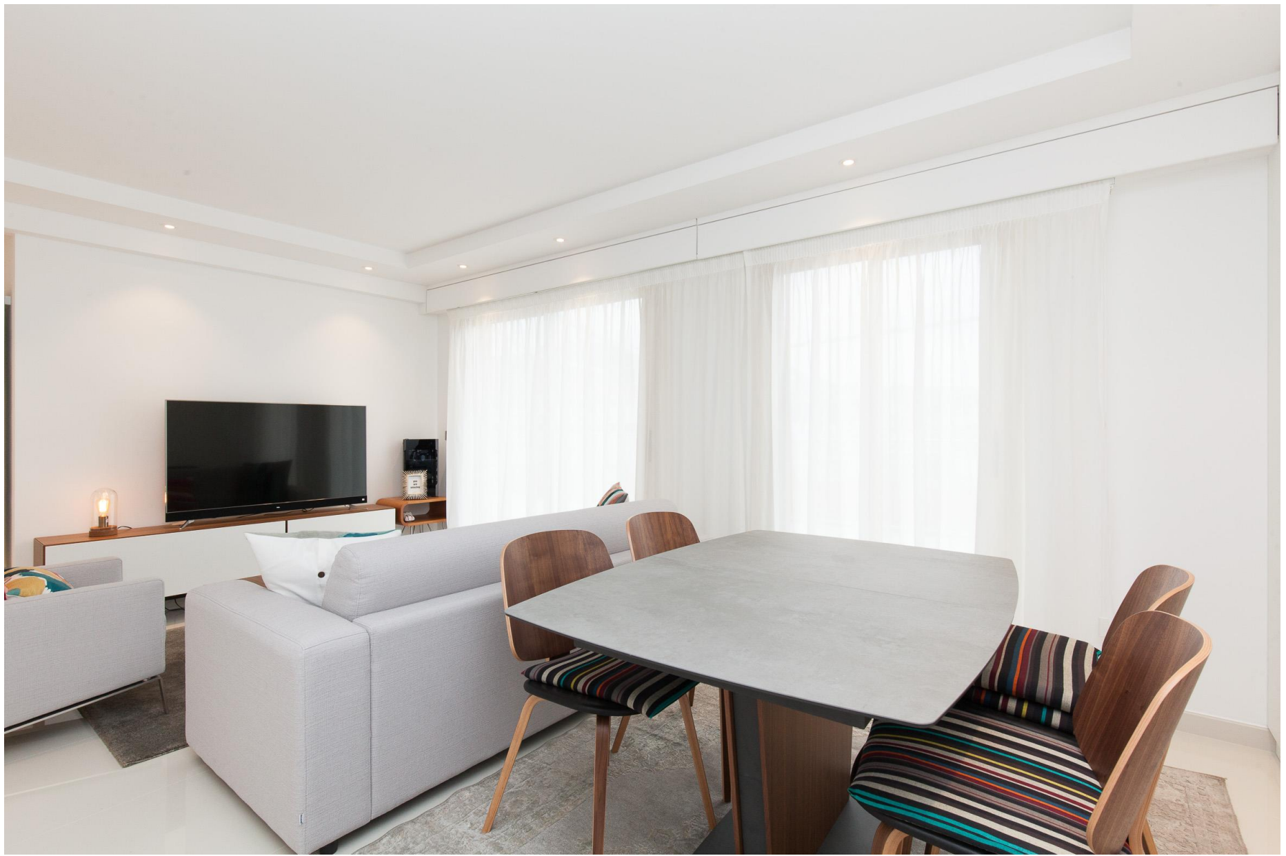
Living room with dining area