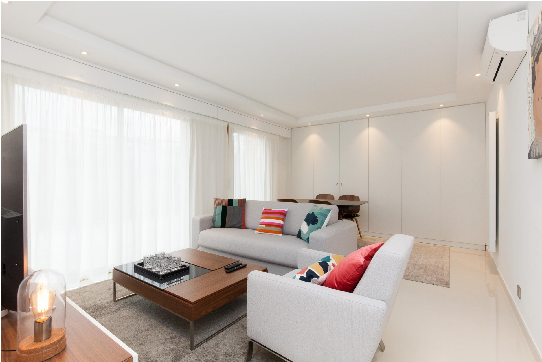
Overview of living room, cupboards and A/C