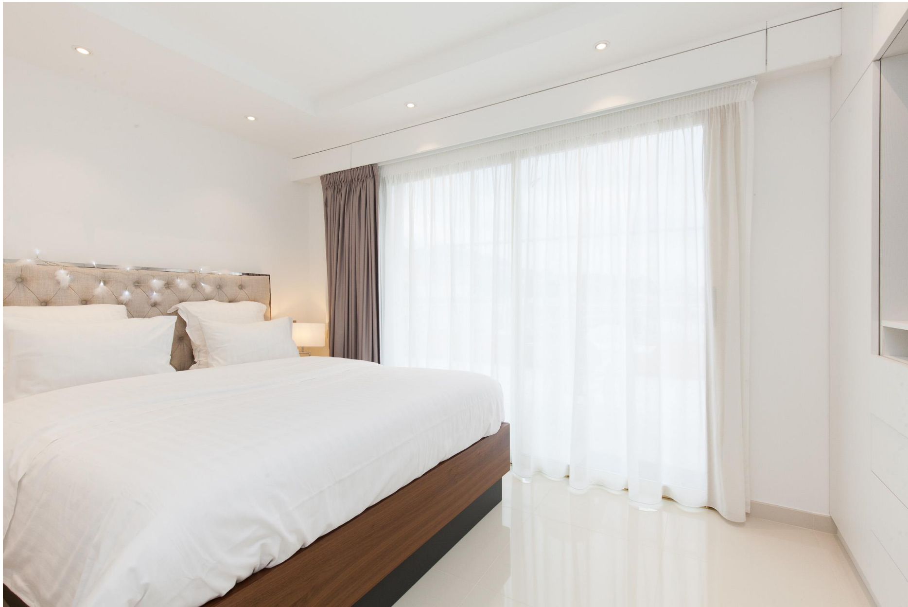
Bedroom with double bed, access to the terrace