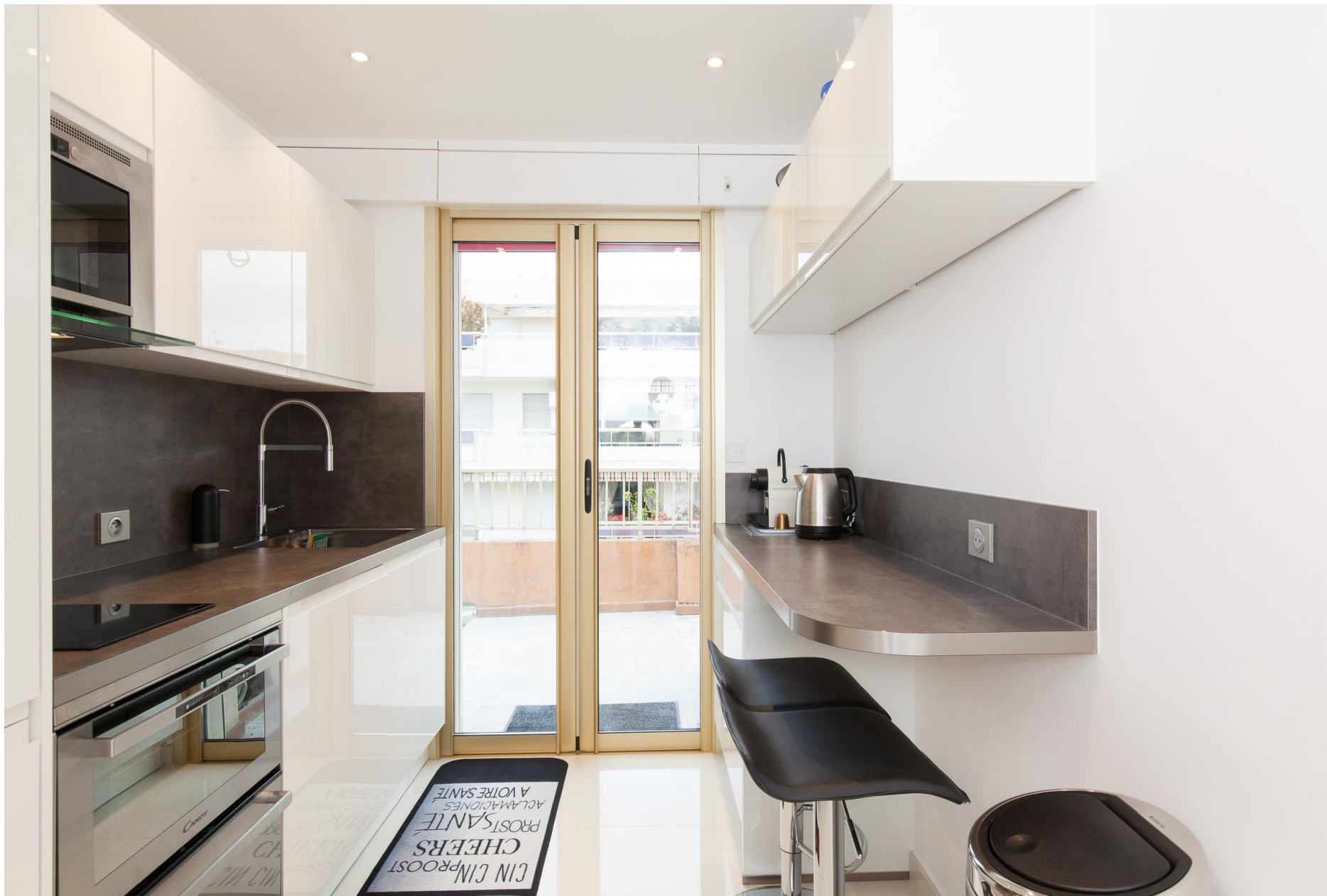
Separate fitted kitchen