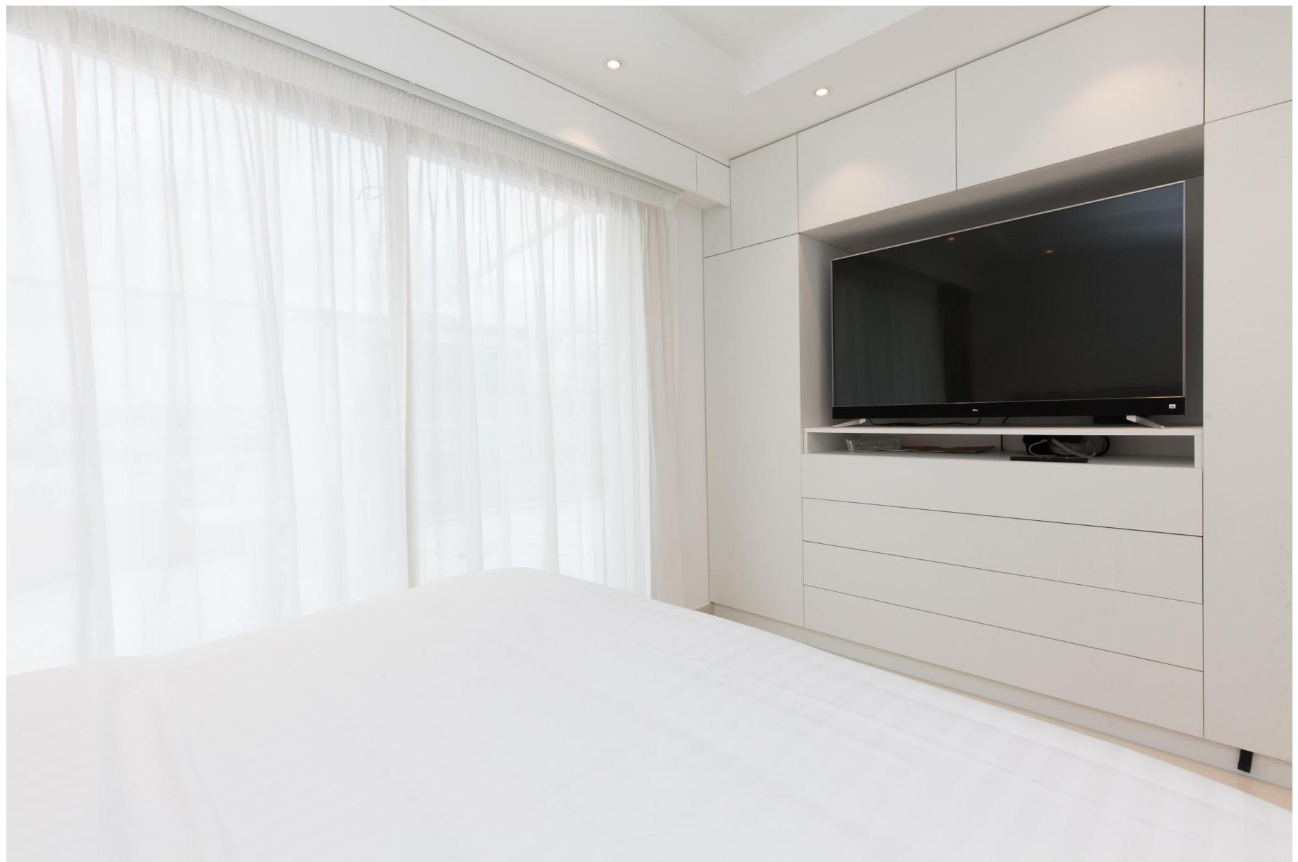
The bedroom with TV and cupboards