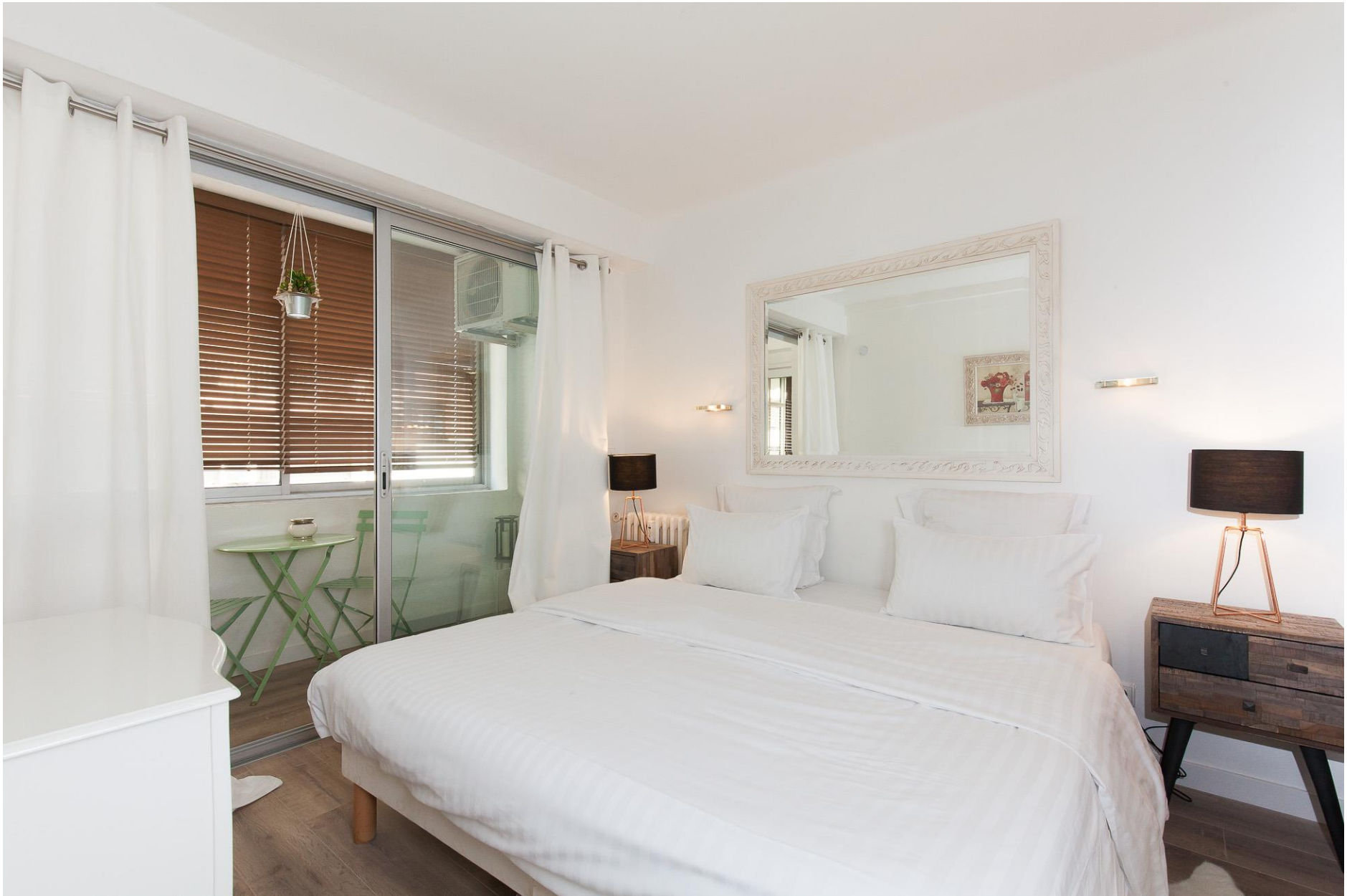
The bedroom with 2 single beds, access to veranda