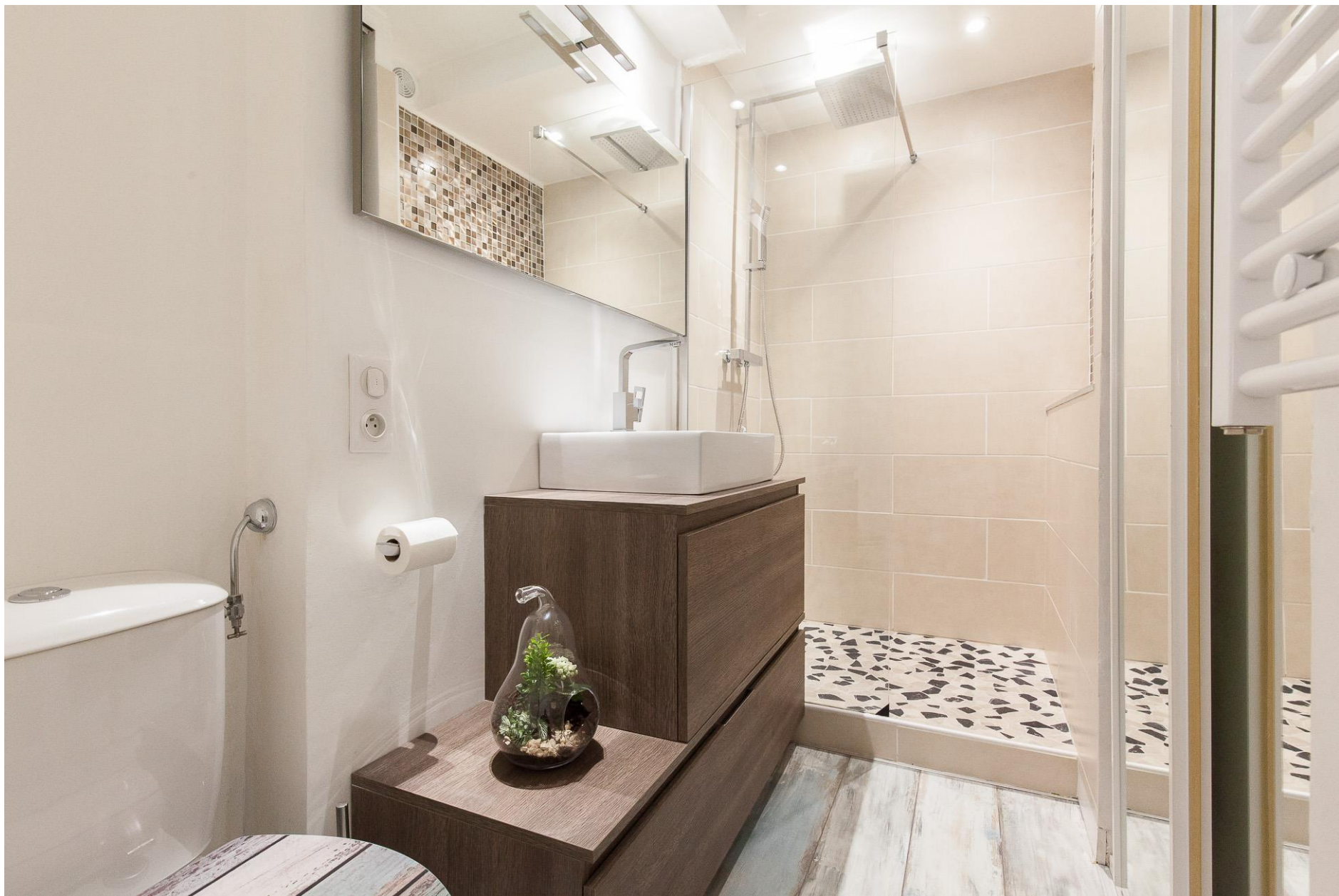
The shower room & toilets in the bedroom