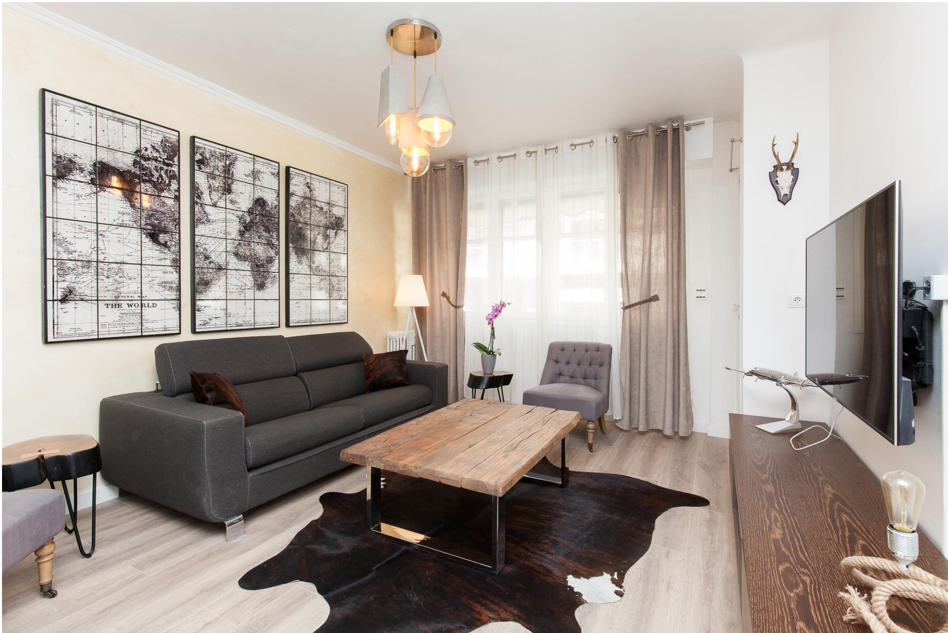
Living room with sofa bed, TV