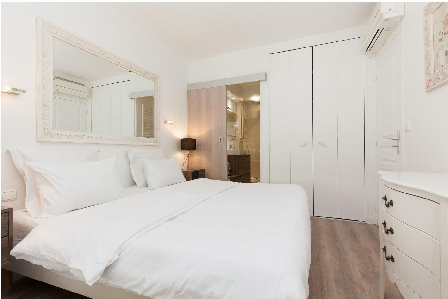
The ensuite bedroom, A/C and cupboards