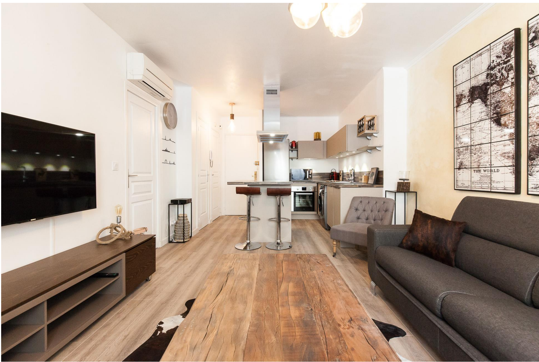
Living room, US kitchen & bar