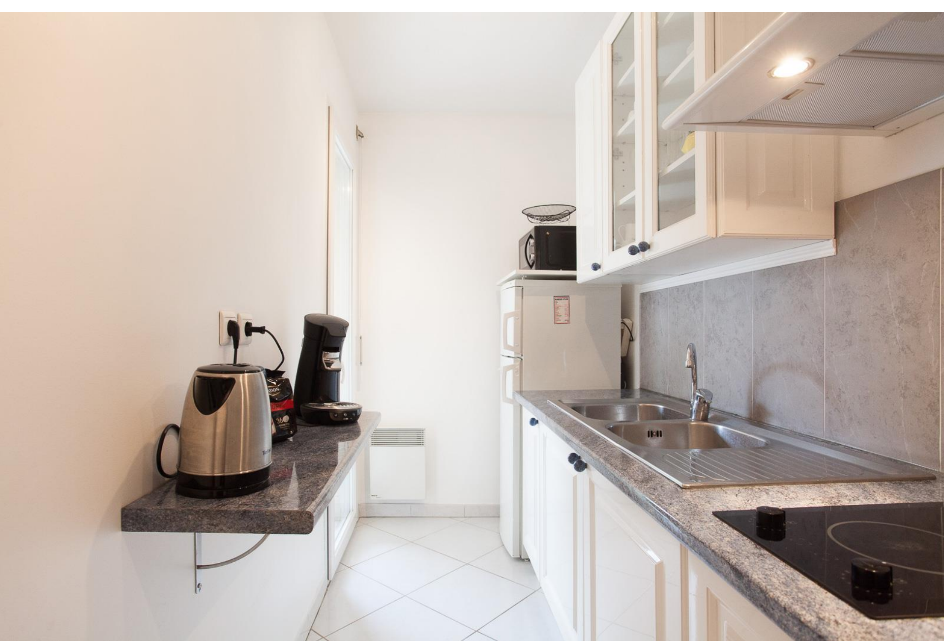
The kitchen opening onto the terrace