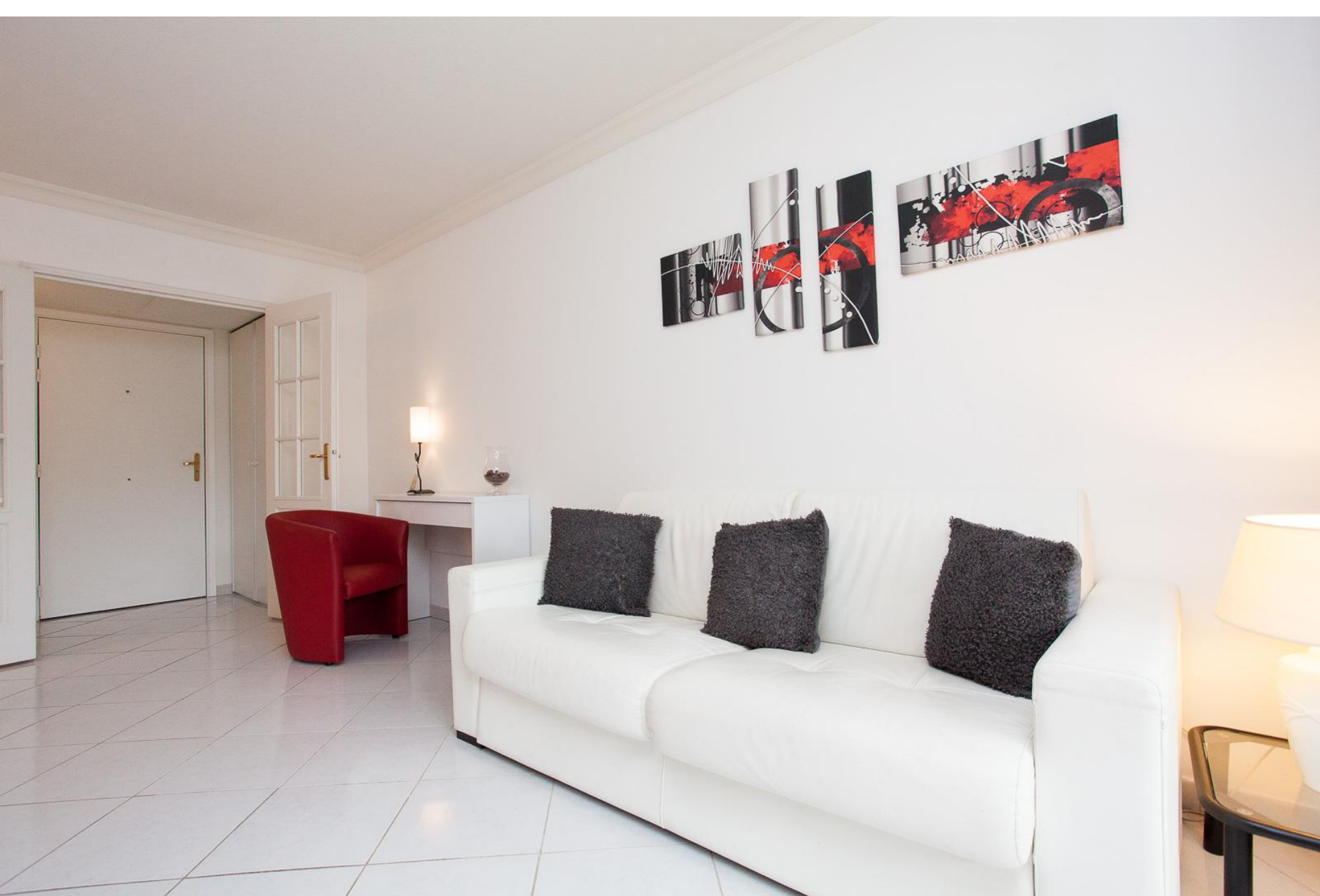
Another view of the living room