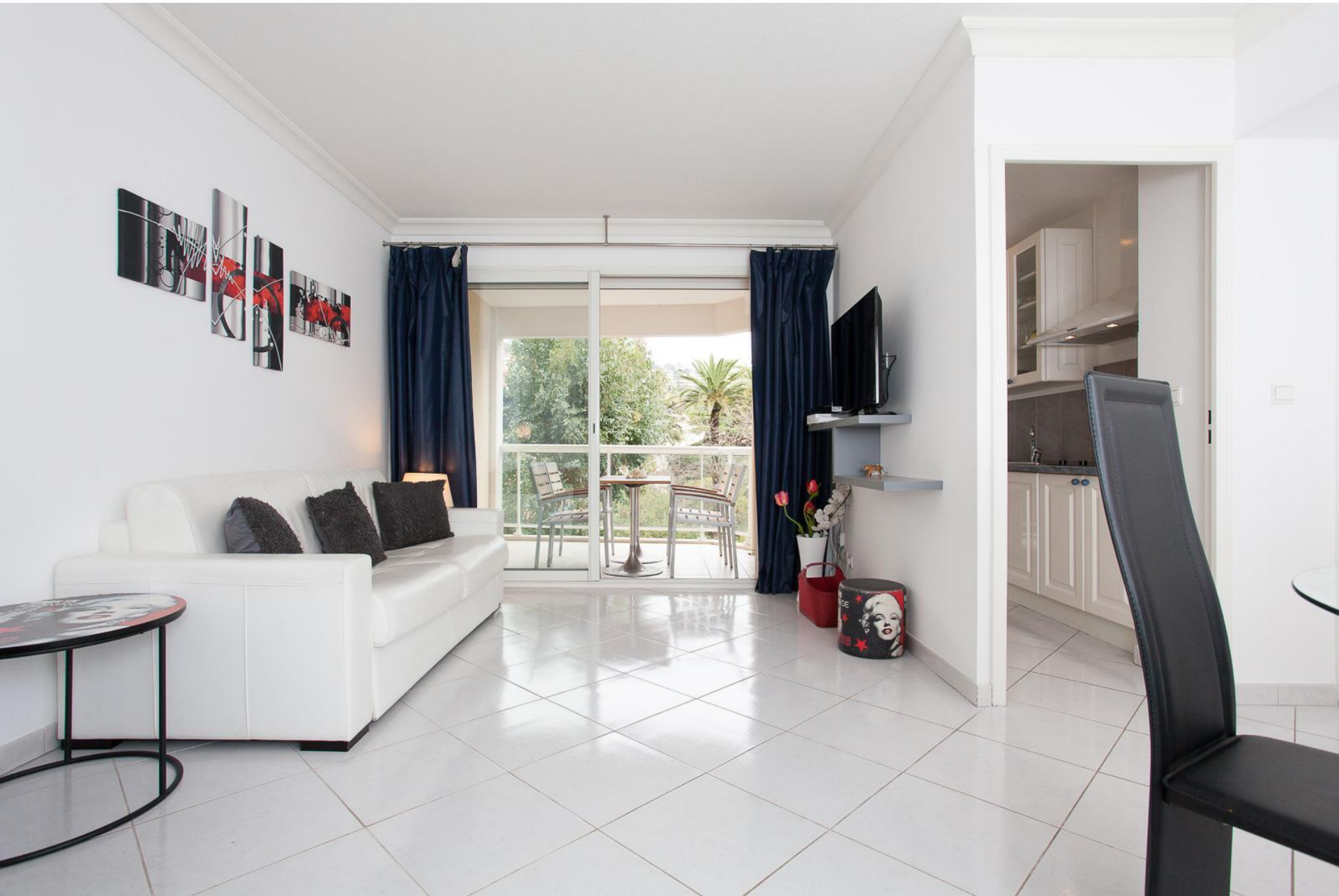
Another view of the living room opening onto the terrace