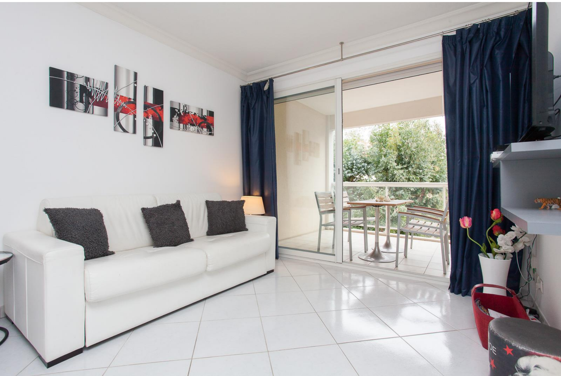
The living room