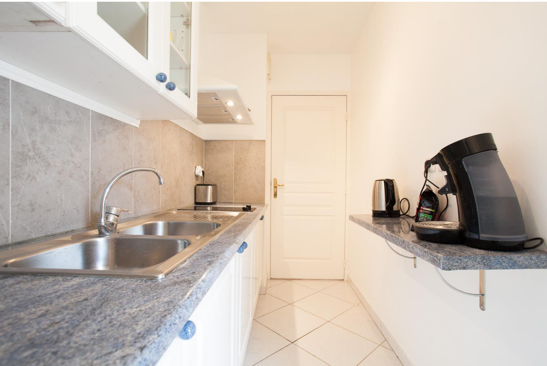
Another view of the kitchen