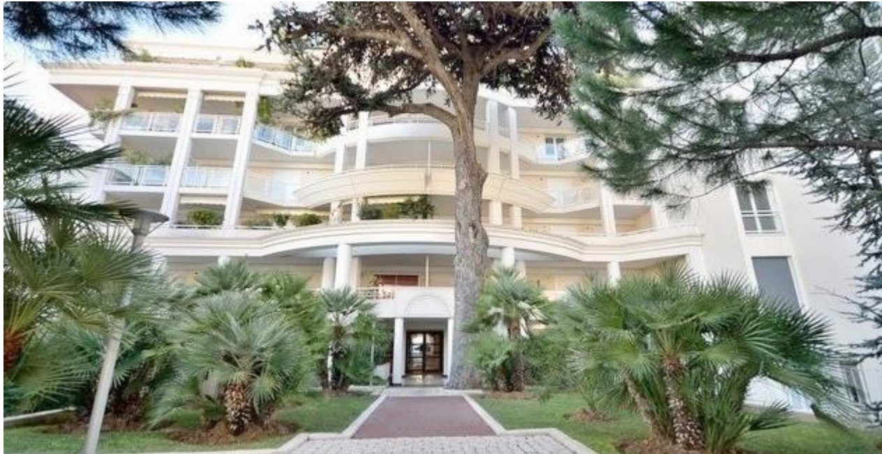
The Residence !