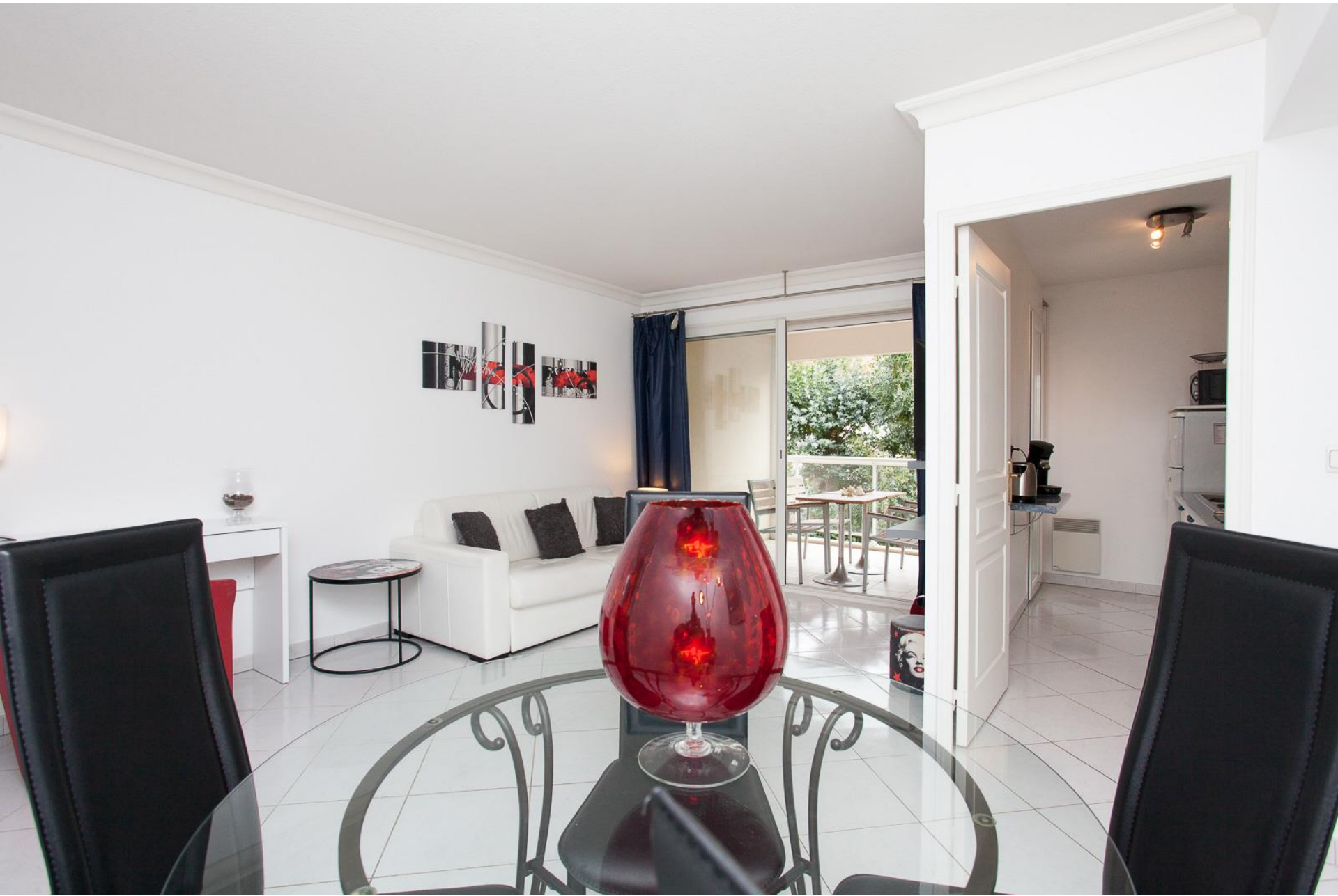
View from the dining area