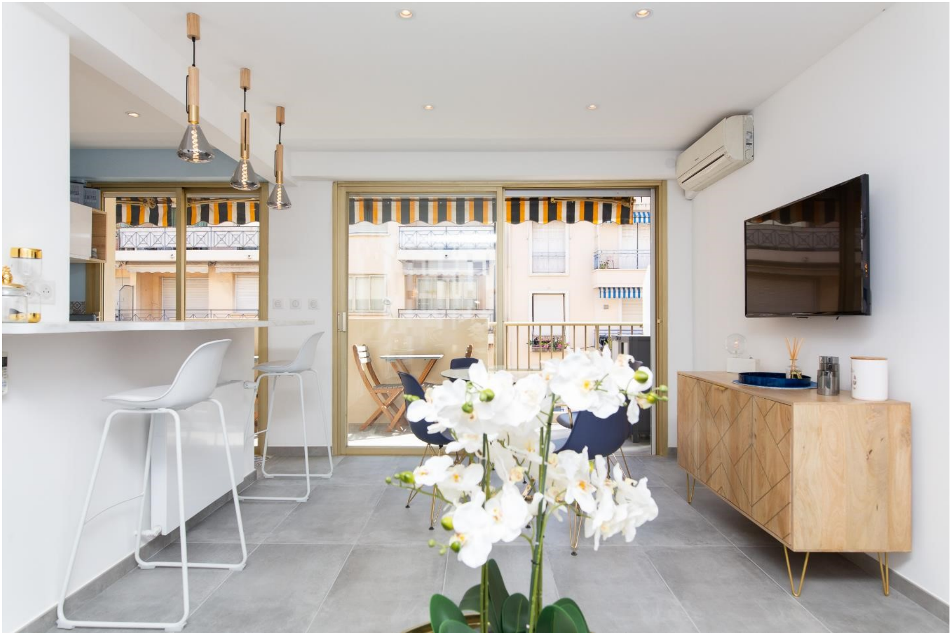
View from the sofa couch