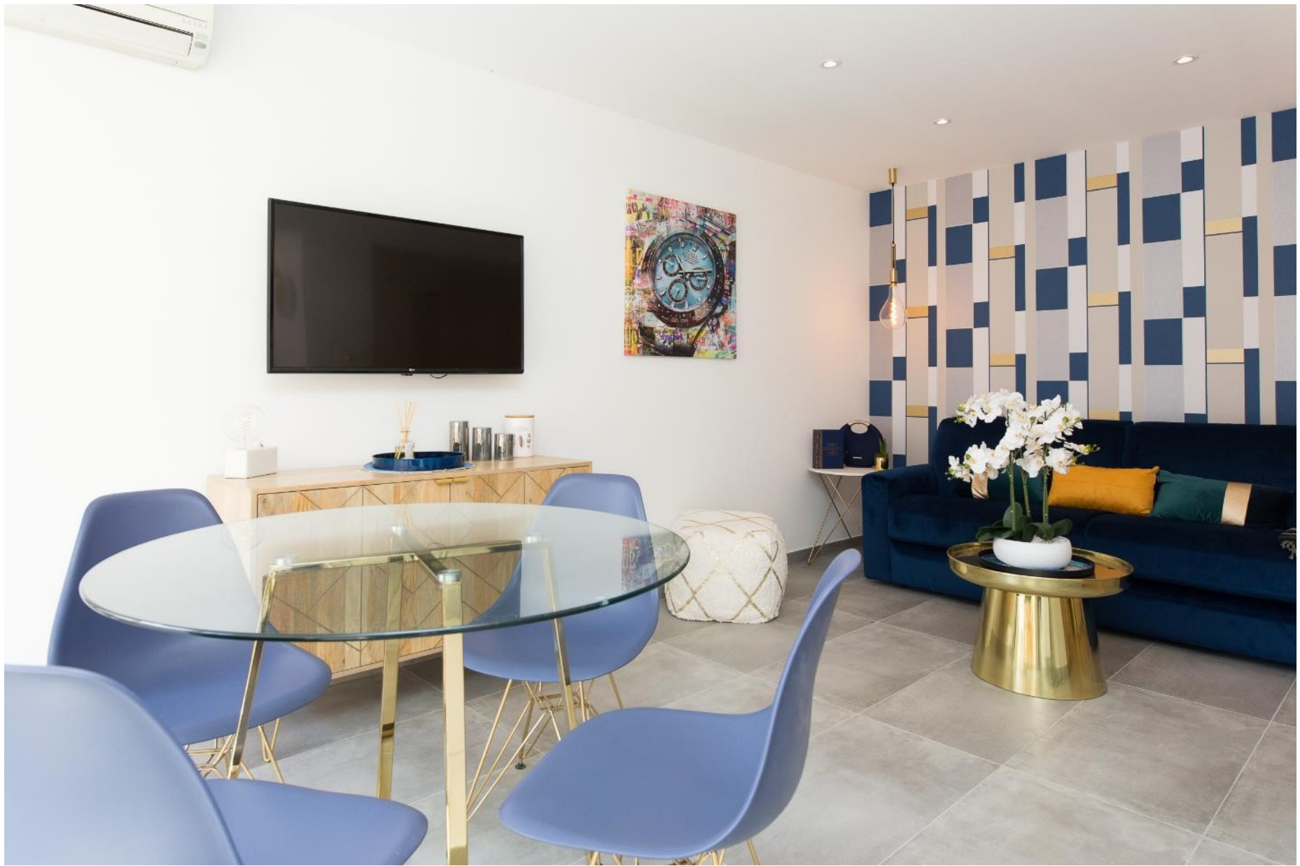
Another view of the living room