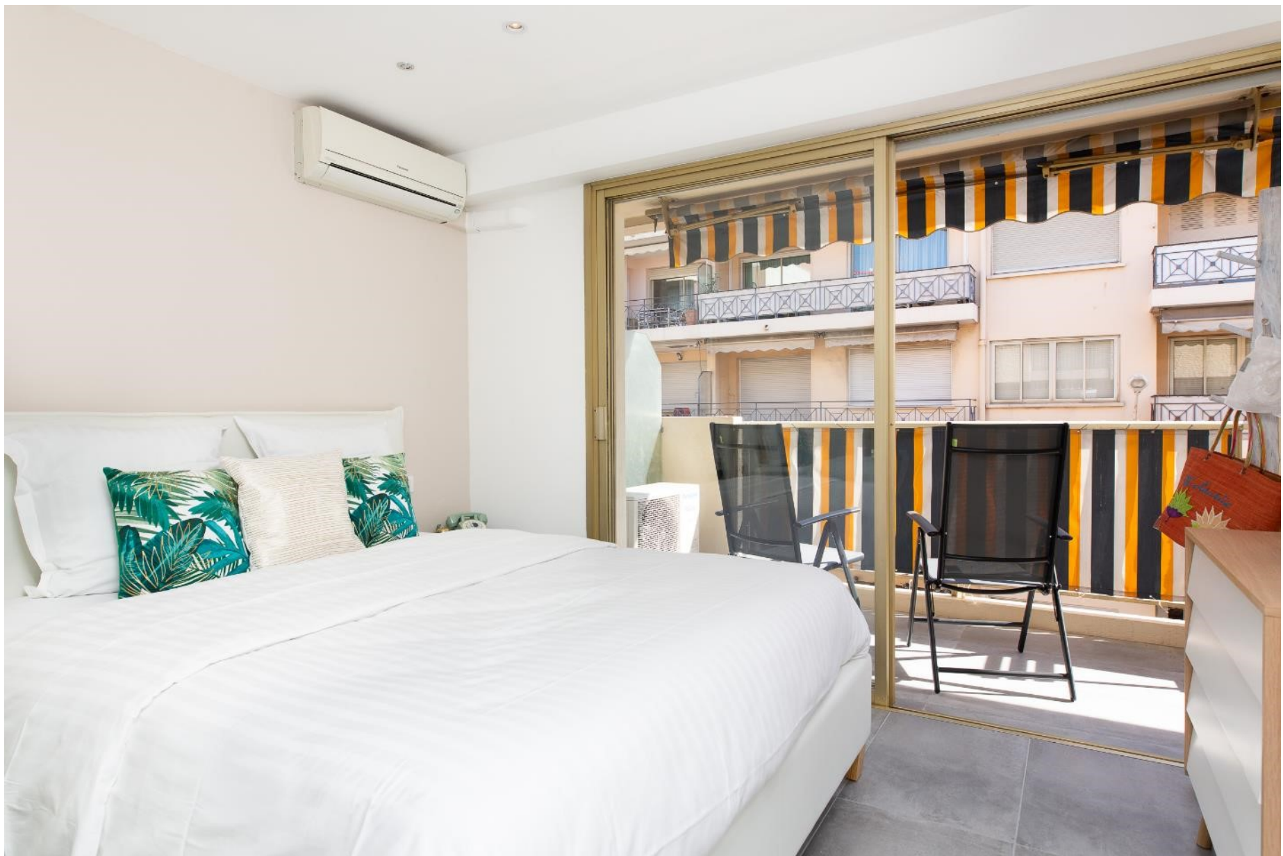
The bedroom opening onto the sunny terrace with lounge chairs