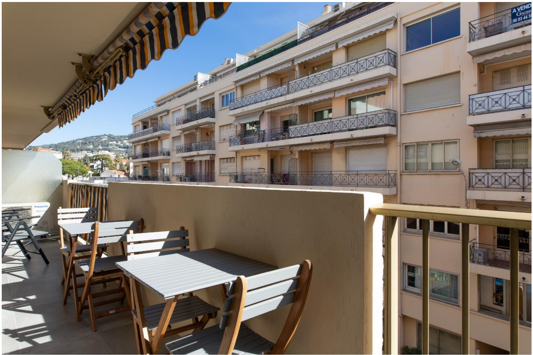
The sunny terrace with tables, chairs and lounge chairs