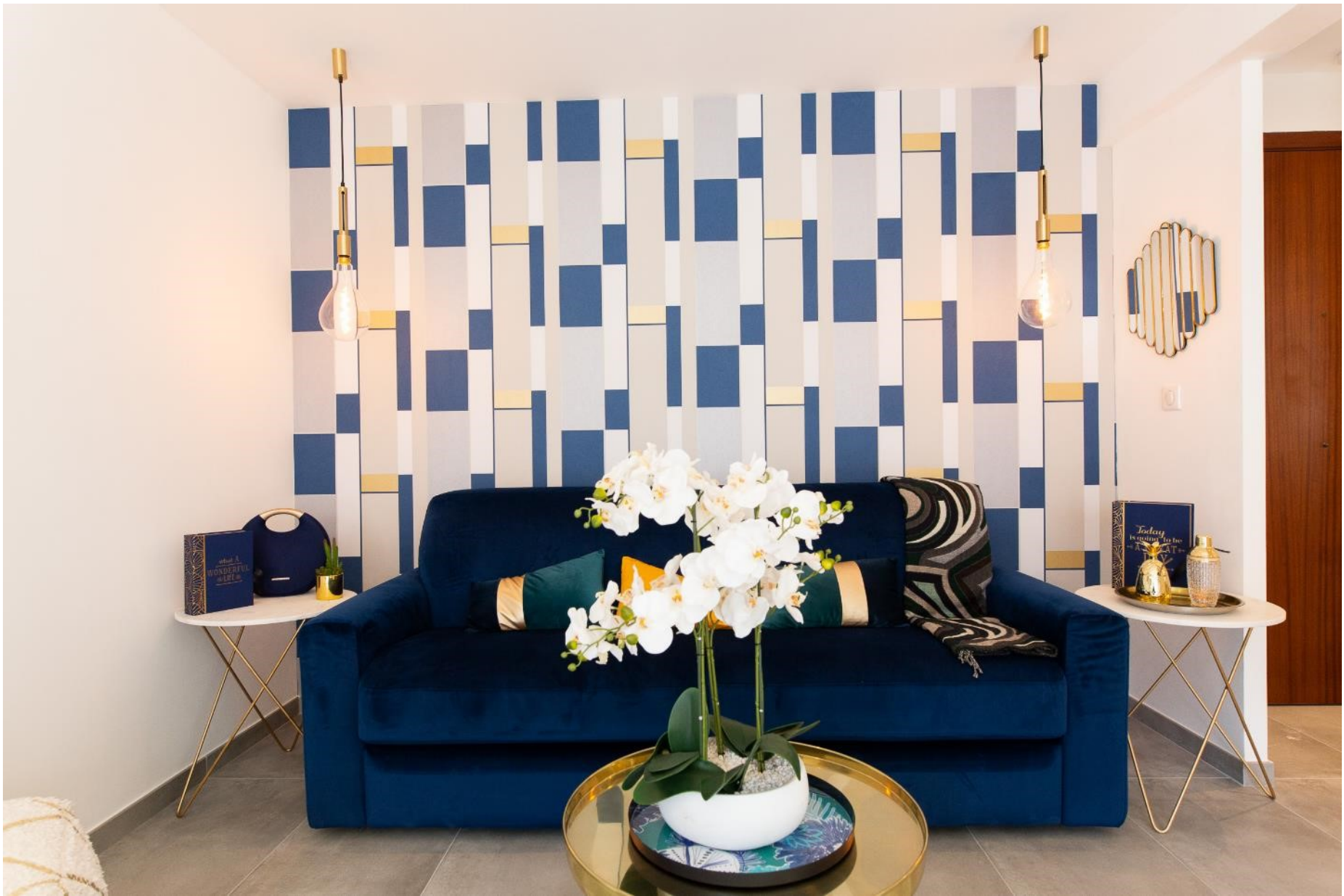
The blue velvet sofa bed with very good quality mattress