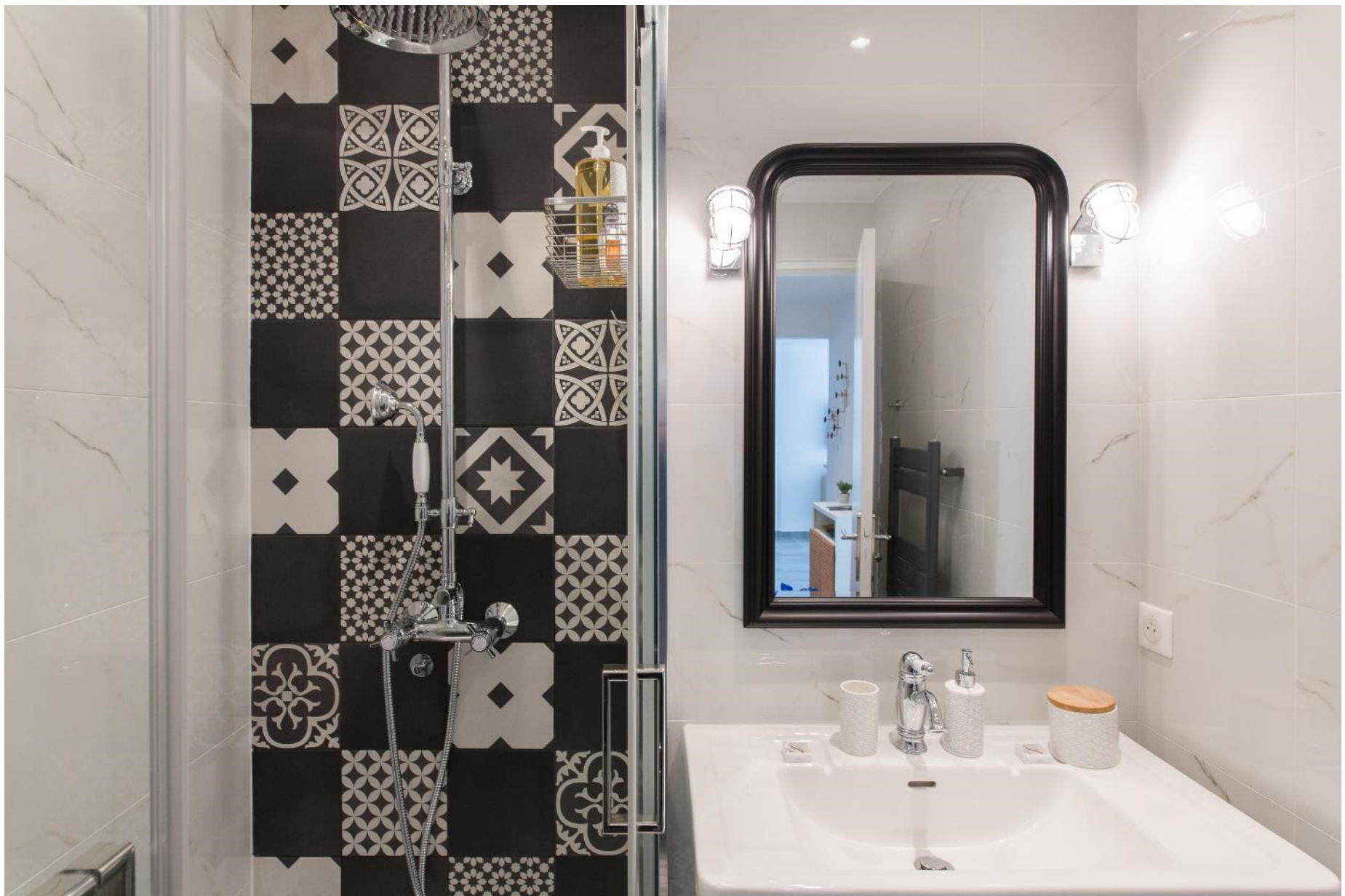
Another view of the shower room