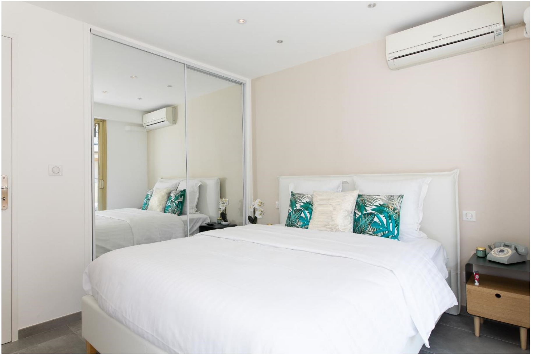
The large cupboards with mirror doors