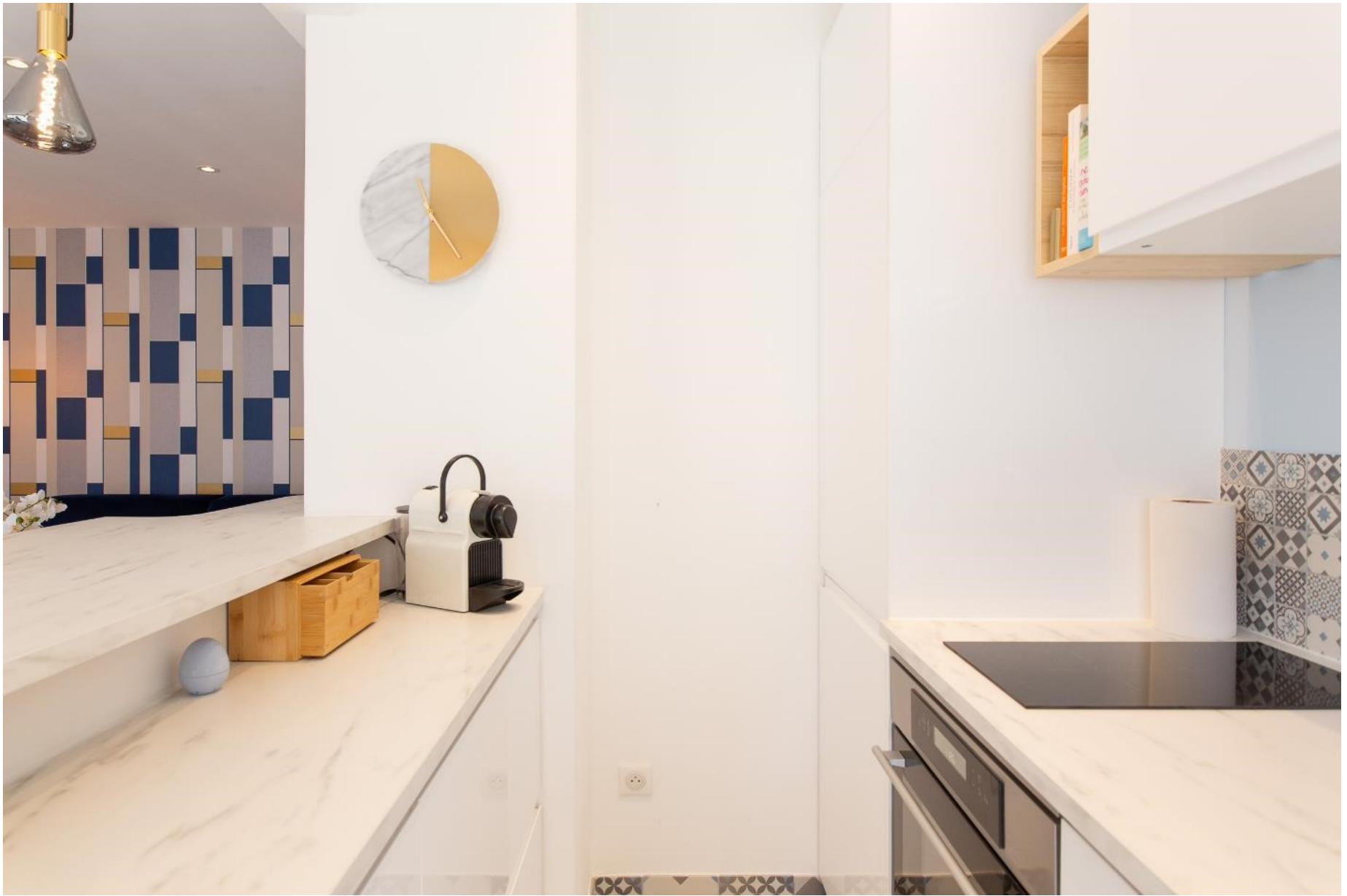
Another view of the kitchen with Nespresso machine