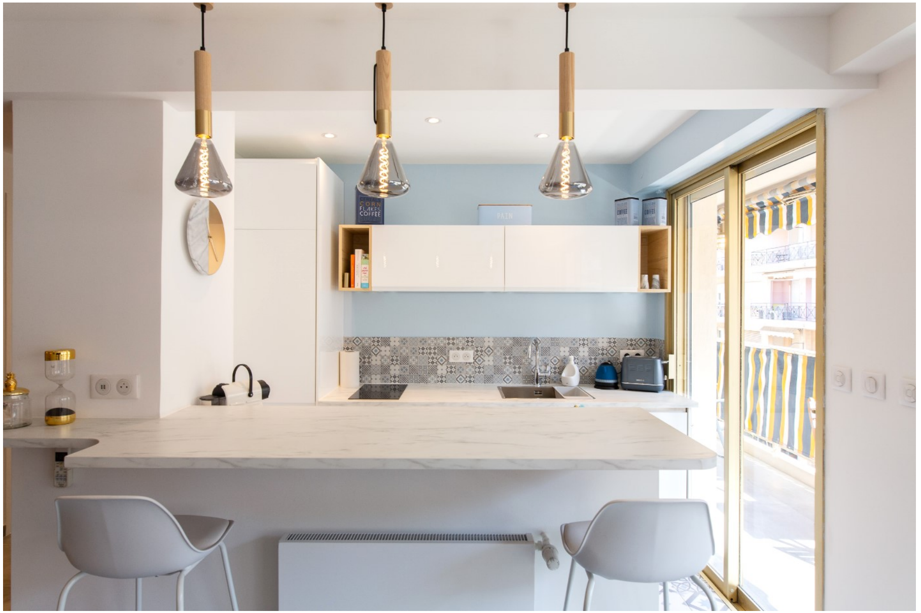
The US kitchen with bar area: please, have a seat...