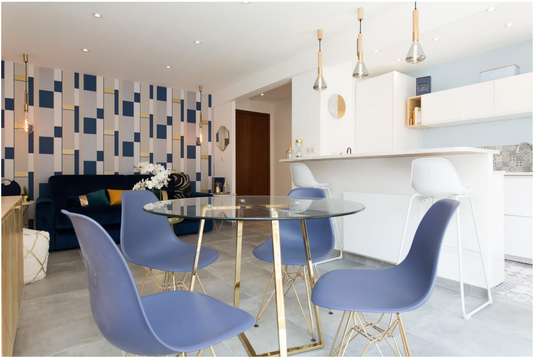
The dining area with glass table