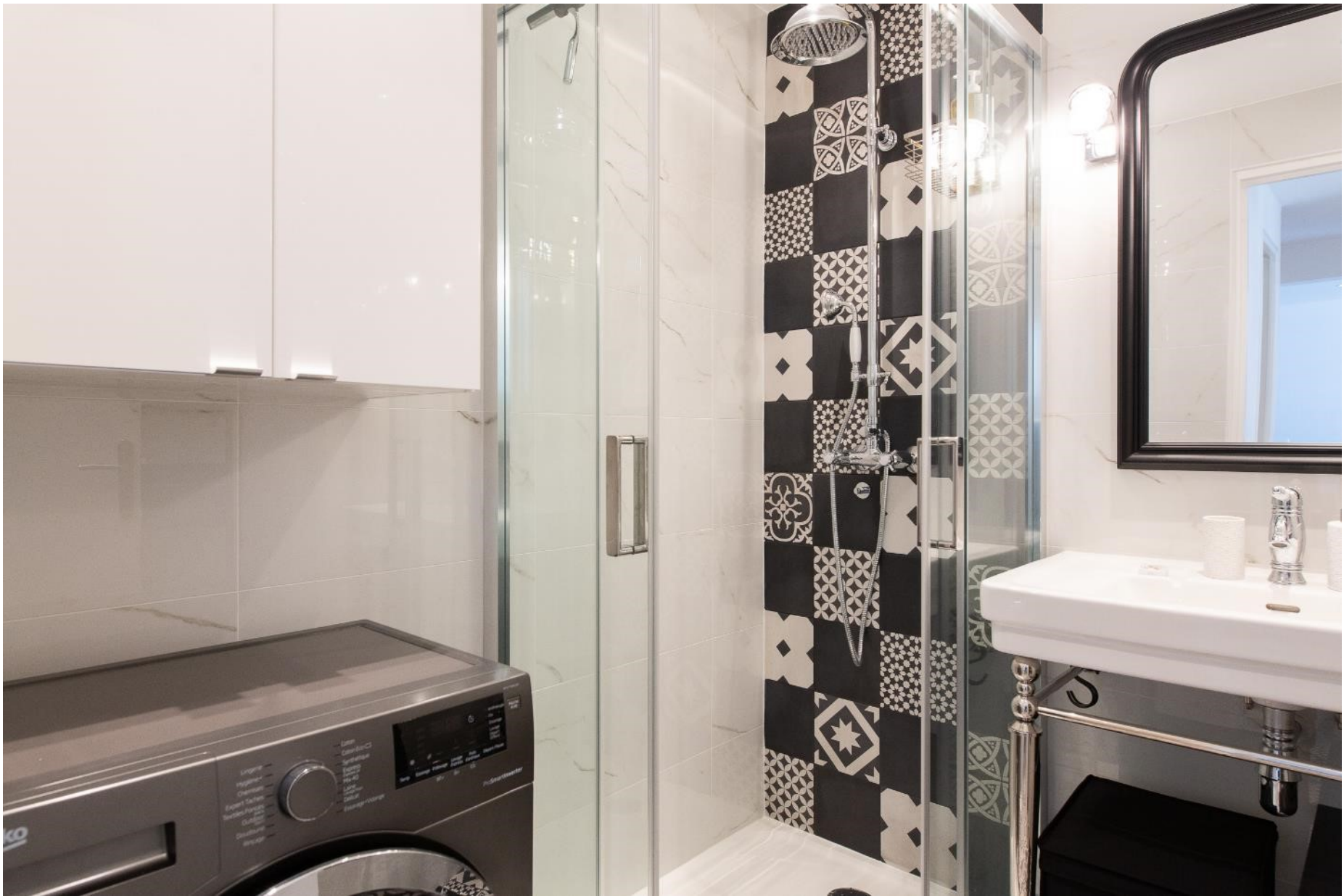
The shower room with washing machine