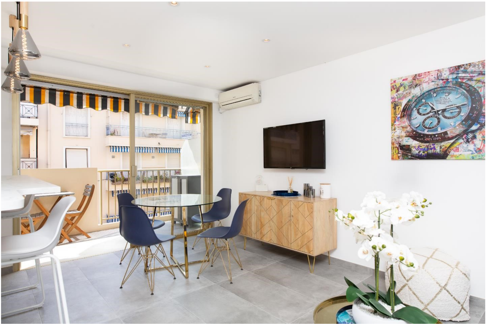
The living room opens onto the sunny terrace