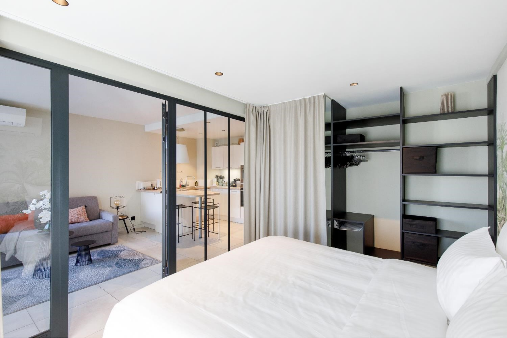
Nice dressing area in the bedroom