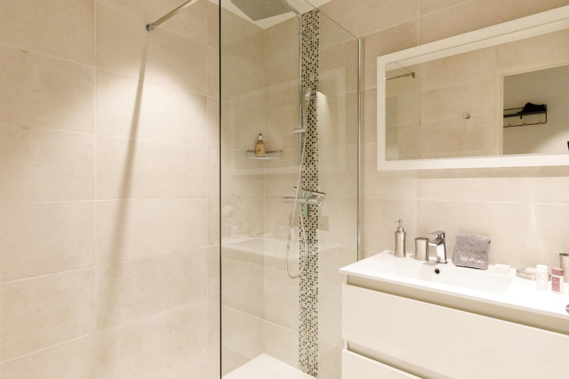
The shower room