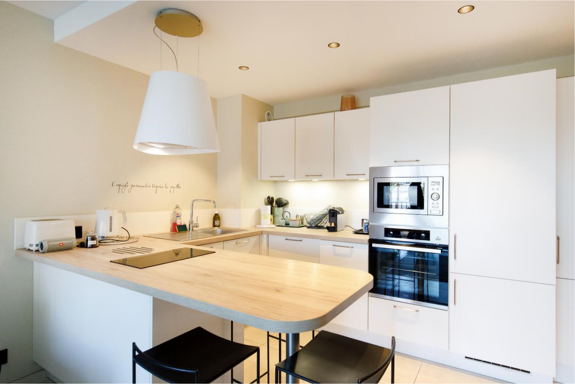
The US kitchen