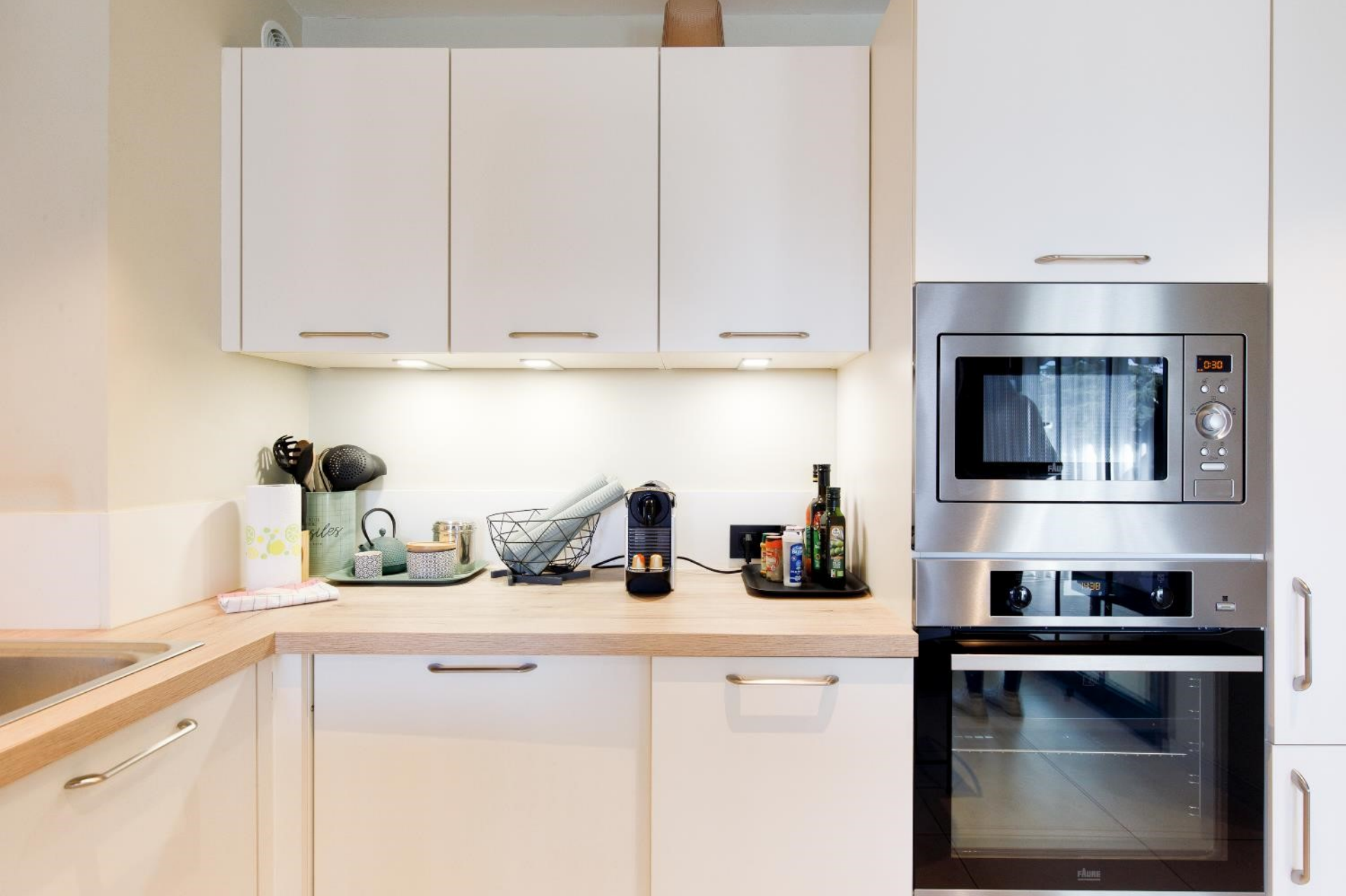
The US kitchen