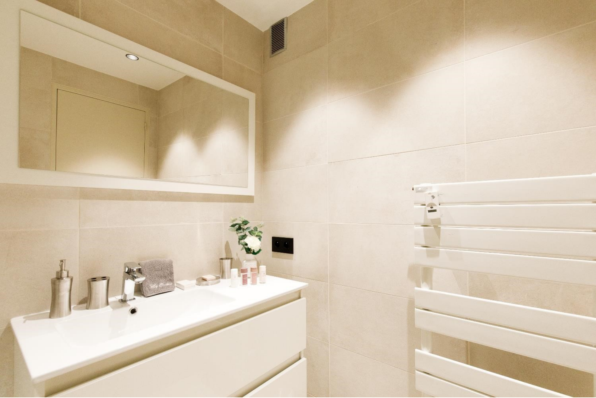
Another view of the shower room