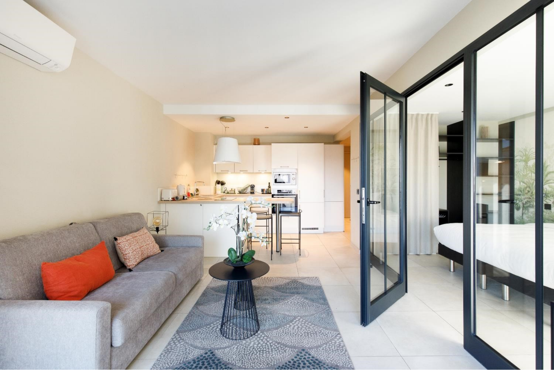
US kitchen in the back