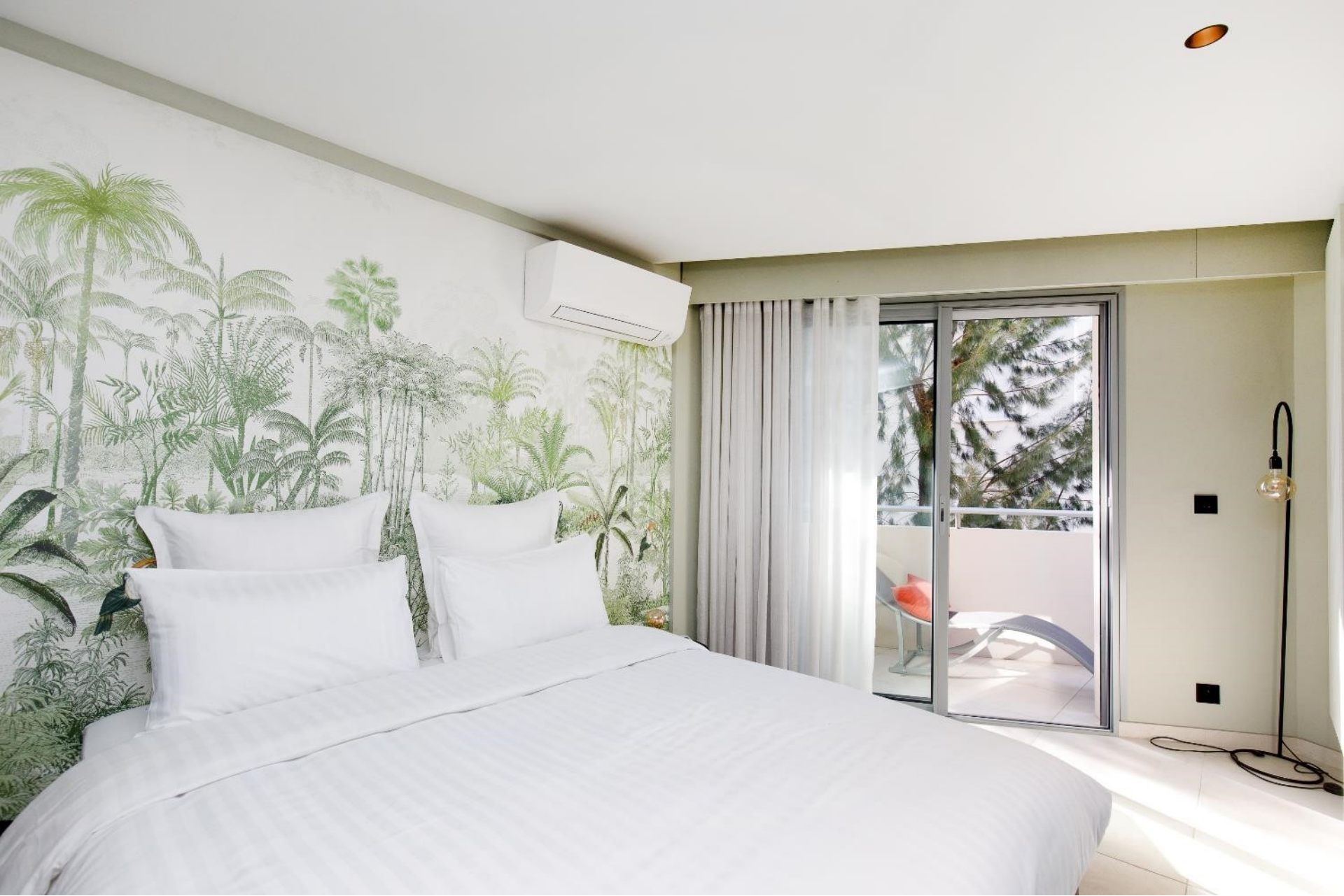
The bedroom opens onto a balcony with a sunchair