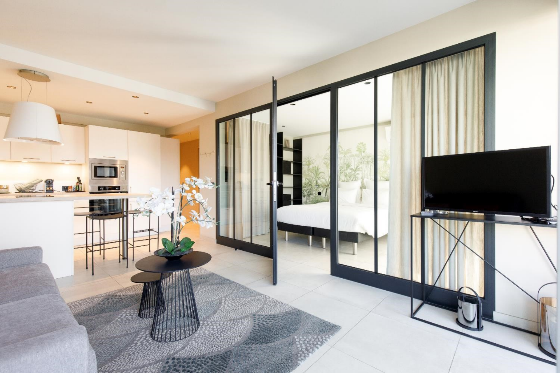
Fully renovated & design apartment