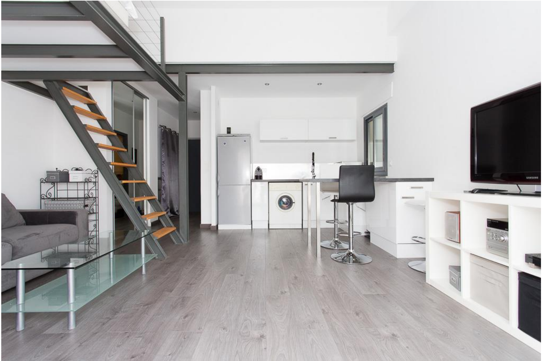
Another view of the main room