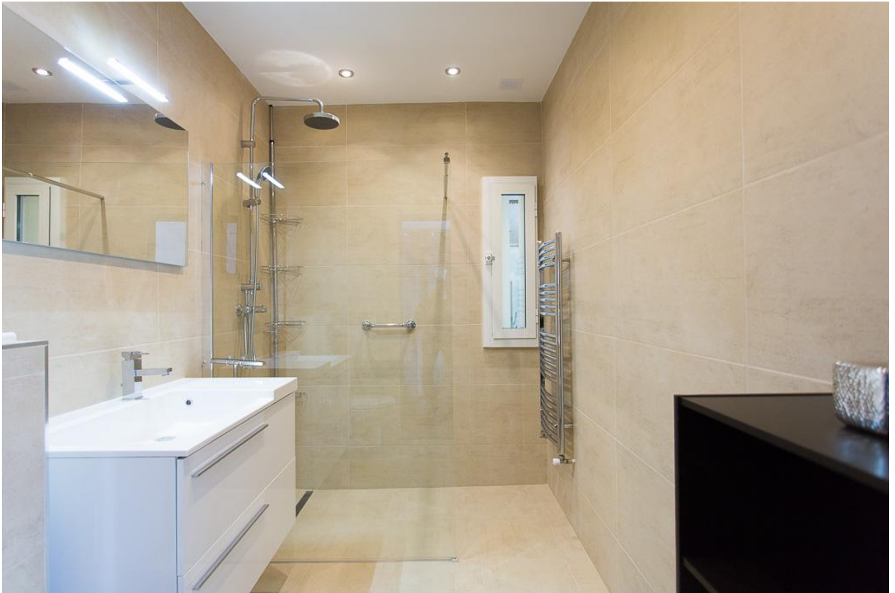
Italian shower room with toilets