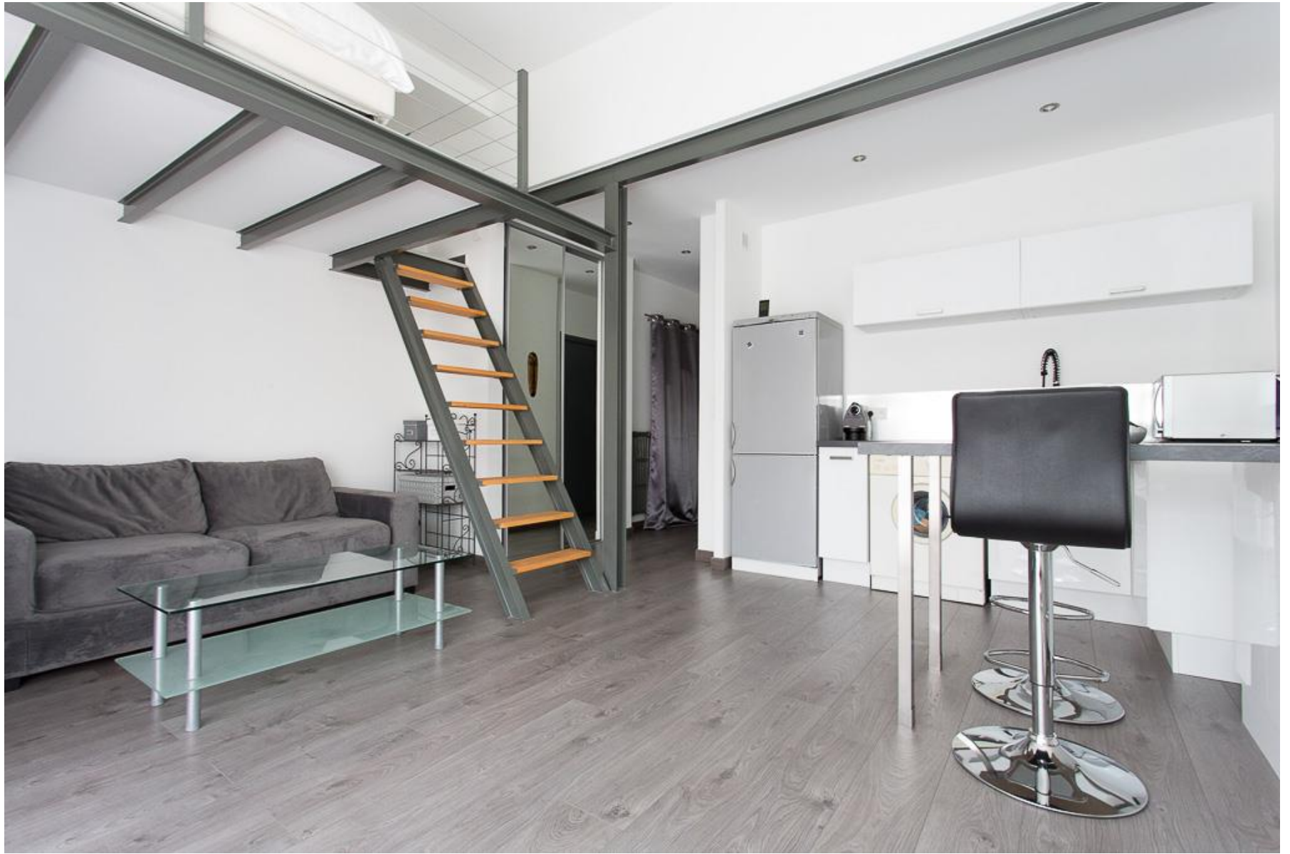
Another view of the main room