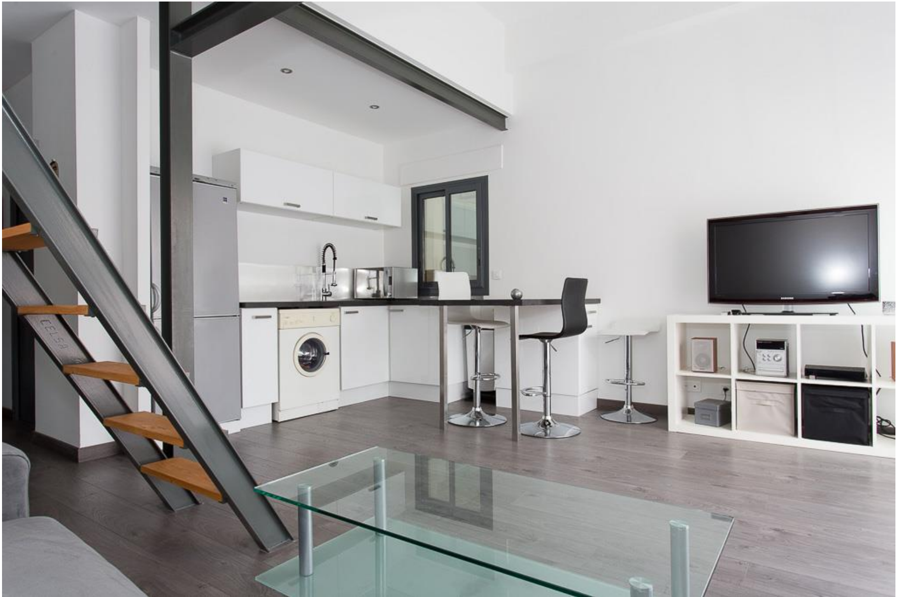
Main room with kitchen corner & bar ear