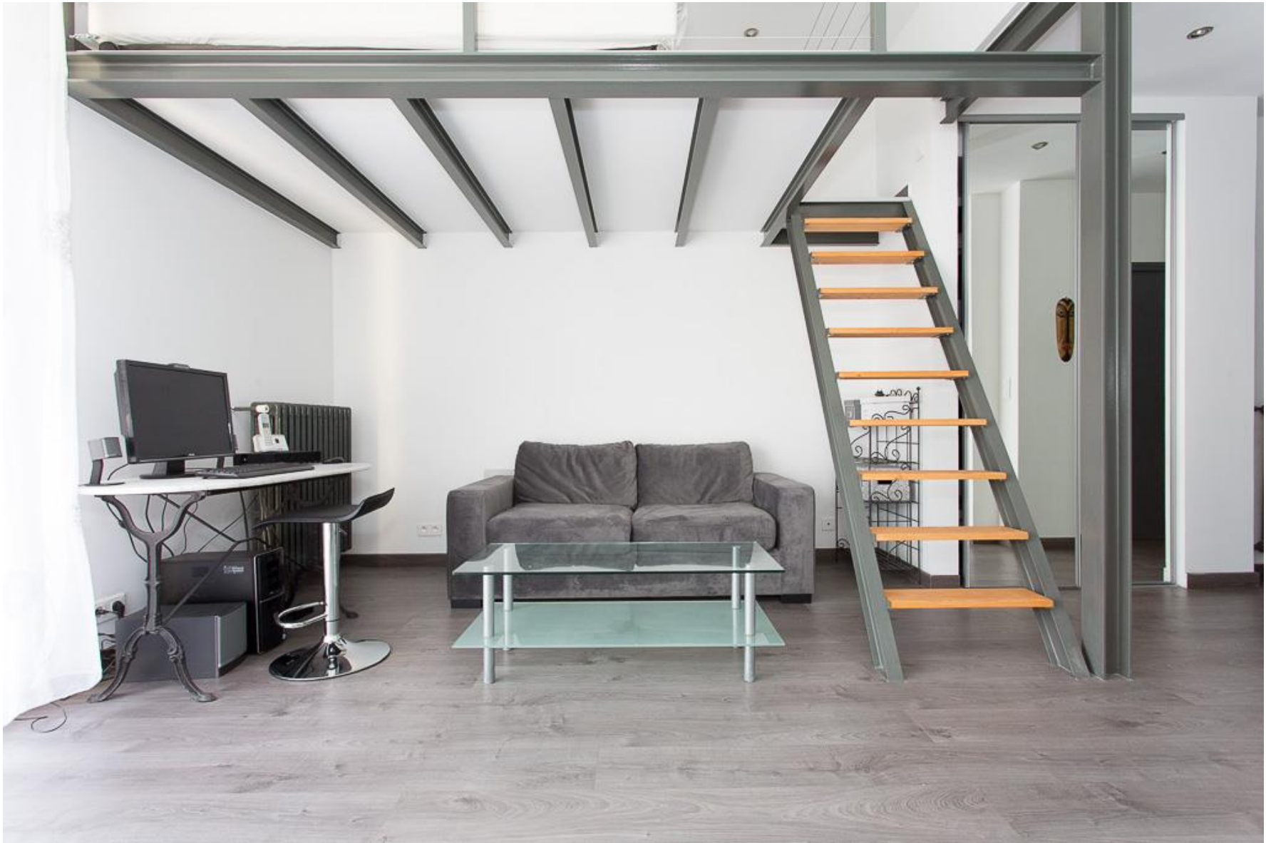
The sofa bed & the ladder to go on the mezzanine!