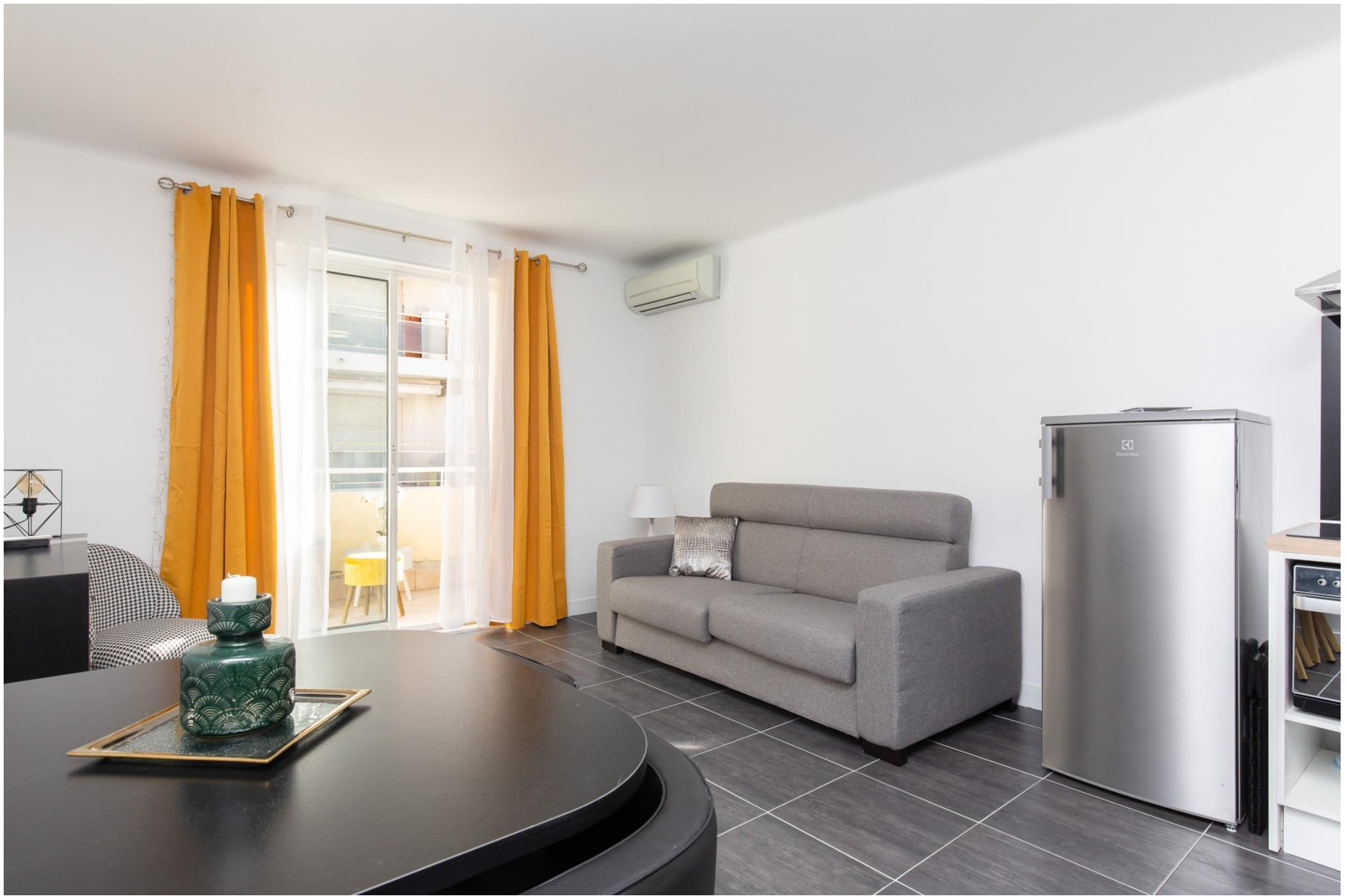
The main room opening onto the terrace with side sea view