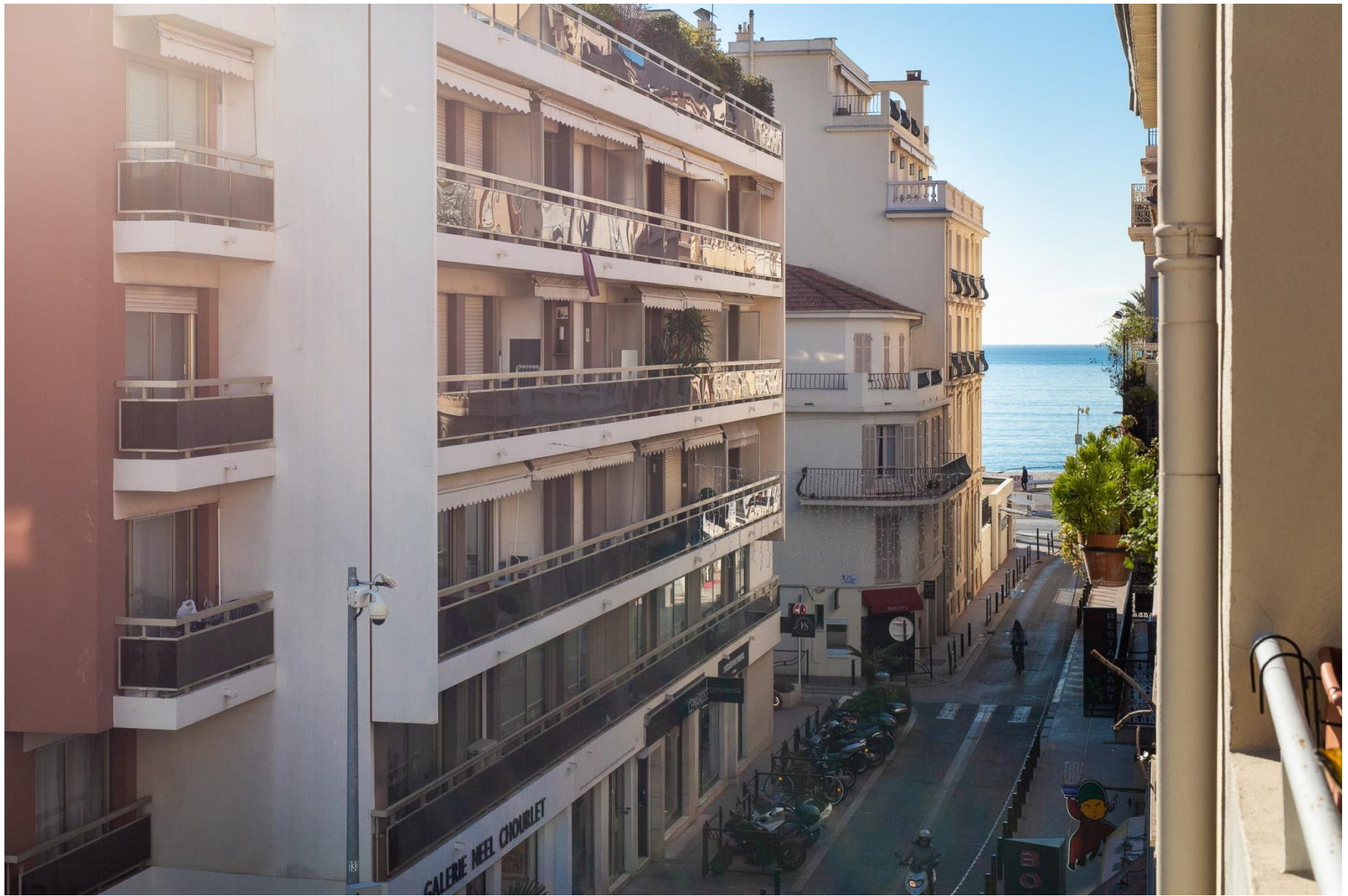
Side sea view when standing on the terrace