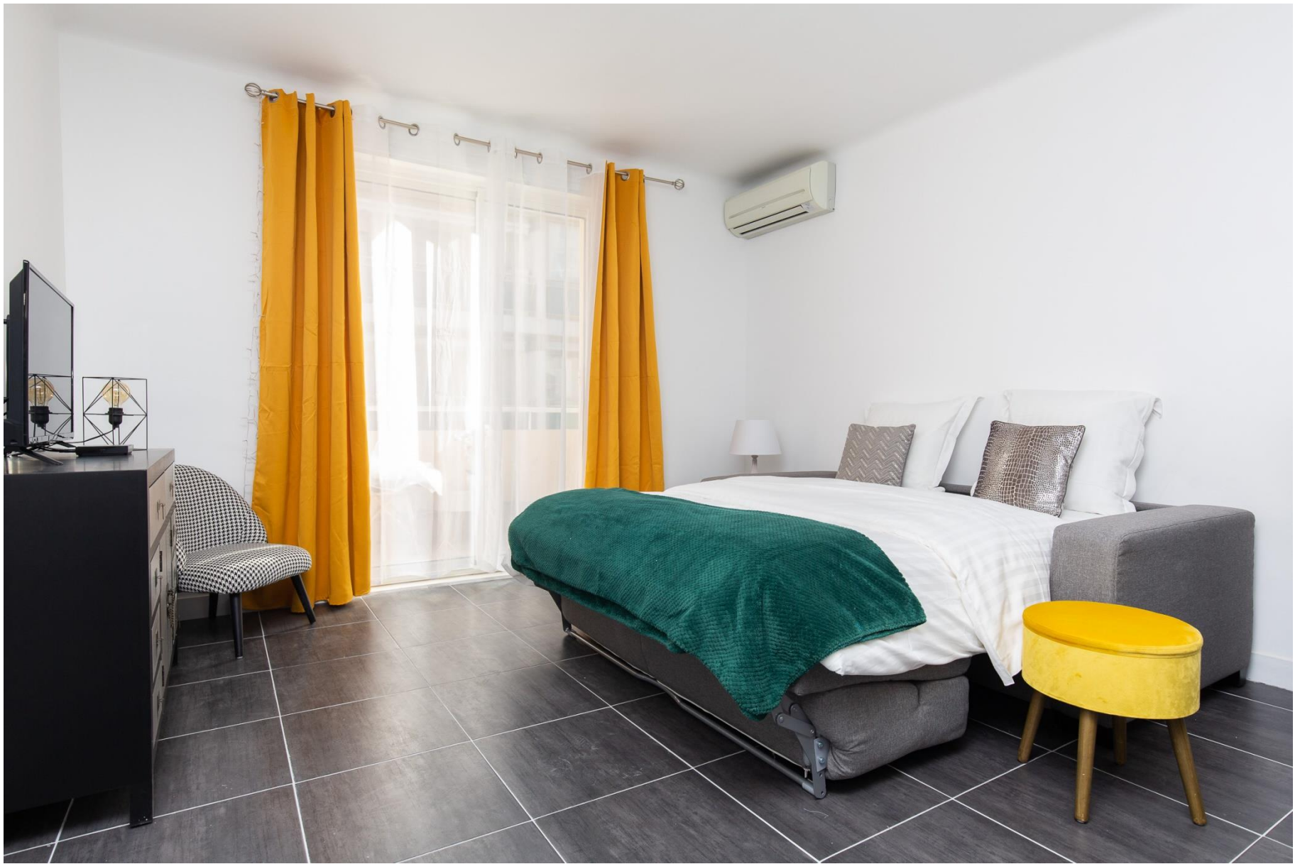
The main room with the sofa bed prepared