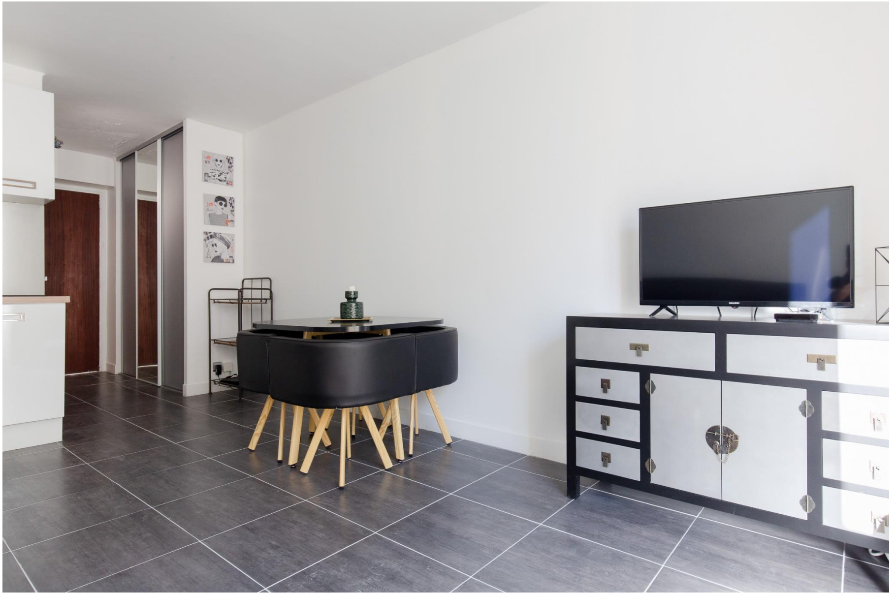
Zoom on the dining area and the entrance with large cupboards and one long mirror door