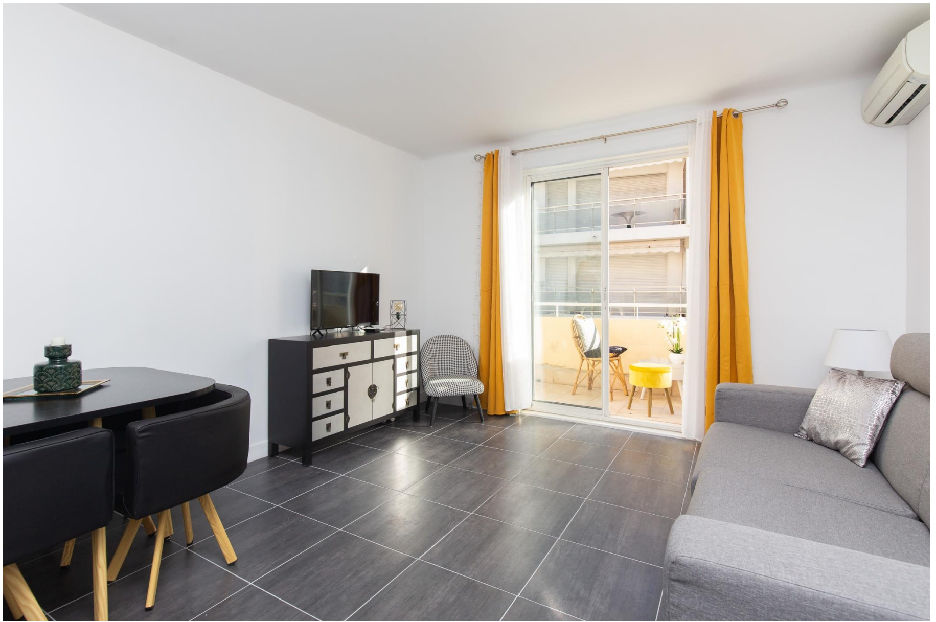
Another view of the main room