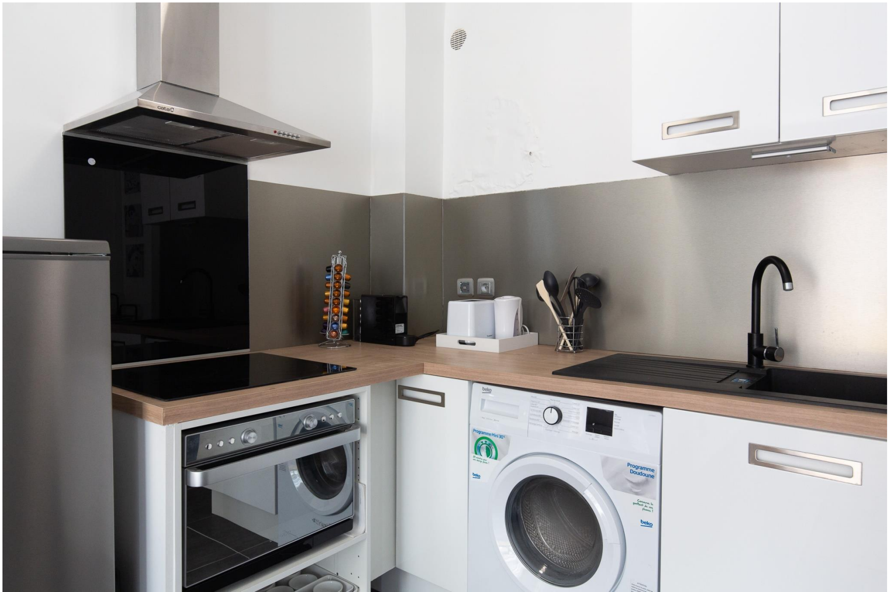
Zoom on the kitchen area