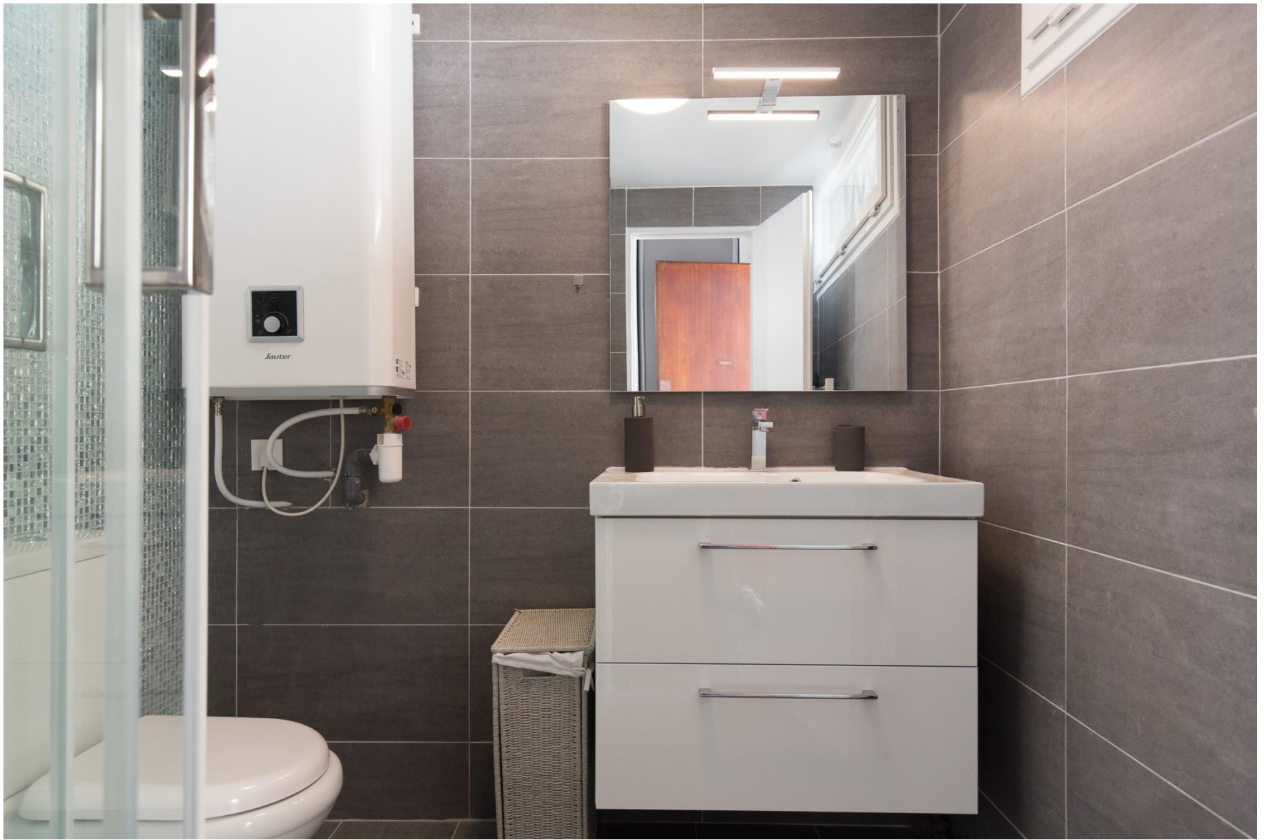
The shower room with toilets