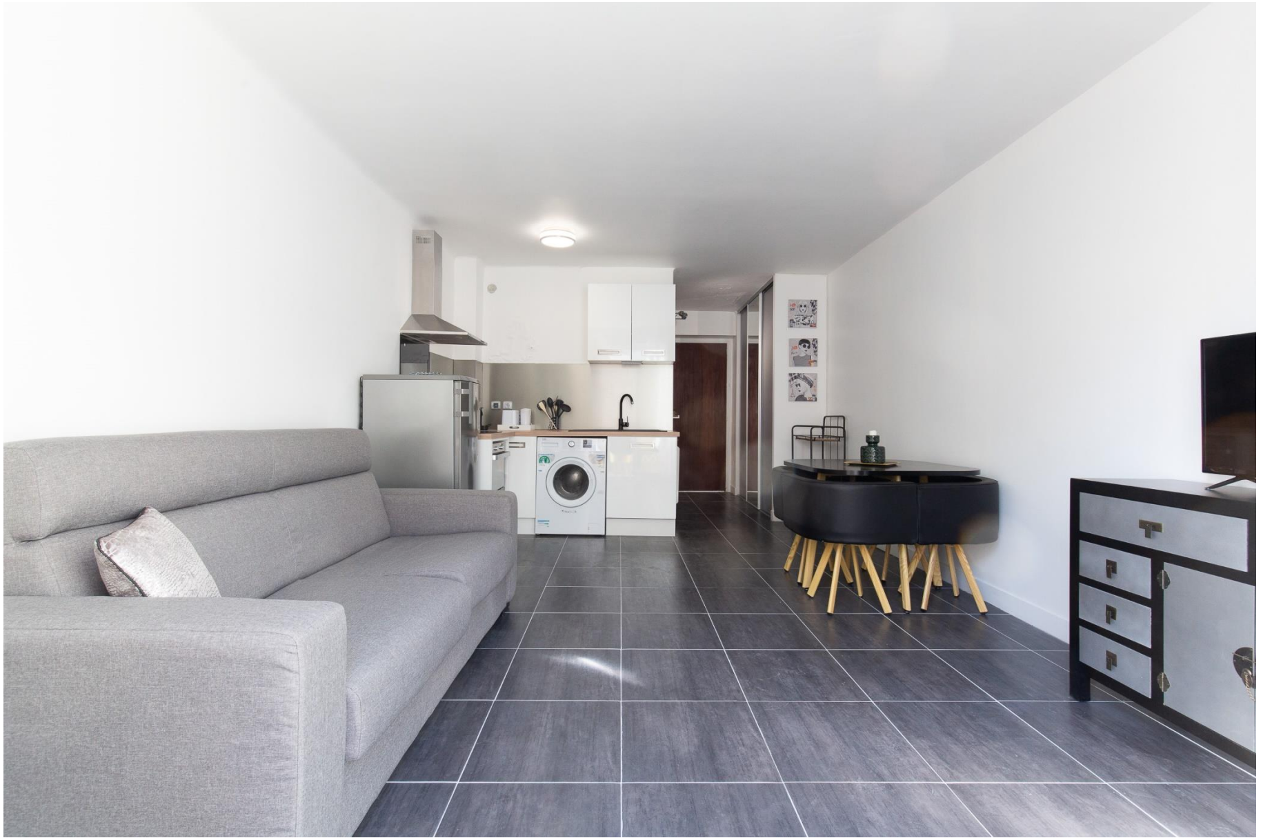
Another view of the main toom with dining area & TV area